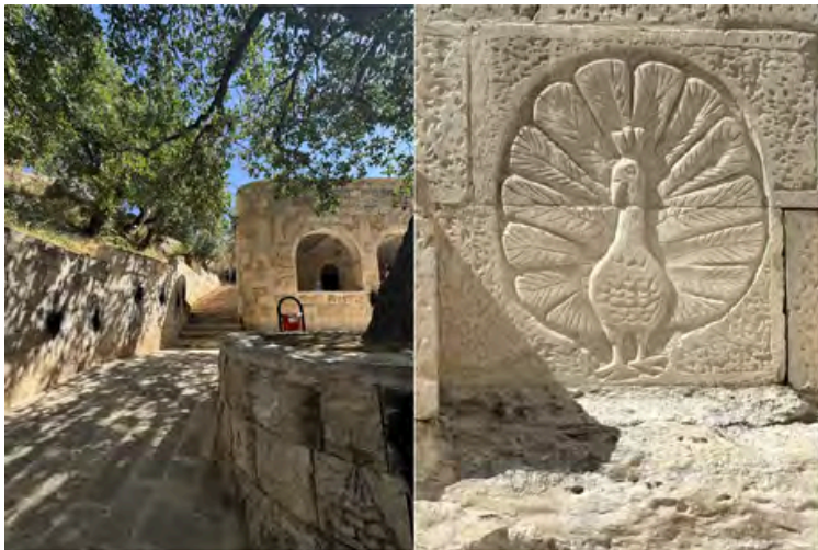
General photo of Lalish (Left) Depiction of peacock angel Tawûsî Melek (Right)