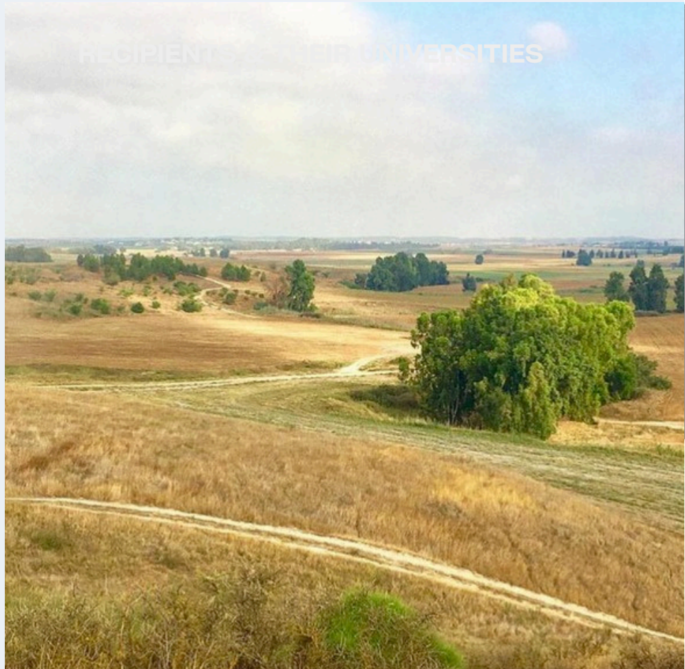
View from atop Tell el-Hesi.