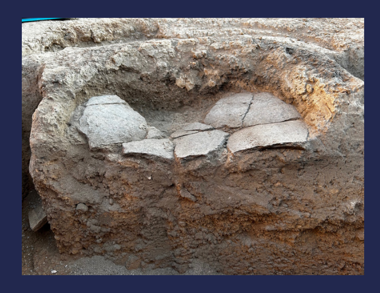
A cross section of one of the various cooking instillations excavated this year.