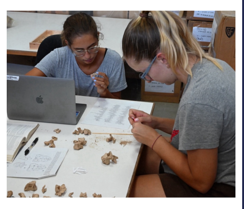
Coding and cleaning of fragmented skeletal elements from the Ancient Kition excavations

University of Edinburgh Ancient Kition, Cyprus