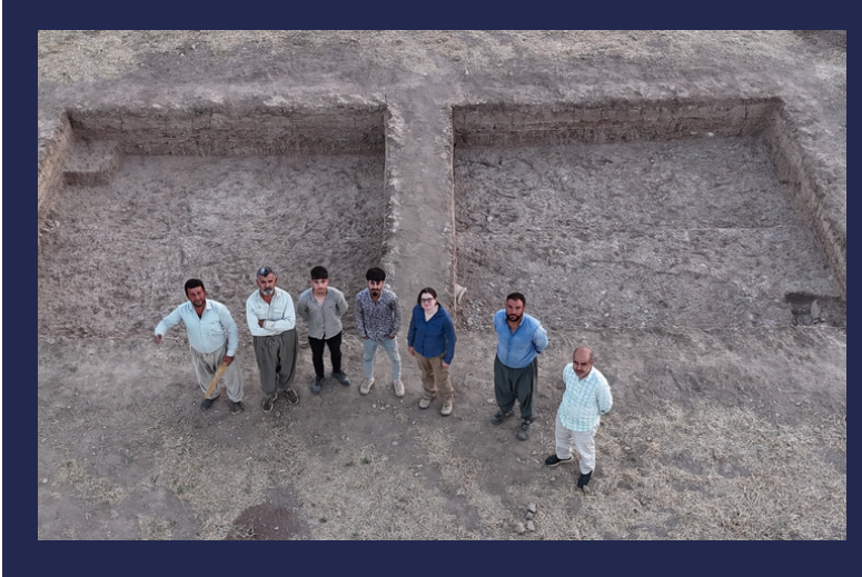
Group photo by the trenches