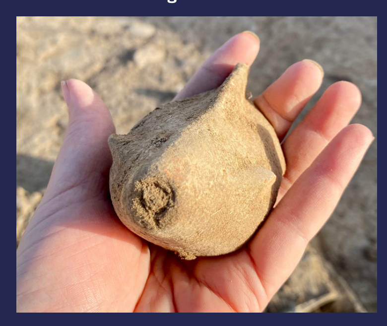
Ceramic fish at moment of discovery