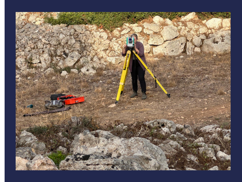
Evelyn taking points of SPU 7 at the total station.