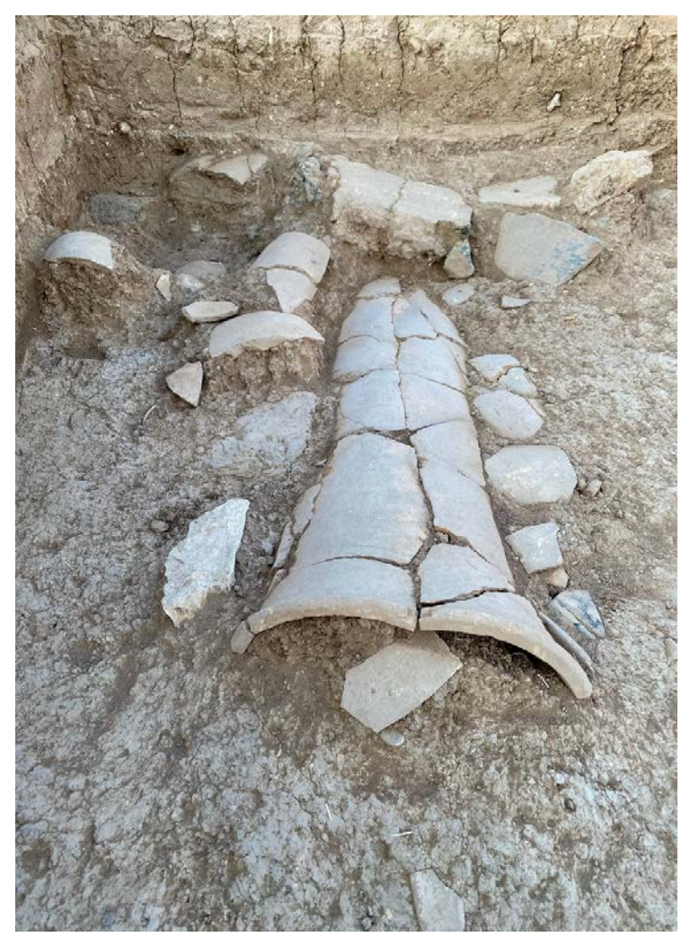
Ceramic drain -view facing south

Johns Hopkins University Kurd Qaburstan, Iraq