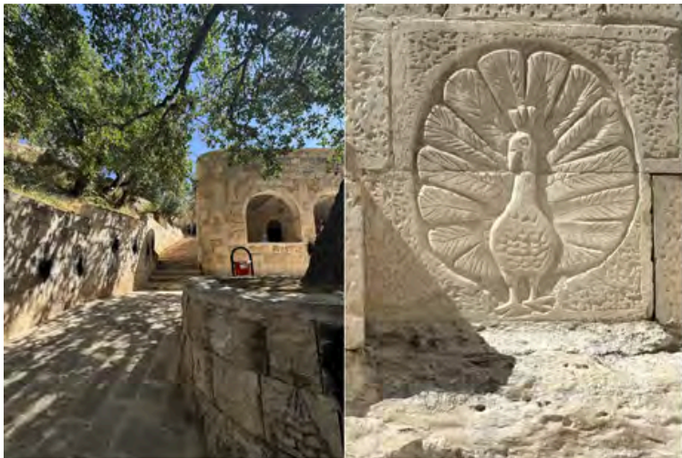
General photo of Lalish (Left) Depiction of peacock angel Tawûsî Melek (Right)