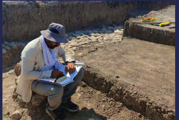
Working on a square plan