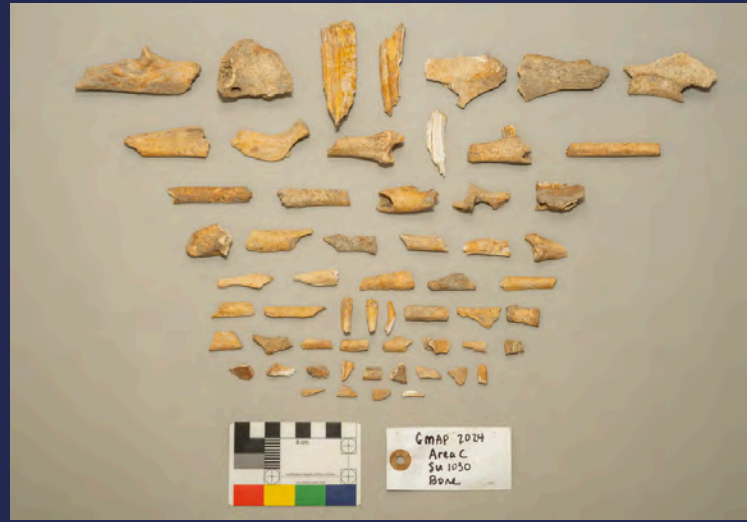
Selection of faunal remains from Area C