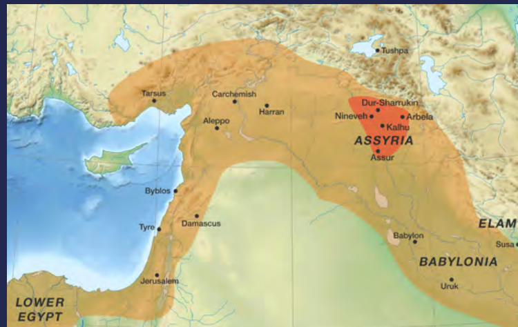
Map of the Assyrian empire, showing its extent in the 7th century and the Assyrian Heartland in Red. Qach Rresh is located just south of Arbela.