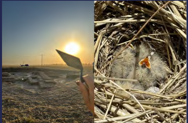
Sunrise photo at area A (Left) Baby birds nested on project site between areas (Right)