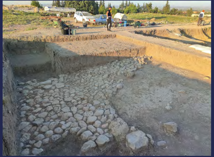
Iron Age Stone Pavement that has been disturbed