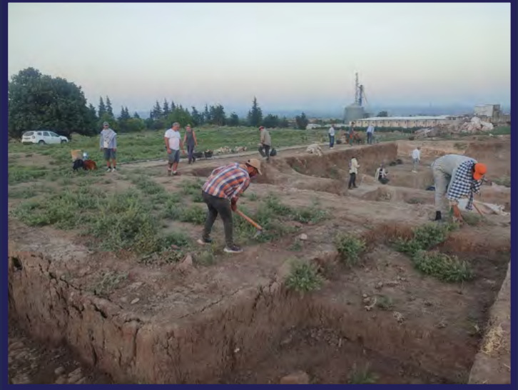
First day of excavations