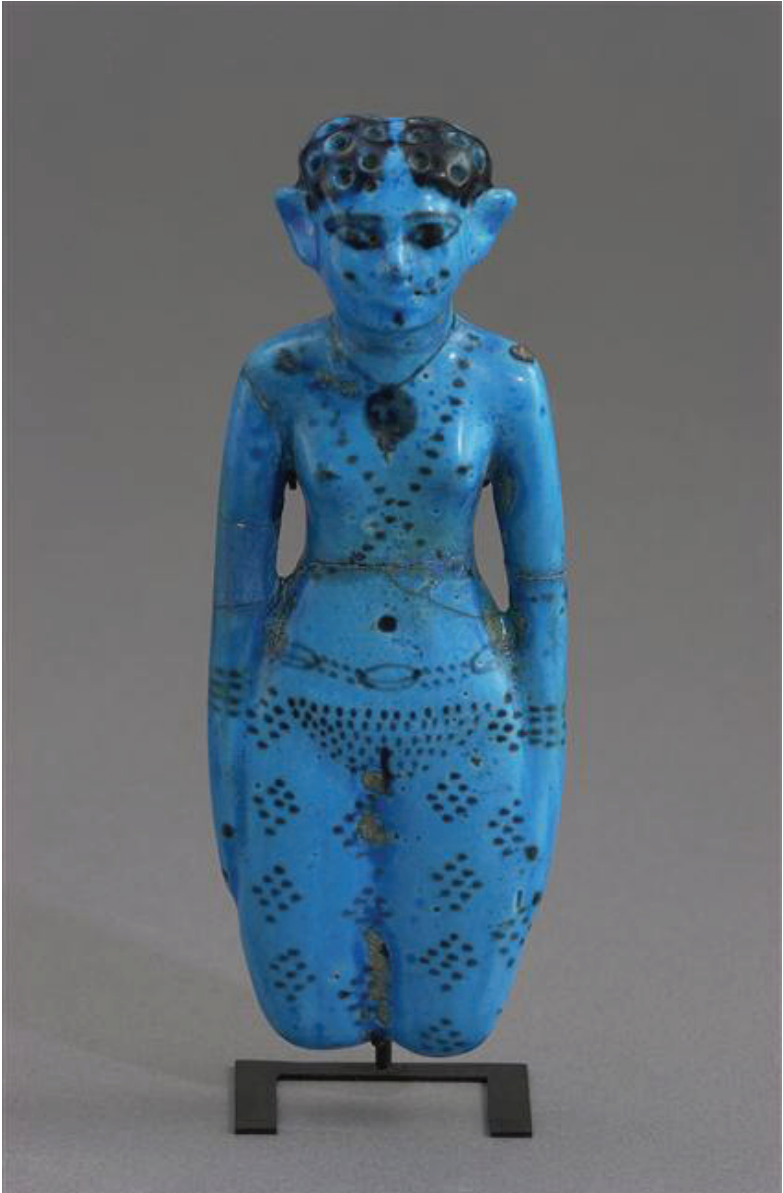
Figure 2. Tattooed figurine belonging to Neferhotep the Bowman