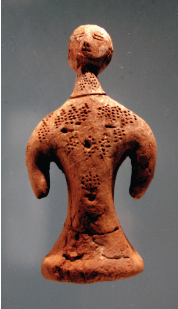
Figure 3. Tomb 51, Cemetery T, Adindan, C-Group Phase IIb.