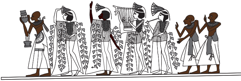
Figure 5. Dancers from Tomb of Ki-Nebu TT 113. From Henri Wild, Kush 7 (1959): pl. XIX.

Thebes (TT 113) 47 contains a wall painting of four female dancers, three of whom were daughters of Ki-nebu. The fourth dancer, a black woman, bore the Egyptian name Rekhtoui-em-Mut. 48 Dressed, like the daughters of Ki-nebu, in a diaphanous full-length gown, which fully reveals her body through the sheer fabric, Rekhtoui-em-Mut alone wears earrings and bracelets, her forearms decorated with tattoos. 49 In each of several scenes, the dancer raises her right arm, her left arm extended down behind her.