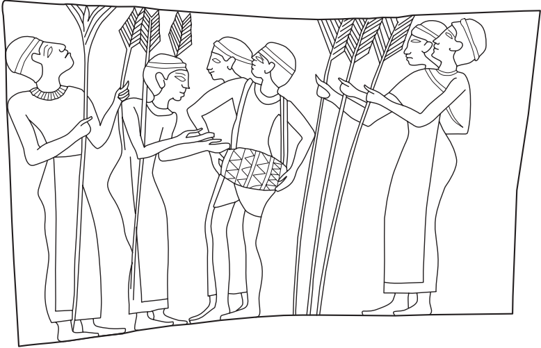
Figure 6. Performance of the “Neck Dance” depicted on the pylon of a Meroitic royal burial (Beg. N 11).

ers is compelled at least to go through this once, and the nearer the relationship so much the more frequently is it repeated. 64