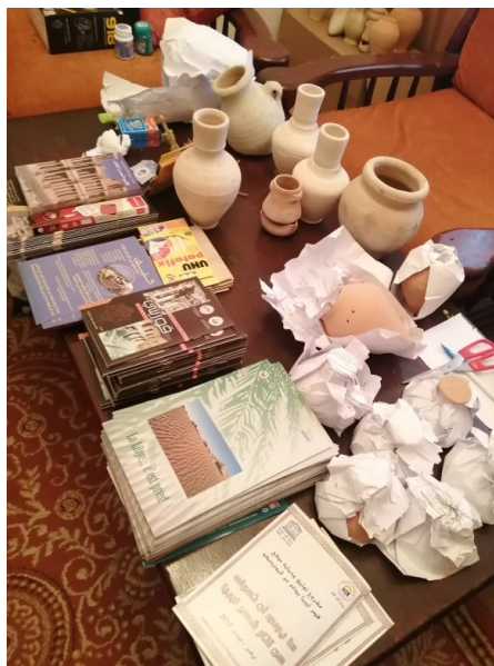
New Materials for the Suitcases