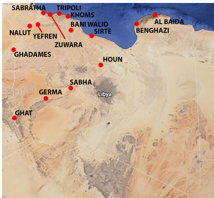
Map Showing Current (2020) "Suitcase" Locations