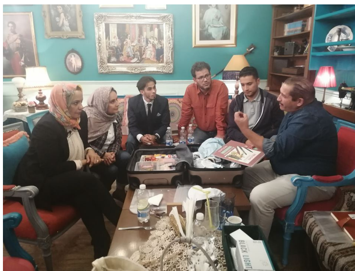
Training for Teachers and Leaders to use suitcases.