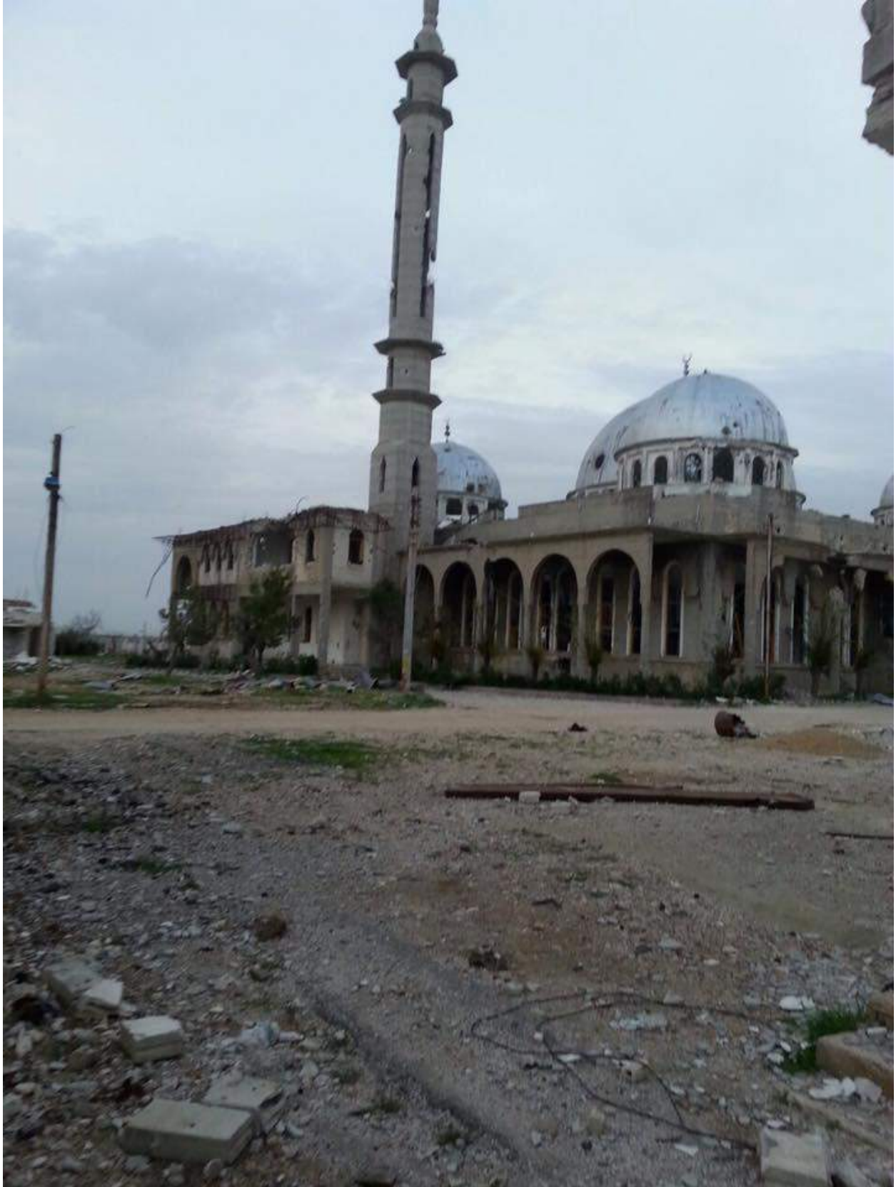
Severe damage to al-Nur Mosque and its minaret (Ter Maalah Direct; March 22, 2016)