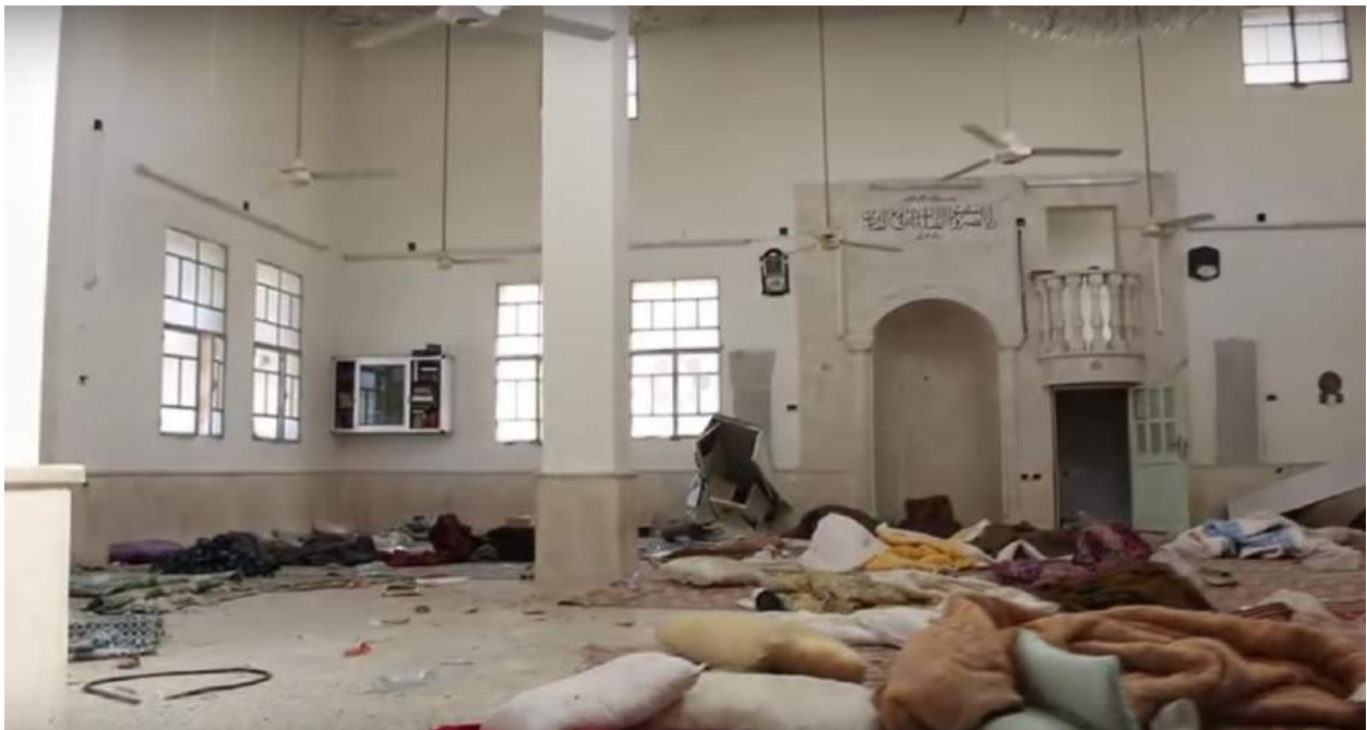
Video still of the interior of Khaled Bin Al Walid Mosque showing minimal damage and possible use as sleeping quarters (April 3, 2016)