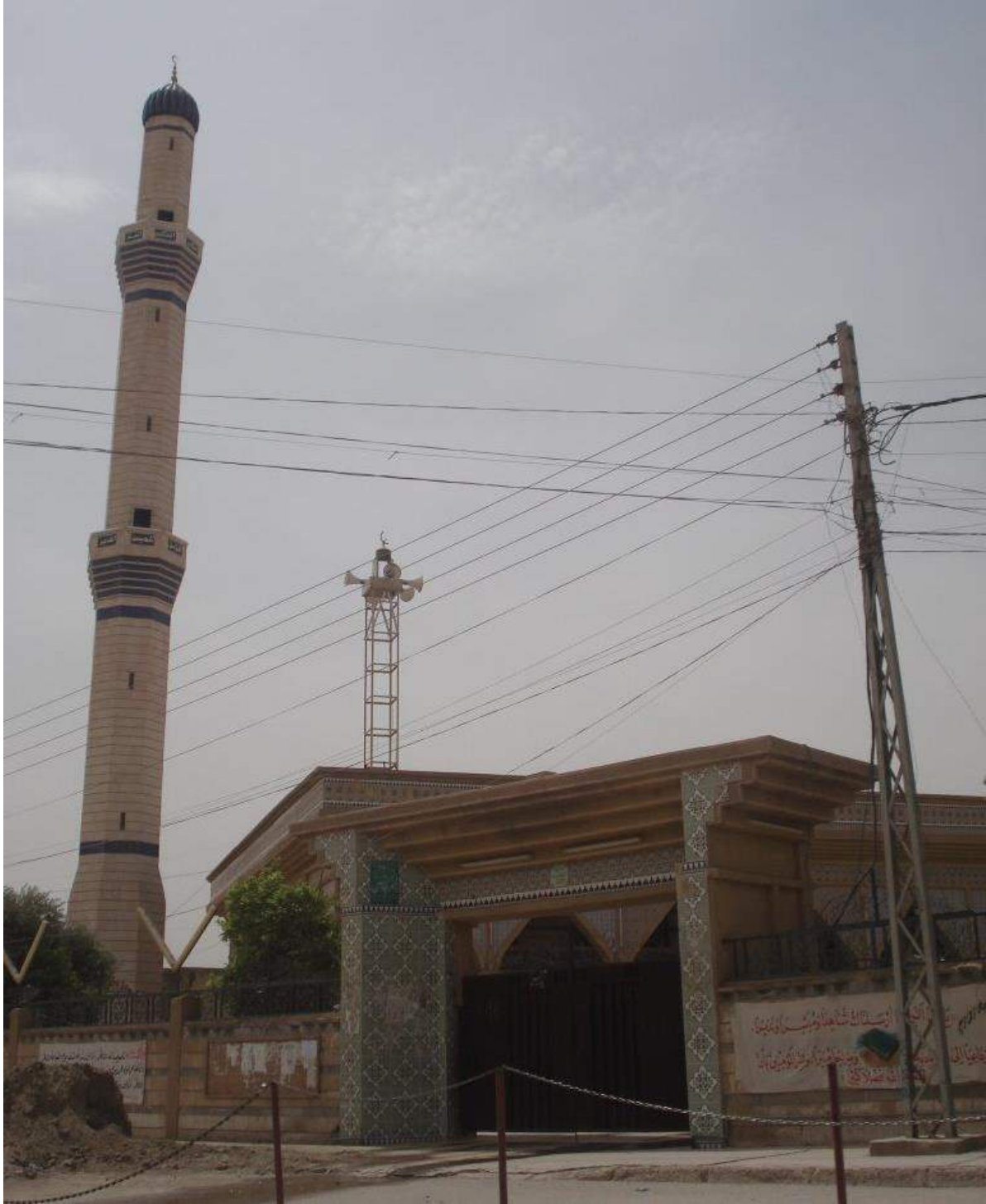
Al Firdous Mosque