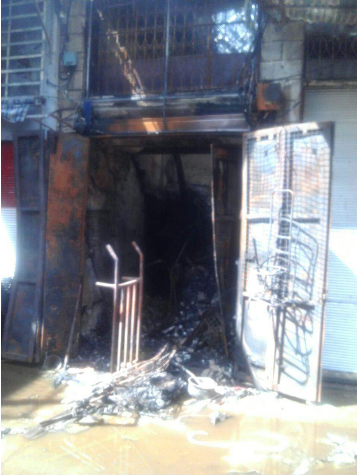
Fire in Suq Asruniyeh area (DGAM; April 23, 2016)