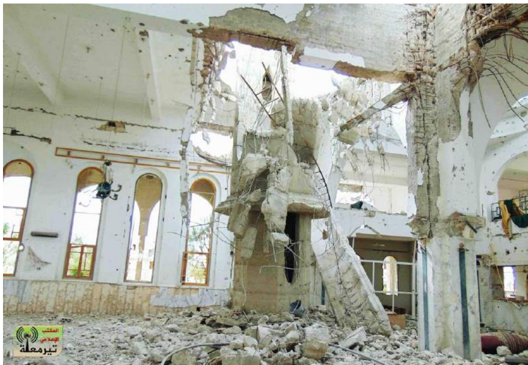
Severe damage to al-Nur Mosque (Ter Maalah News Network; April 12, 2016)