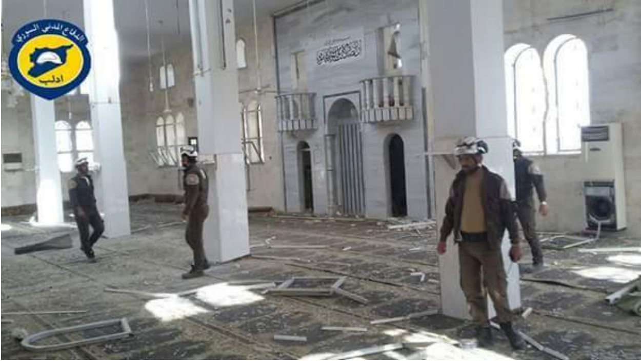
Damage to the interior of Al Gharbi Mosque (SNHR; April 15, 2016)