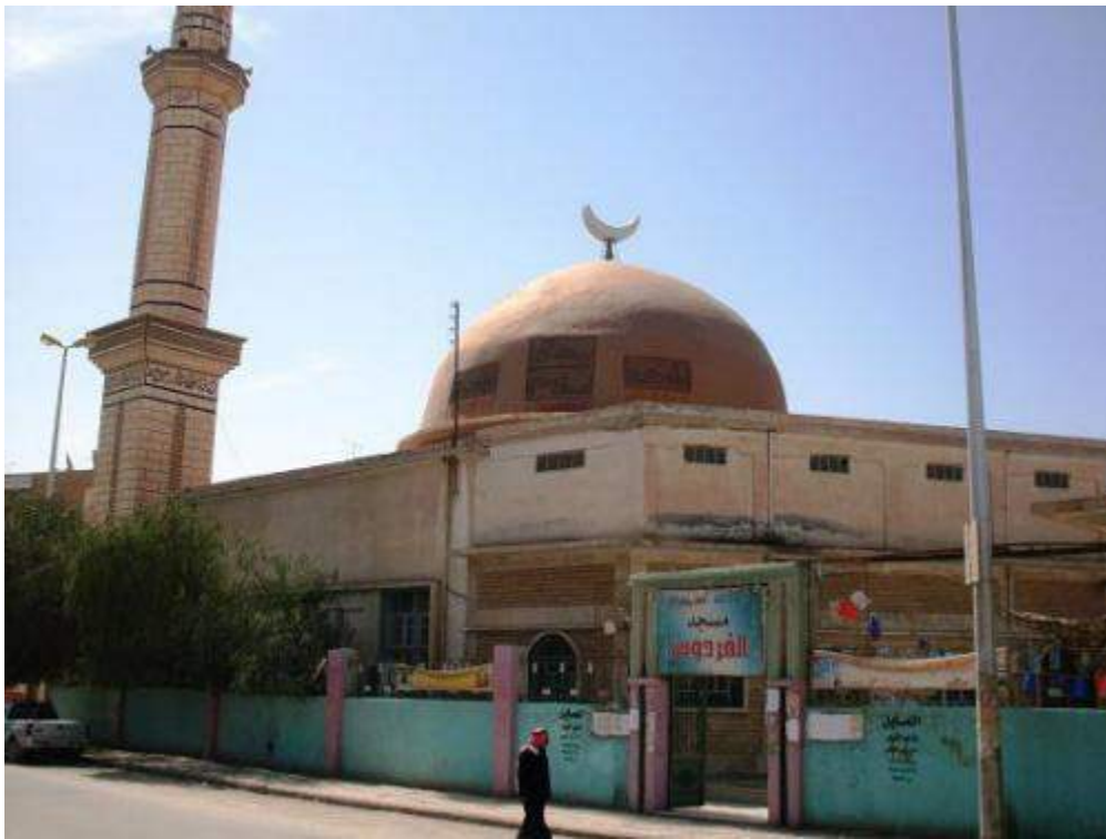
Photograph of Al Firdous Mosque prior to damage (ESyria; 2009)

Raqqa Unified Media Centre: https://www.youtube.com/watch?v=kr0MxTS_TA