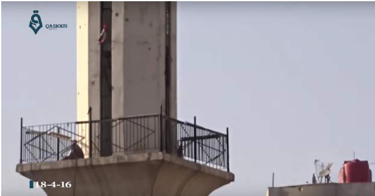
Video still of possible SARG fighter stationed on the minaret of Al Ghoufran Mosque (SHRC; April 18, 2016)