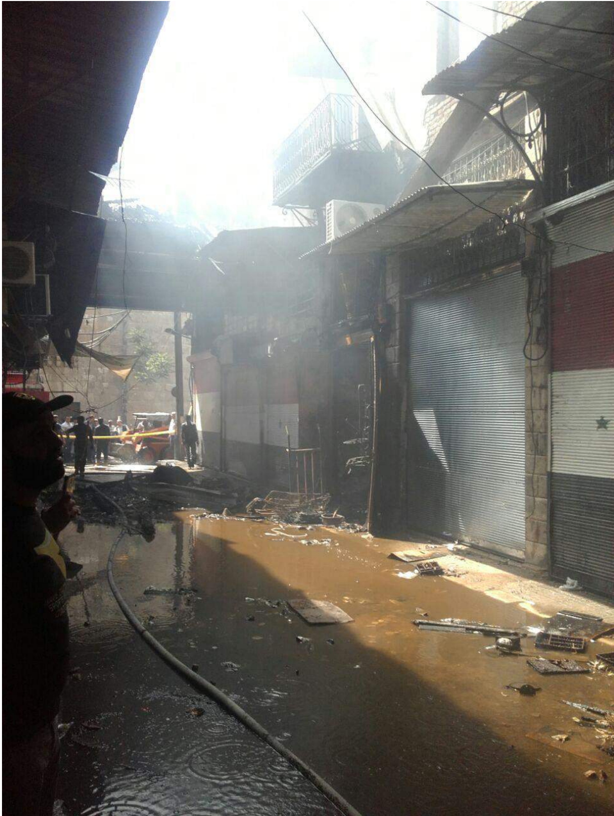
Fire in Suq Asruniyeh area (DGAM; April 23, 2016)