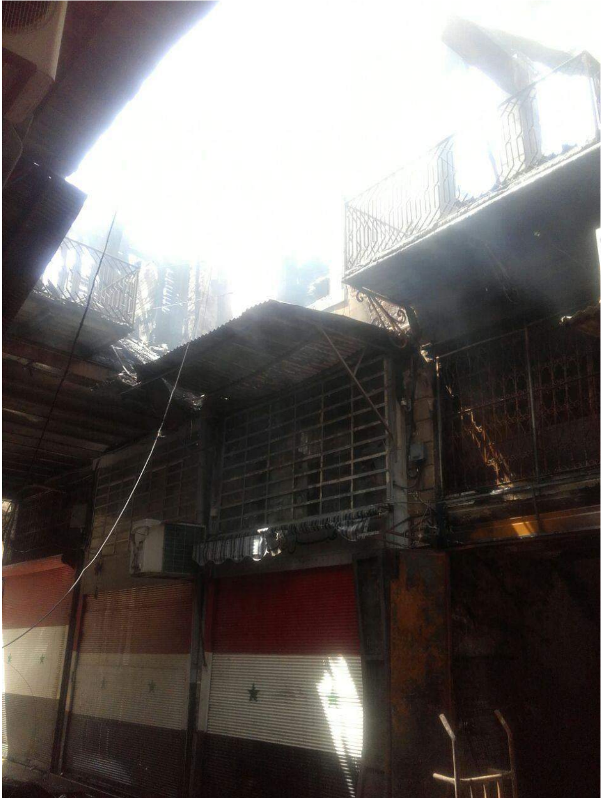
Fire in Suq Asruniyeh area (DGAM; April 23, 2016)