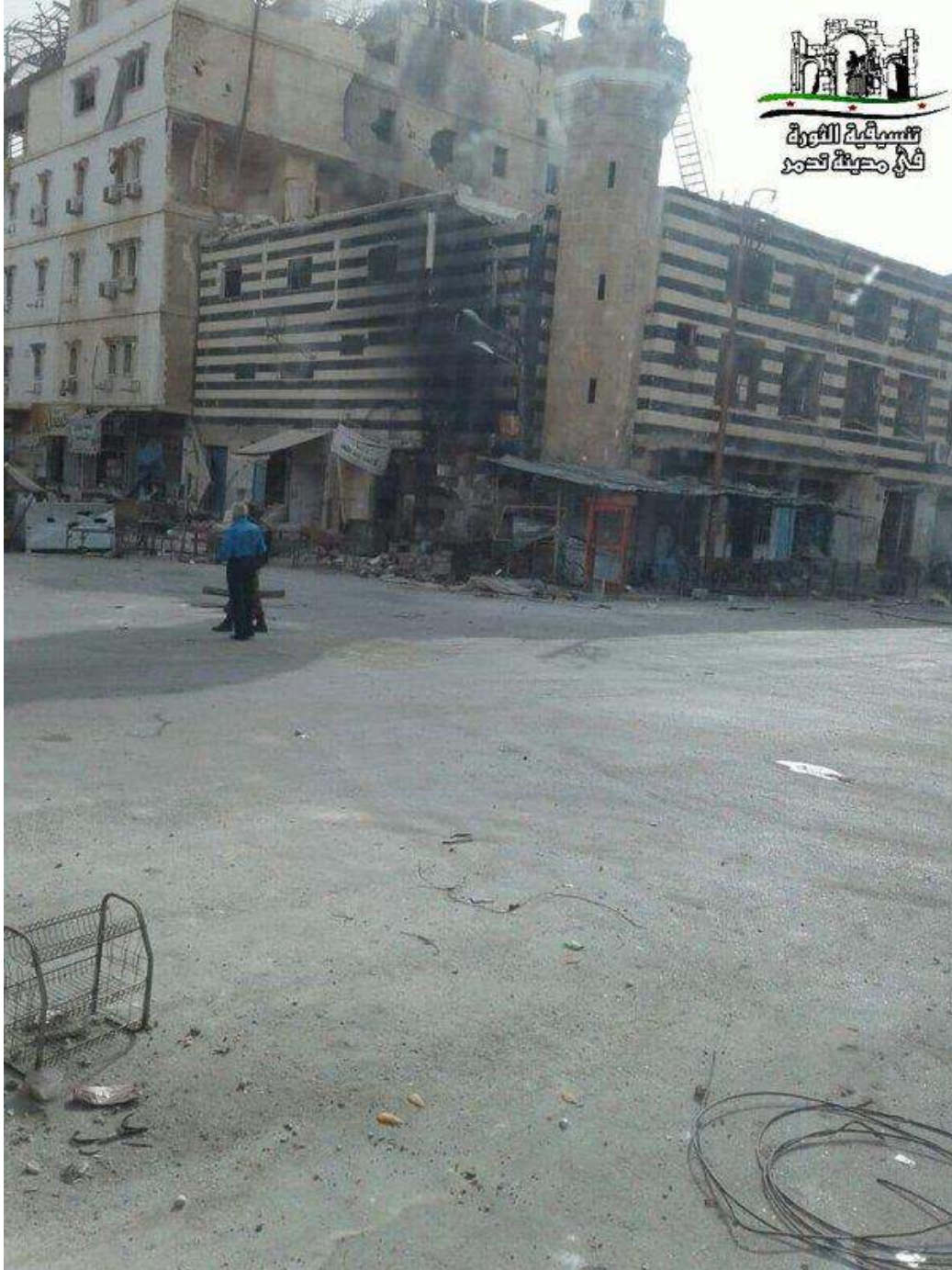
Damage to Al Saha Mosque (Palmyra Coordination; April 12, 2016)