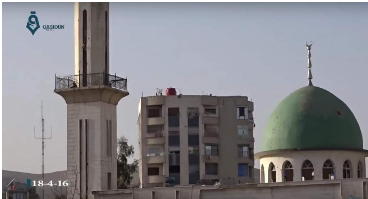
Video still of Al Ghoufran Mosque (SCHR; April 18, 2016)