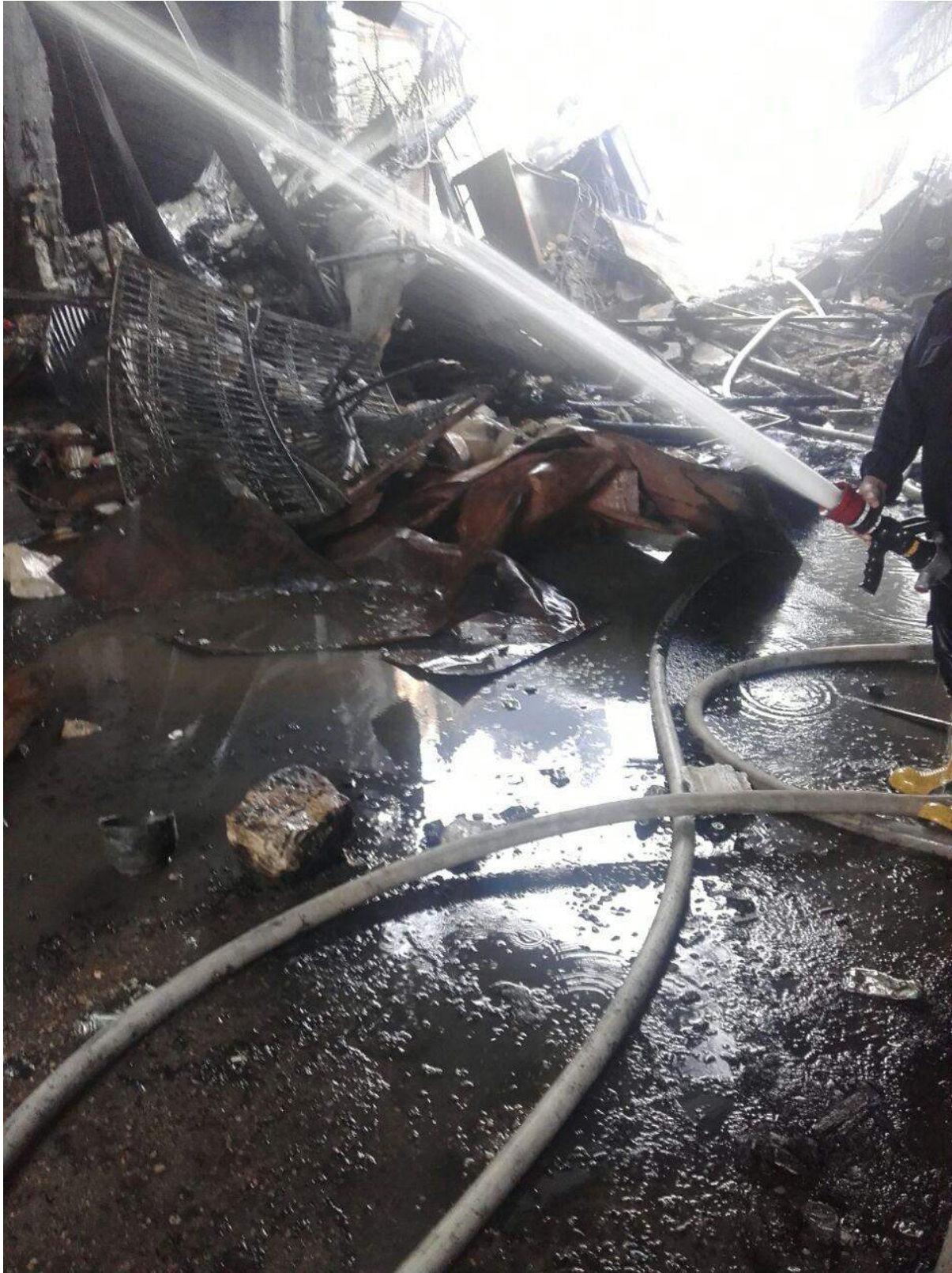
Fire in Suq Asruniyeh area (DGAM; April 23, 2016)