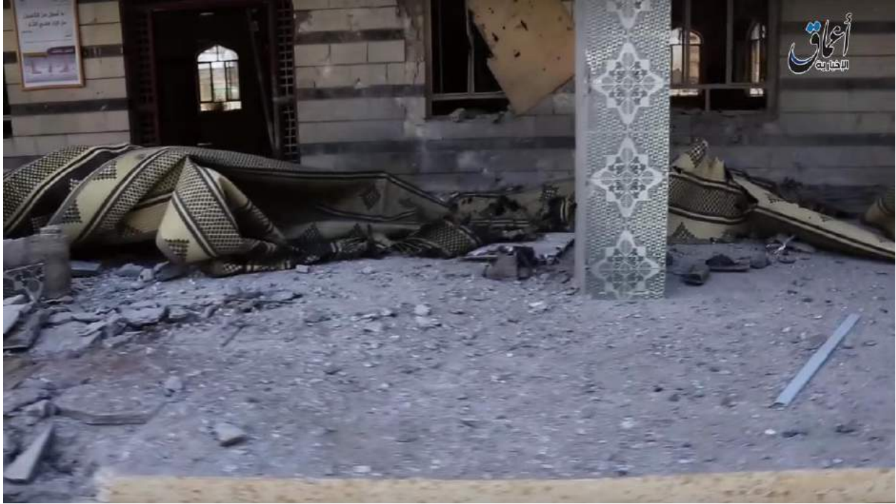
Video still of damage to Al Firdous Mosque (YouTube; April 16, 2016)