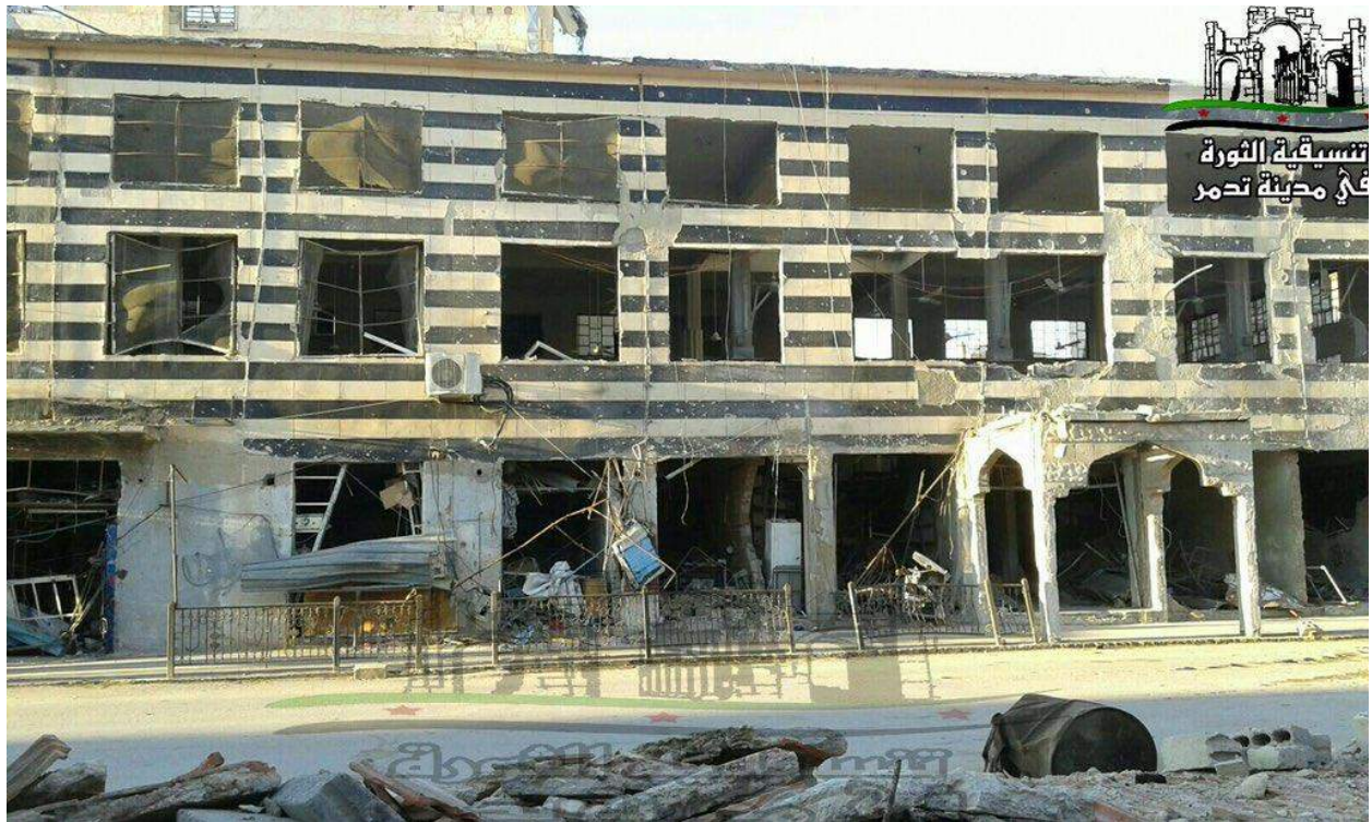
Damage to Al Saha Mosque (Palmyra Coordination; Date Unknown)