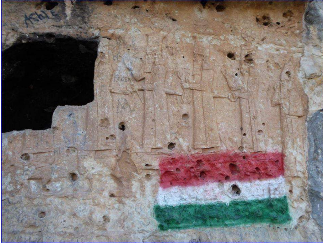
Vandalism and graffiti on Malthai Rock Relief