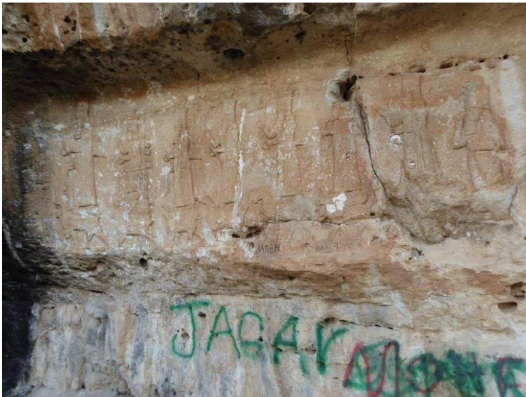
Vandalism and graffiti on Malthai Rock Relief (Facebook; February 22, 2016)