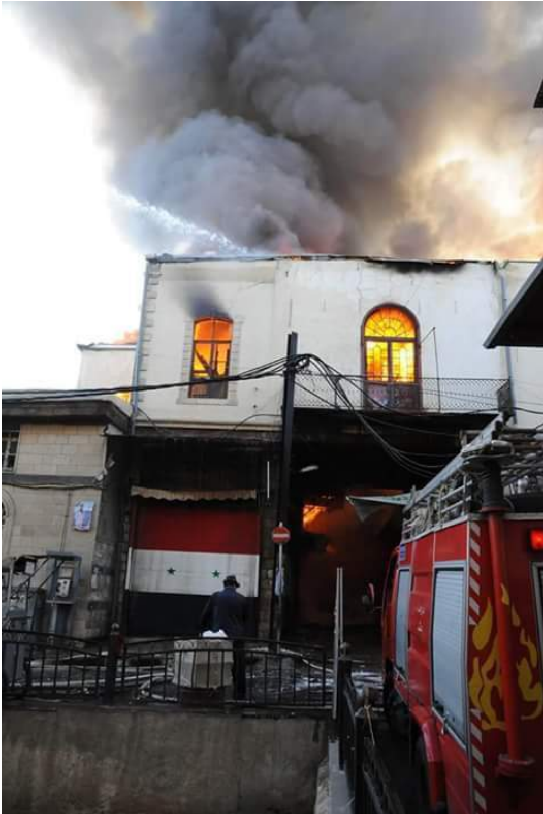
Fire in Suq Asruniyeh area (DGAM; April 23, 2016)