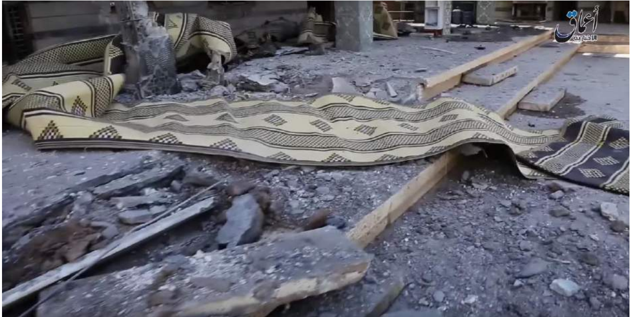
Video still of damage to Al Firdous Mosque (YouTube; April 16, 2016)