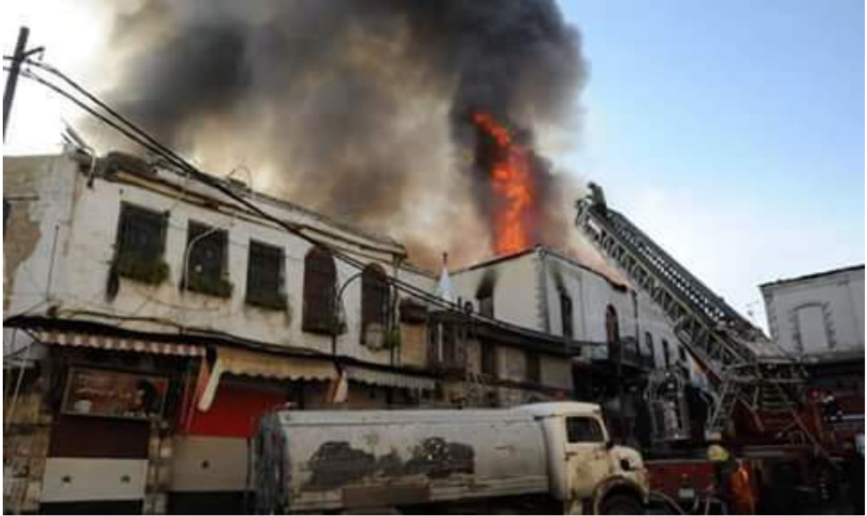
Fire in Suq Asruniyeh area (DGAM; April 23, 2016)