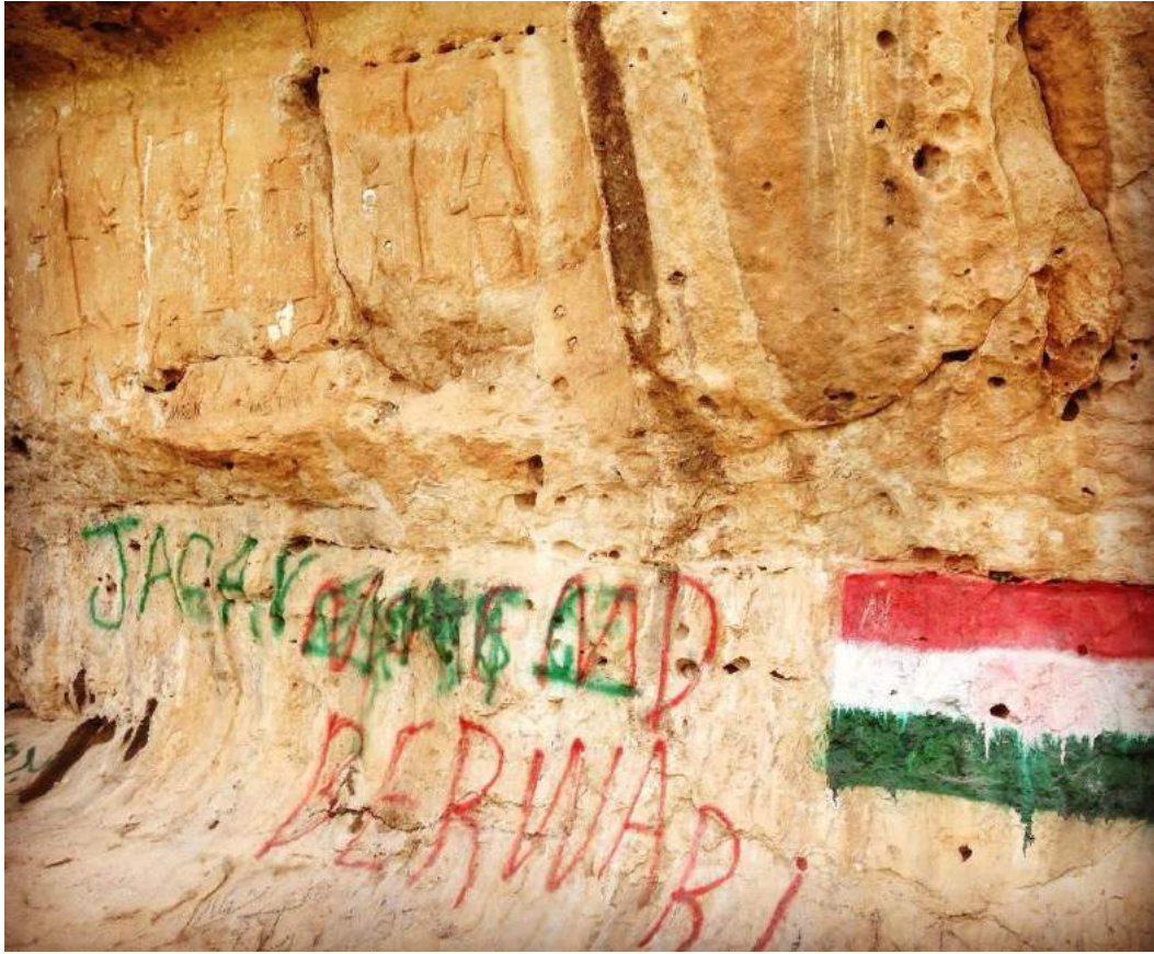
Second flag graffito on Malthai Rock Relief (ASOR CHI in-country sources; April 9, 2016)