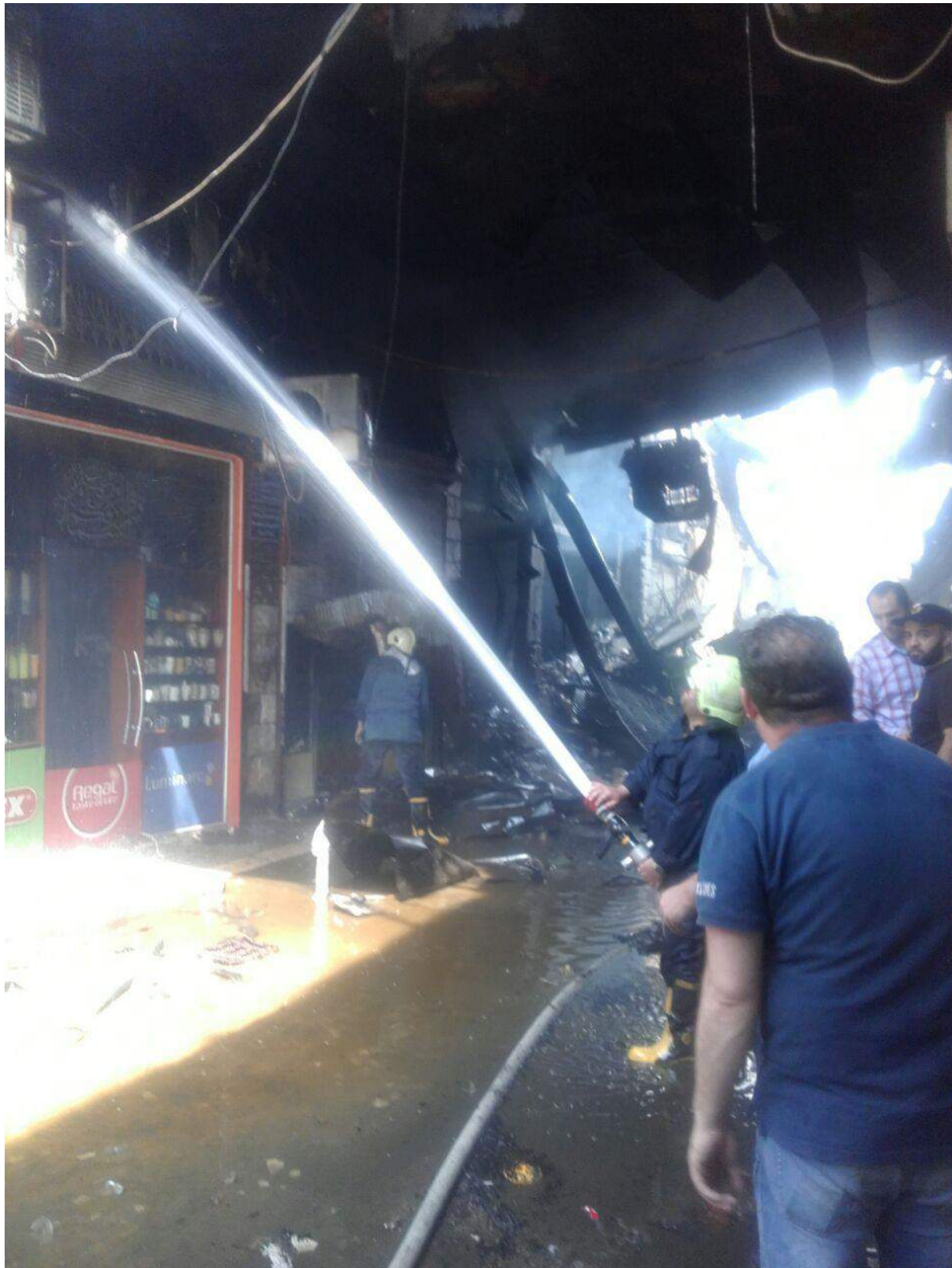
Fire in Suq Asruniyeh area (DGAM; April 23, 2016)