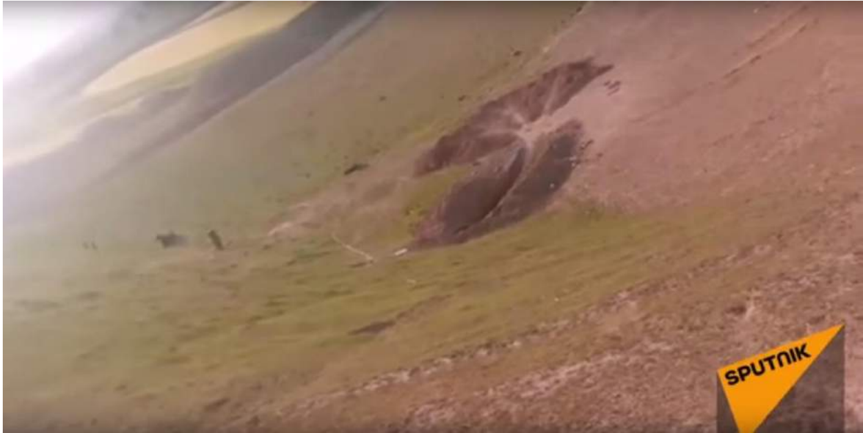
Video still of alleged looting tunnel at Nineveh (Sputnik Arabic; April 22, 2016)