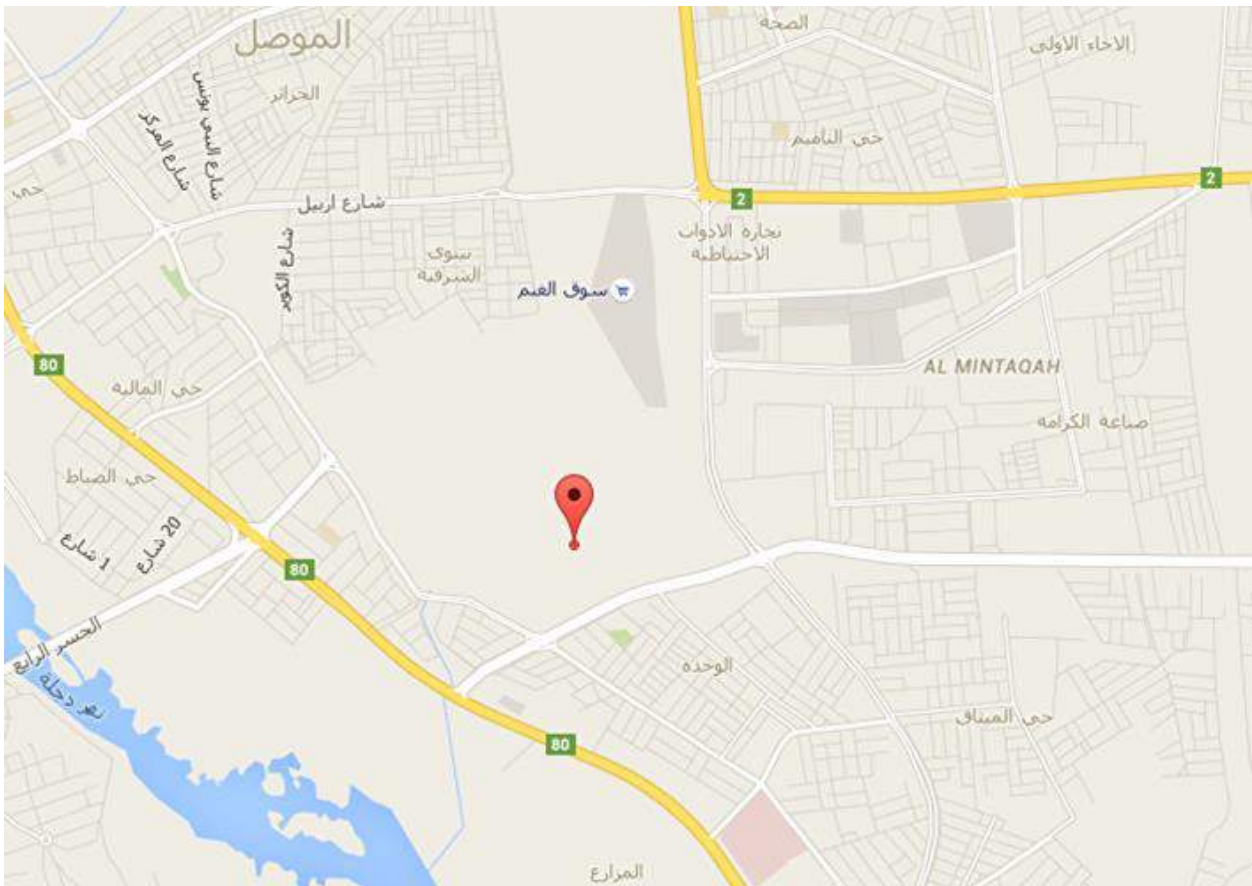
Screenshot of Google Map marking the location of the alleged looting tunnel at Nineveh (Sputnik Arabic; April 22, 2016)