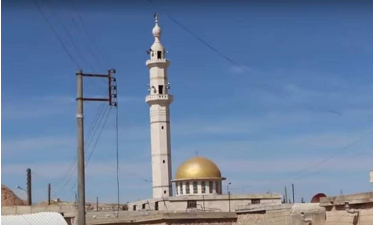
Video still of Khaled Bin Al Walid Mosque prior to airstrike damage to the mosque and minaret (April 3, 2016)