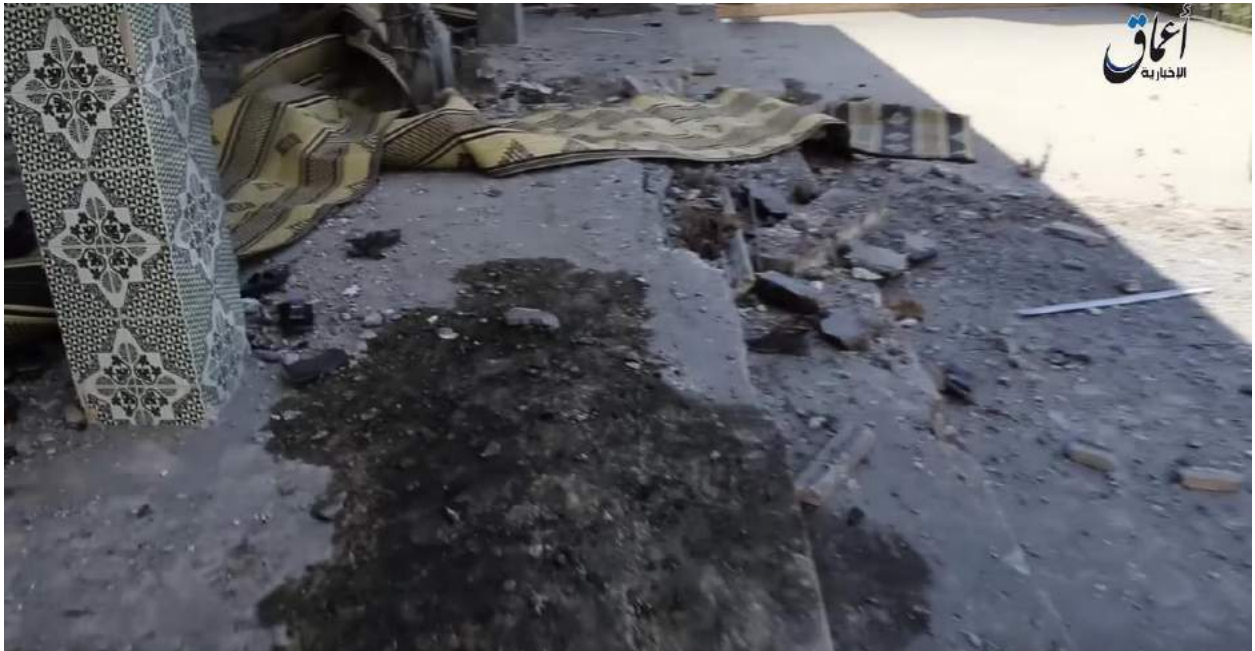
Video still of damage to Al Firdous Mosque (YouTube; April 16, 2016)