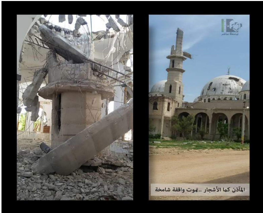
Severe damage to al-Nur Mosque, including collapse of minaret (Ter Maalah Direct; April 18, 2016)