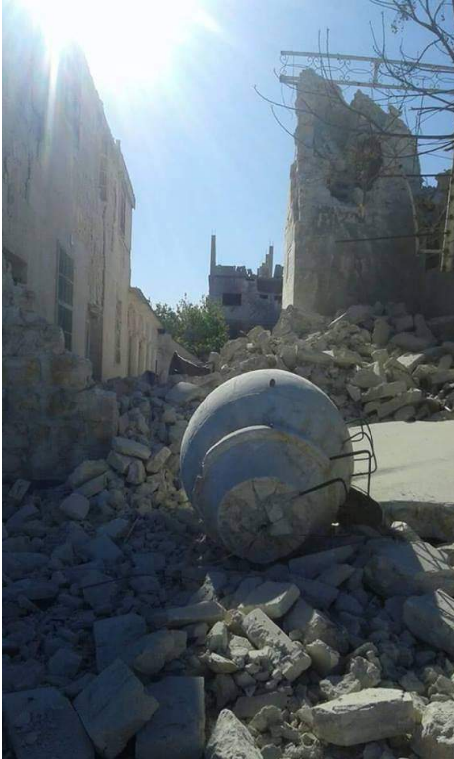
Twitter photograph of reported damage to Khaled Bin Al Walid Mosque, showing what was once the top of the minaret. (April 17, 2016) 73