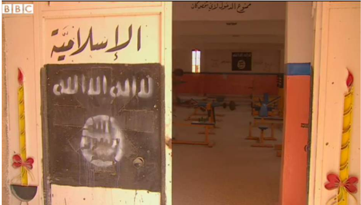
Video still of unnamed church in Al Shadadi (BBC; April 13, 2016)