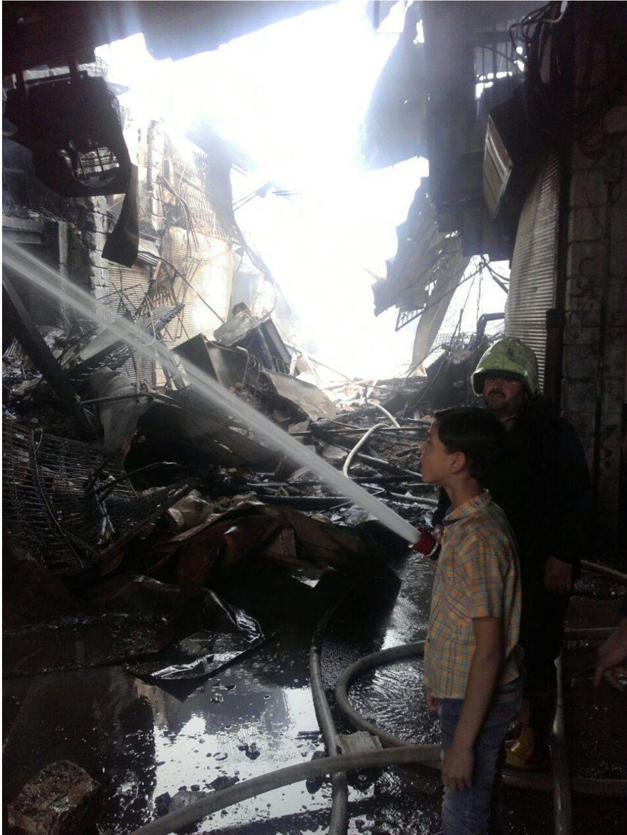
Fire in Suq Asruniyeh area (DGAM; April 23, 2016)