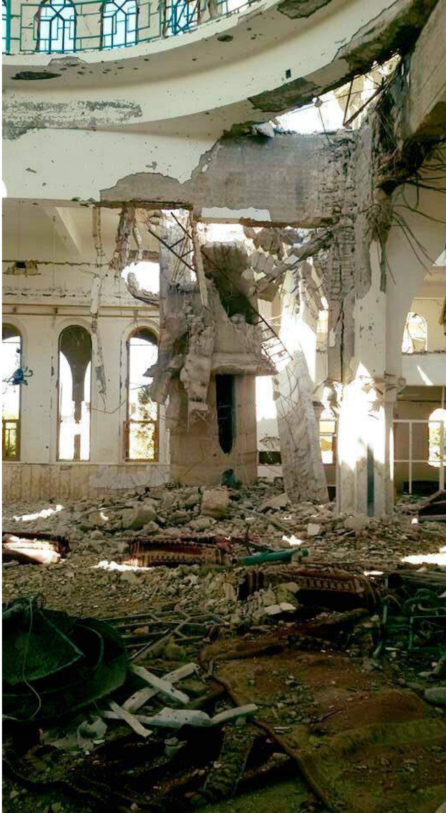
Severe damage to al-Nur Mosque, including collapse of minaret (April 15, 2016)