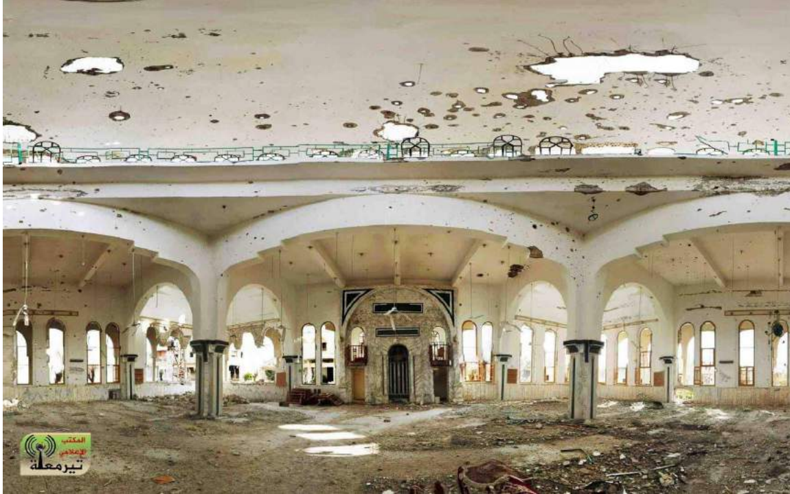
Panoramic view of damage to interior of al-Nur Mosque (Ter Maalah Direct; March 9, 2016)