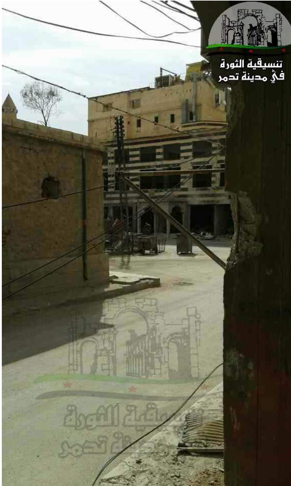
Damage to Al Saha Mosque (Palmyra Coordination; February 27, 2016)