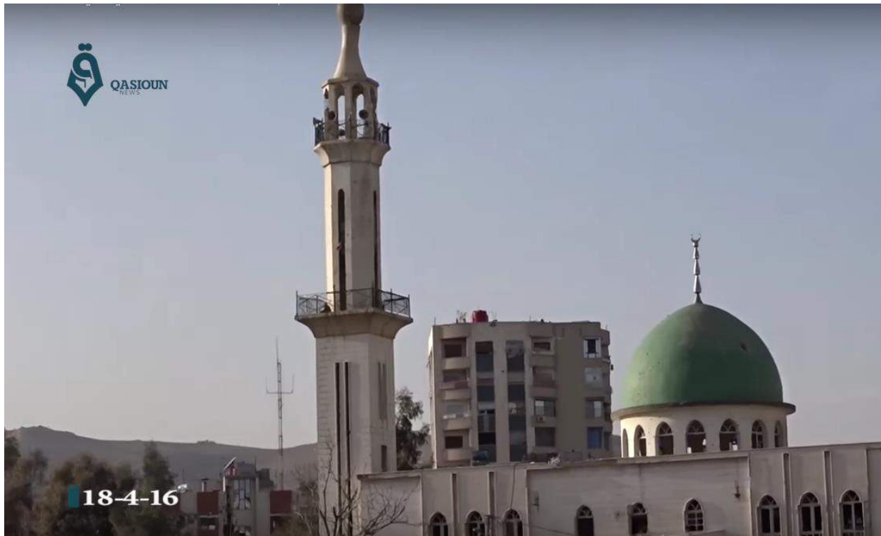
Video still of Al Ghoufran Mosque (SCHR; April 18, 2016)