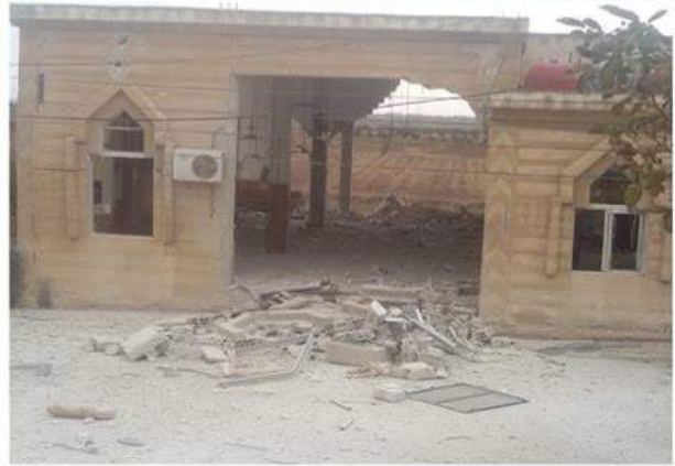
Severe damage to Uthman bin Affan Mosque (Ter Maalah Direct; April 18, 2016)