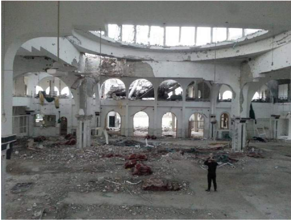
Severe damage to al-Nur Mosque, including partial collapse (Ter Maalah Direct; March 22, 2016)