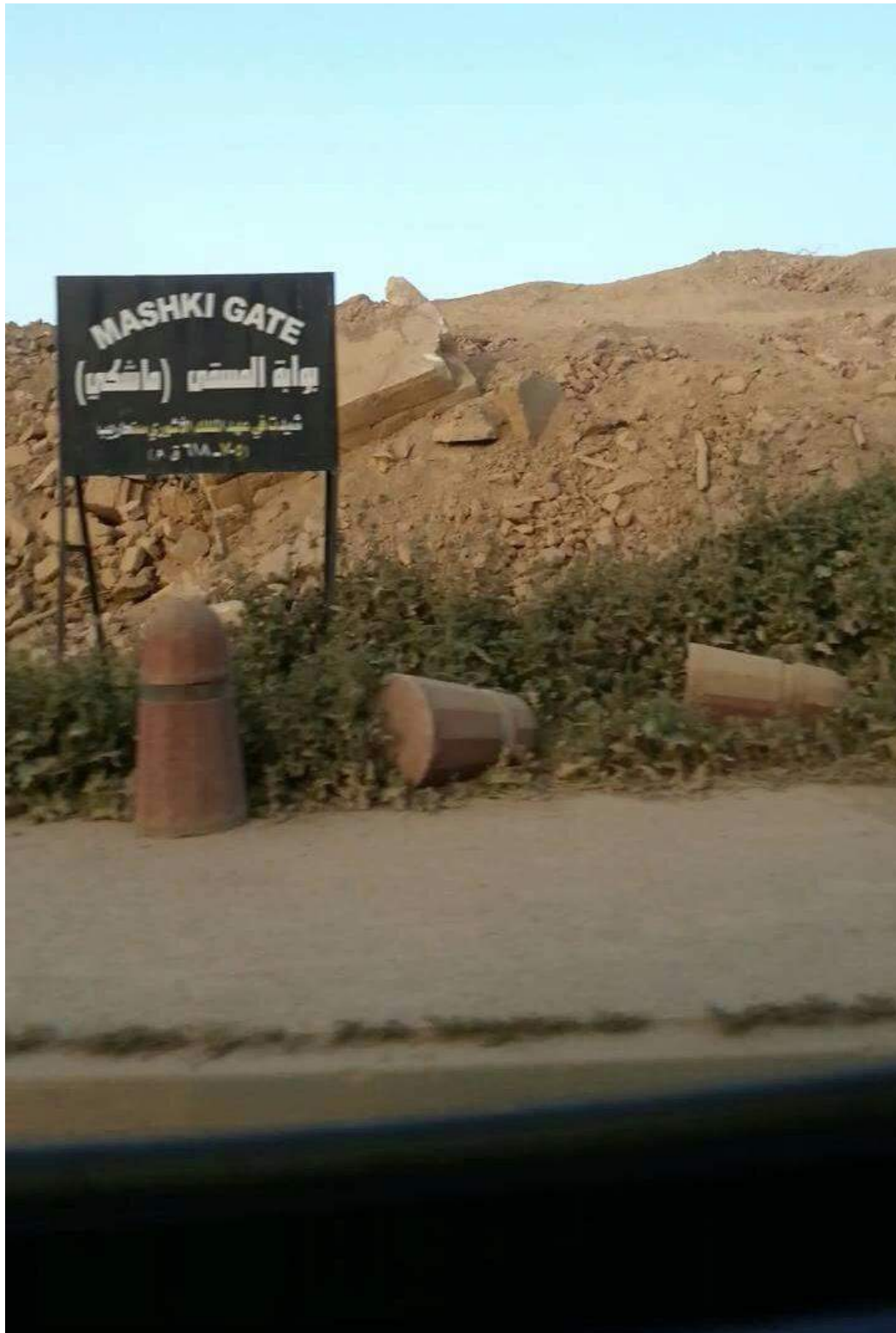
Damage to Mashki Gate (ASOR CHI Sources; received April 14, 2016)