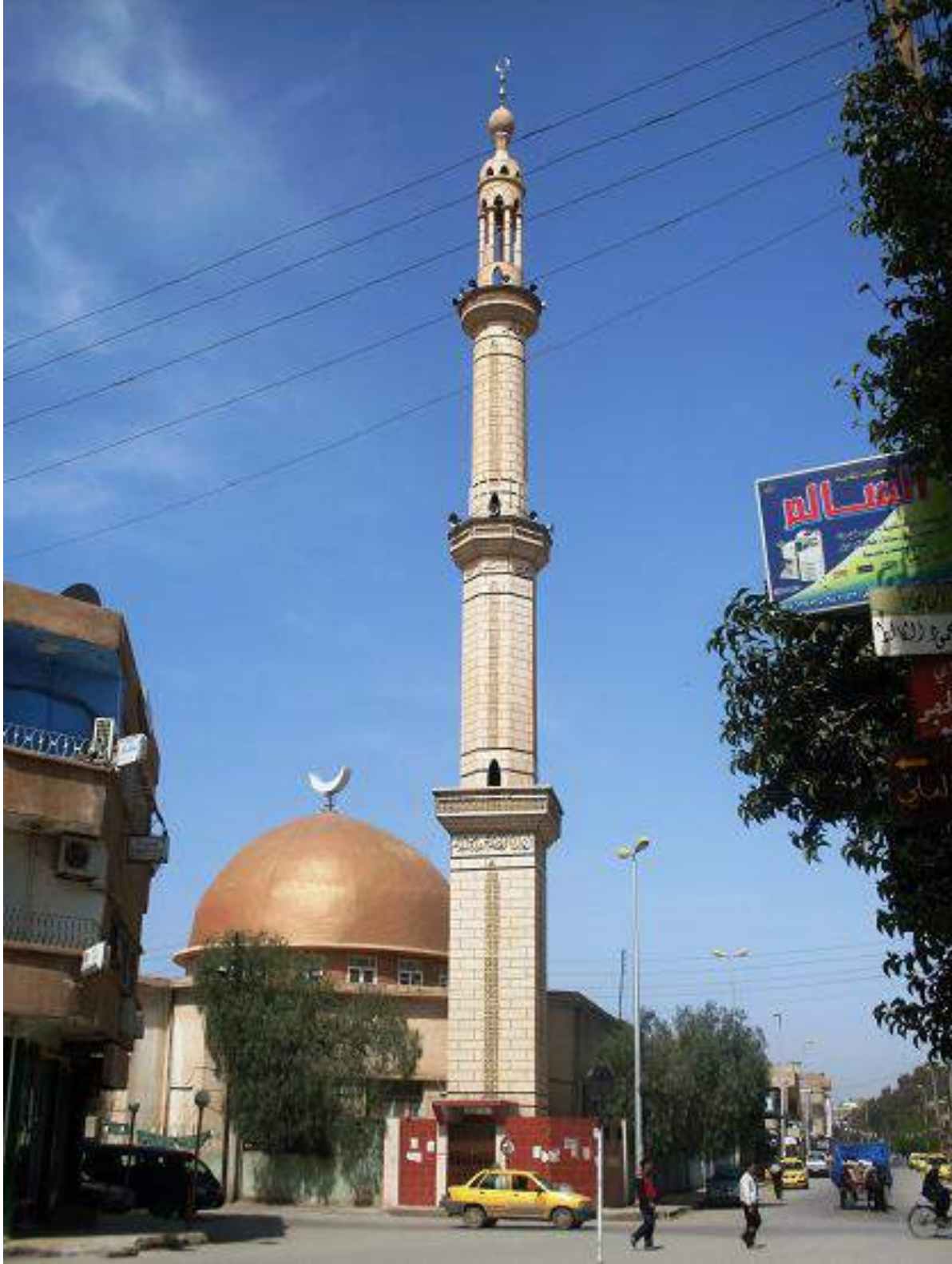
Photograph of Al Firdous Mosque prior to damage (ESyria; 2009)