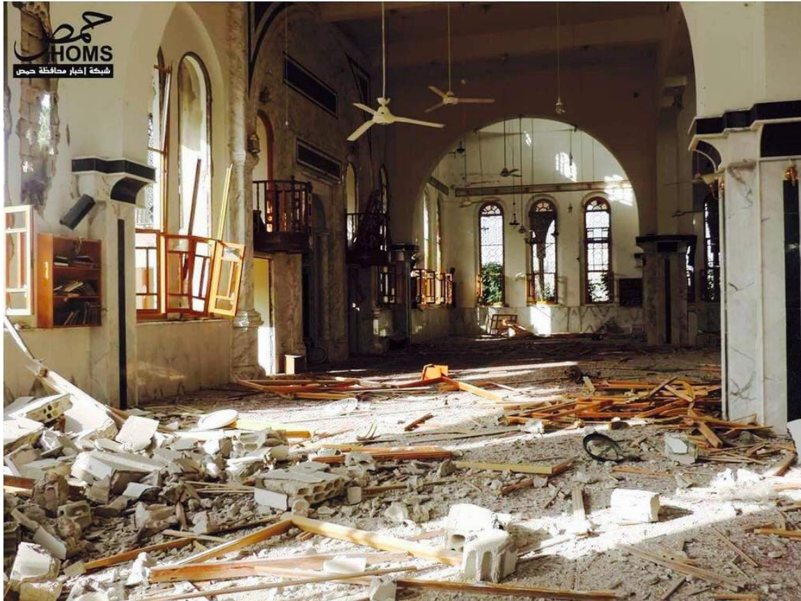
Damage to interior of al-Nur Mosque following airstrike (Souriat; October 20, 2015)