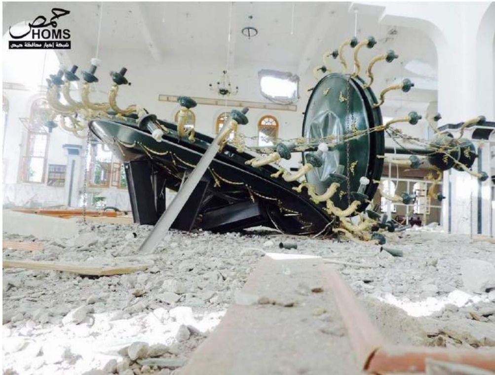
Damage to interior of al-Nur Mosque following airstrike (Souriat; October 20, 2015)