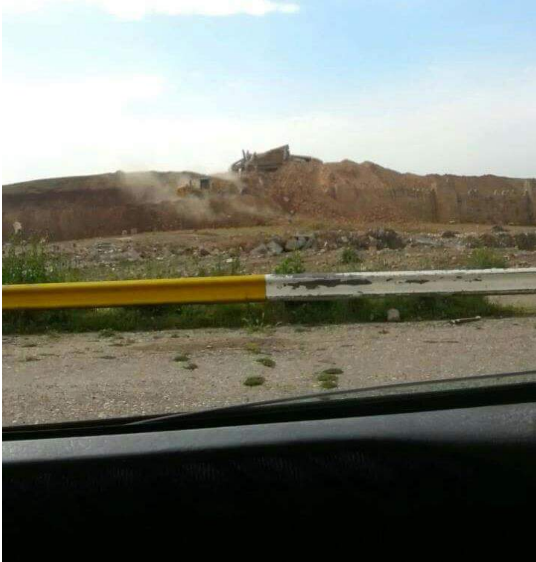
Area of the Nergal Gate with working earthmover in foreground leveling the mound by the gate as well as the site wall