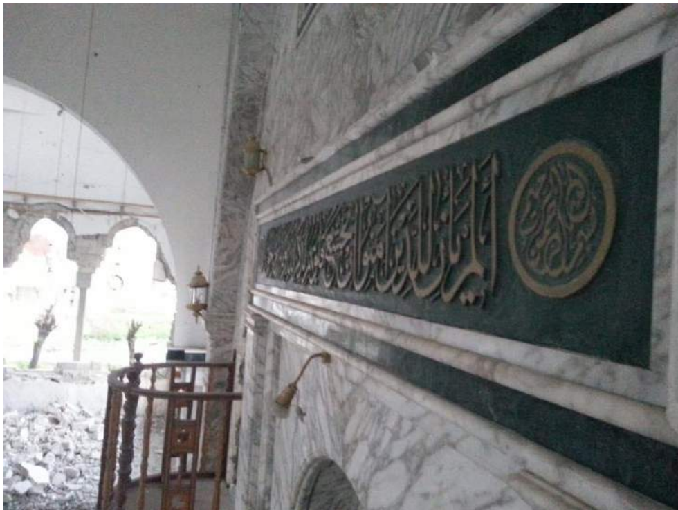
Severe damage to al-Nur Mosque, including partial collapse (March 22, 2016)