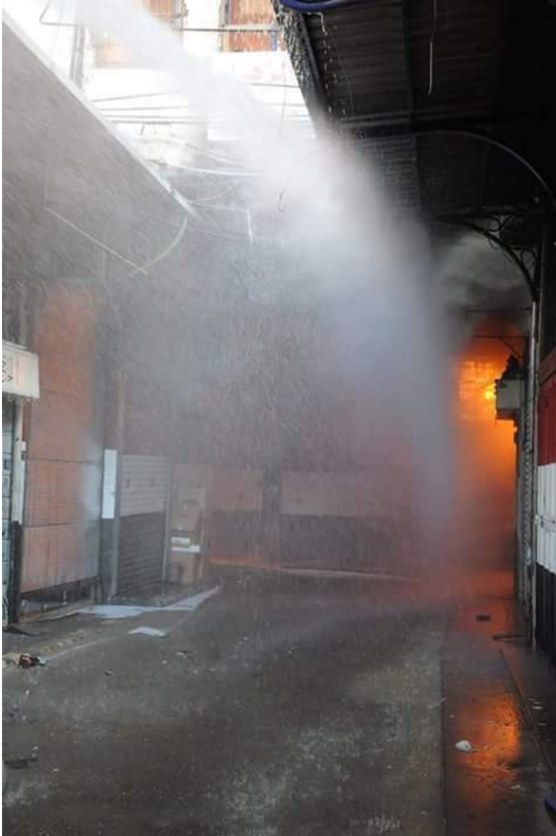
Fire in Suq Asruniyeh area (DGAM; April 23, 2016)