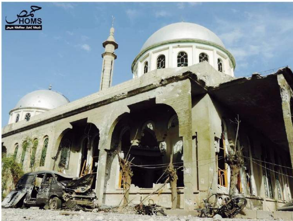
Damage to exterior of al-Nur Mosque following airstrike (Souriat; October 20, 2015)