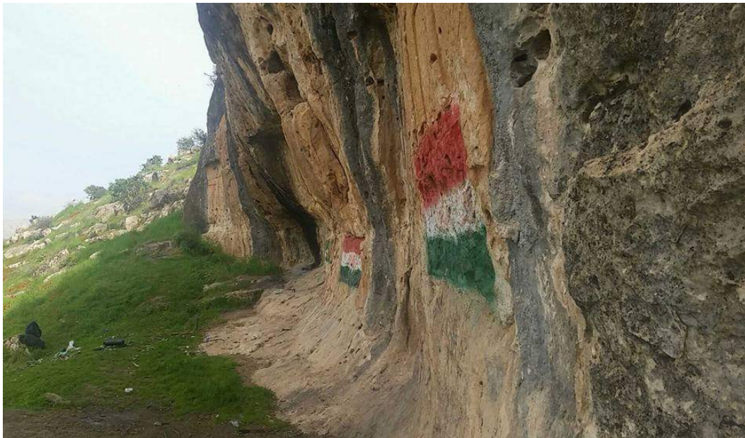
Two spray paint flags on Malthai Rock Relief (ASOR CHI in-country sources; April 9, 2016)