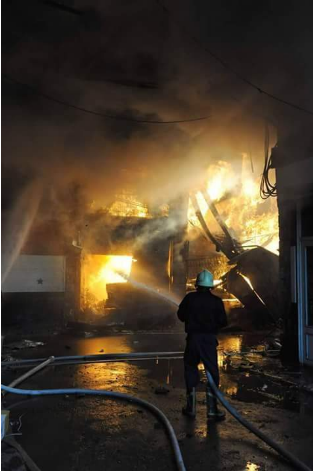
Fire in Suq Asruniyeh area (DGAM; April 23, 2016)