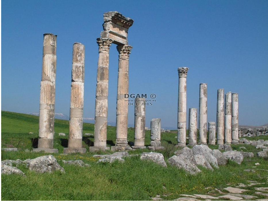
Apamea, Colonnaded Street (DGAM; October 22, 2015)