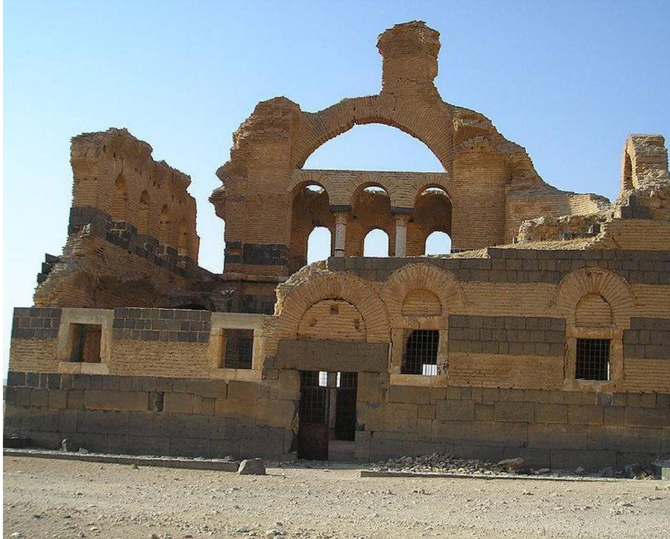
The Palace of Ibn Wardan (DGAM; October 22, 2015)