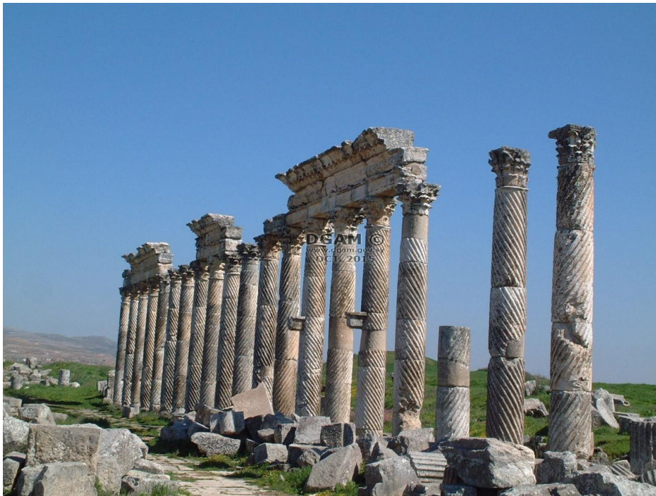
Apamea, Colonnaded Street (DGAM; October 22, 2015)

Burns, Ross (2010). The Monuments of Syria. A Guide . I.B. Tauris. London.