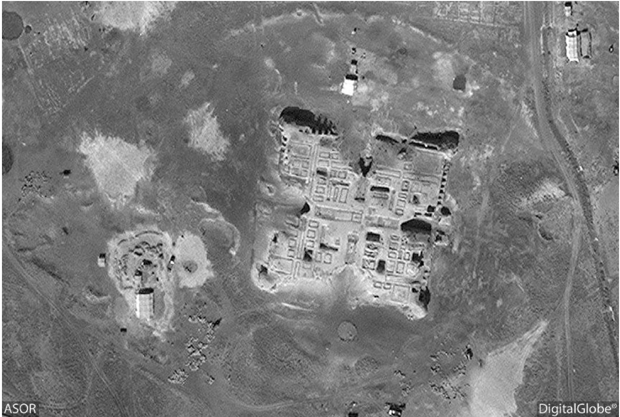
Heraqla, new constructions to the north and west of the extant architecture (October 14, 2015)