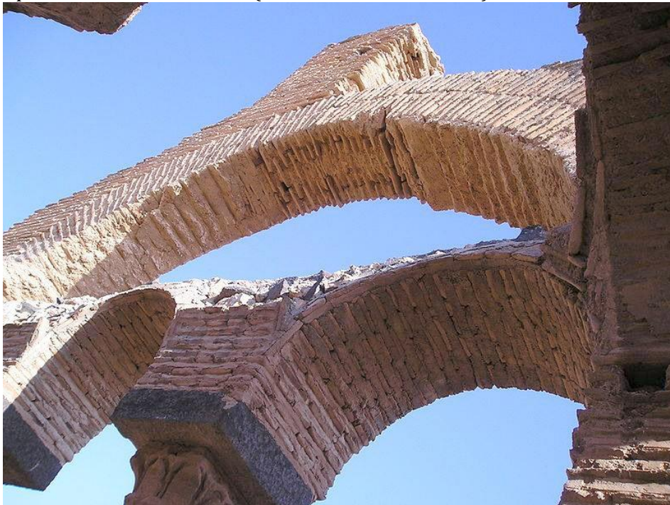
The Palace of Ibn Wardan (DGAM; October 22, 2015)