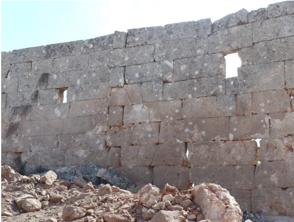
Severe damage to a wall caused by airstrikes.