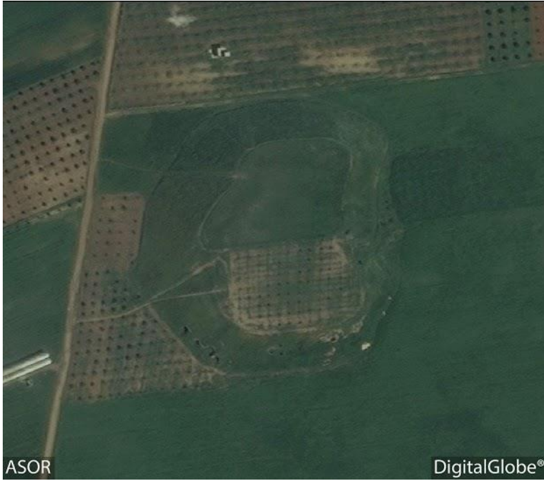
Tell Bezzam, small looting pits from before 2008 and a single small road up the western side of the mound to fields on top of the mound (DigitalGlobe; March 22, 2013)