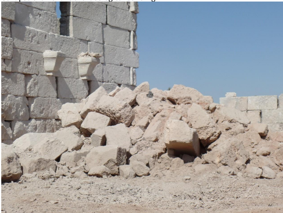
Collapse of an entire archaeological building.