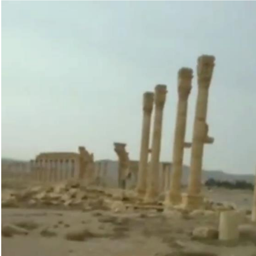
Arch of Triumph, video still of damage (DGAM; October 9, 2015)