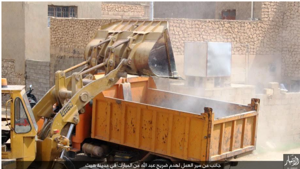
جانب من سير العمل لهدم ضريح عبد الله من المبارك في مدينة هيت