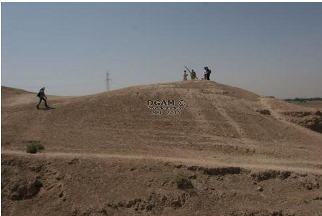
Tall as-Sin, roads from heavy equipment traffic (DGAM; September 29, 2015)