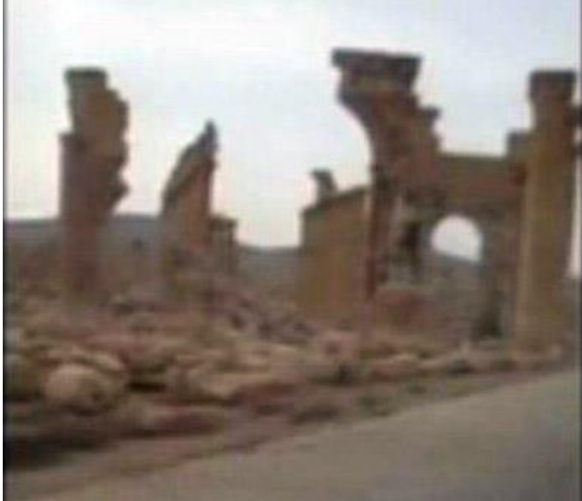
Arch of Triumph, video still of damage (DGAM; October 9, 2015)