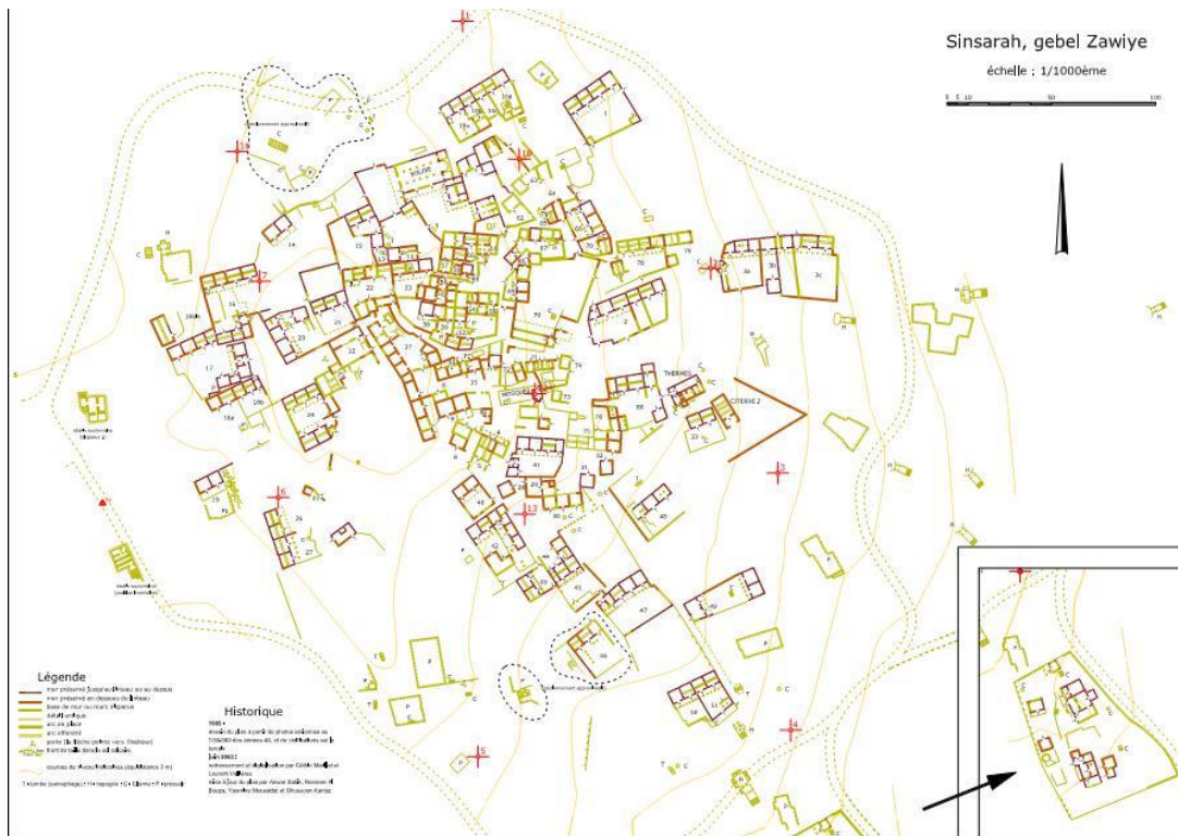
Plan of Shinshara.

On October 1, 2015 at exactly 1 pm local time, the Russian air force bombed the archaeological site of Shinshara, causing extensive damage to the site and casualties among the refugees sheltering in the ruins.