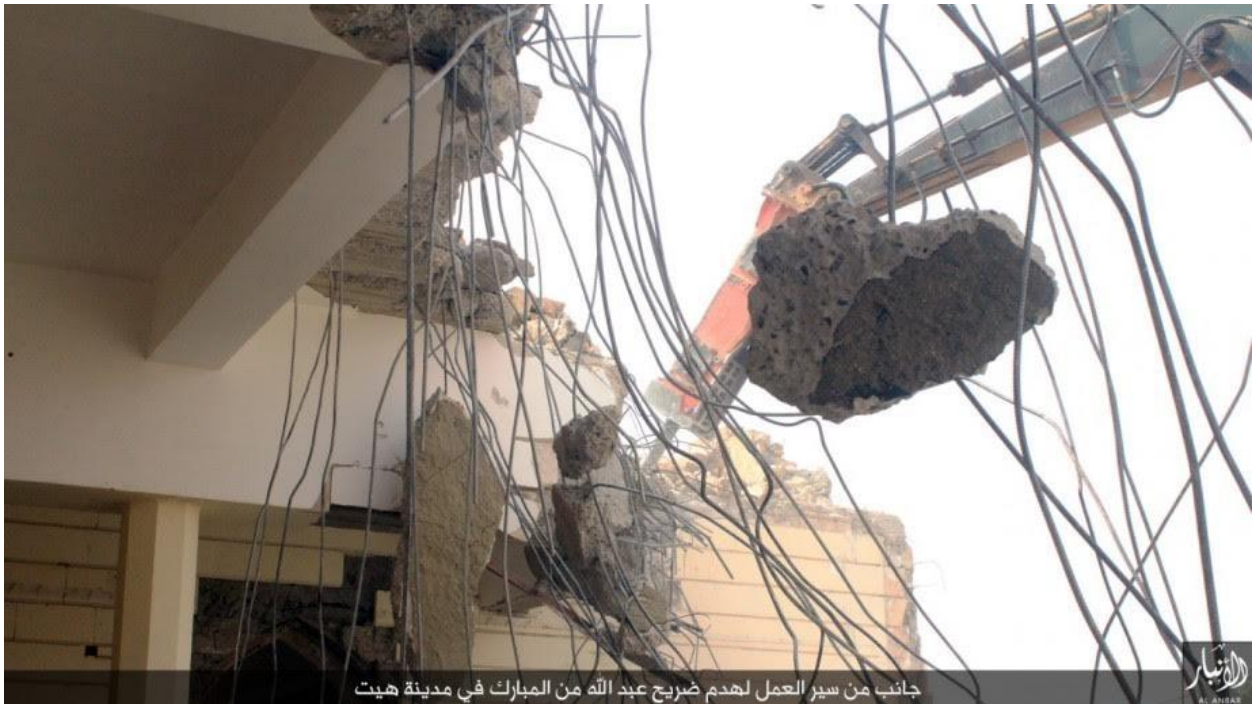
جانب من سير العمل لهدم ضريح عبد الله من المبارك في مدينة هيت