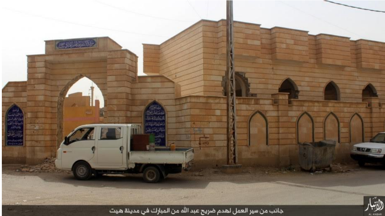
جانب من سير العمل لهدم ضريح عبد الله من المبارك في مدينة هيت