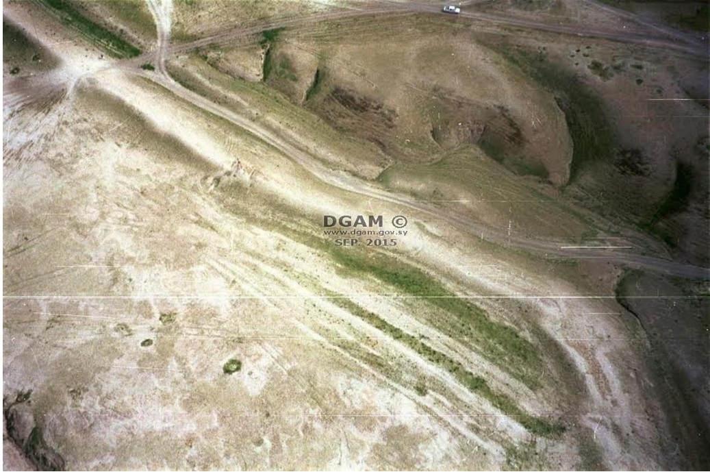
Tell al-Kasra, evidence of illicit excavation (DGAM; September 29, 2015)