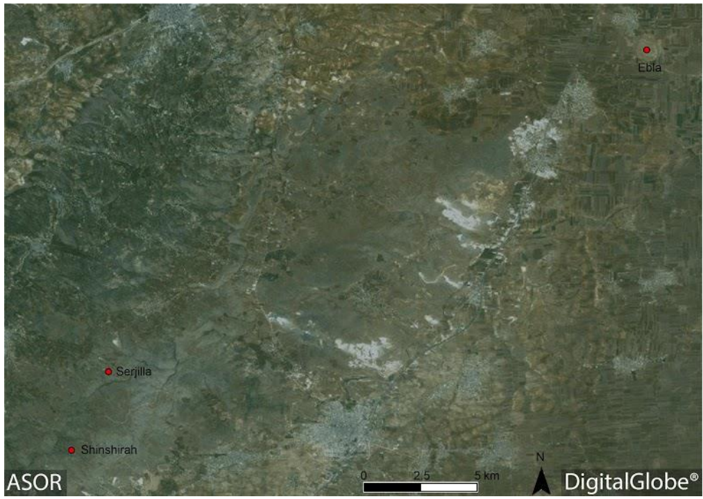
Location of three Idlib heritage sites allegedly hit by Russian airstrikes (October 10, 2015)