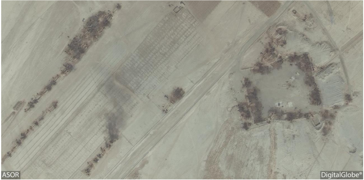
Tall as-Sin (DigitalGlobe; October 1, 2014)