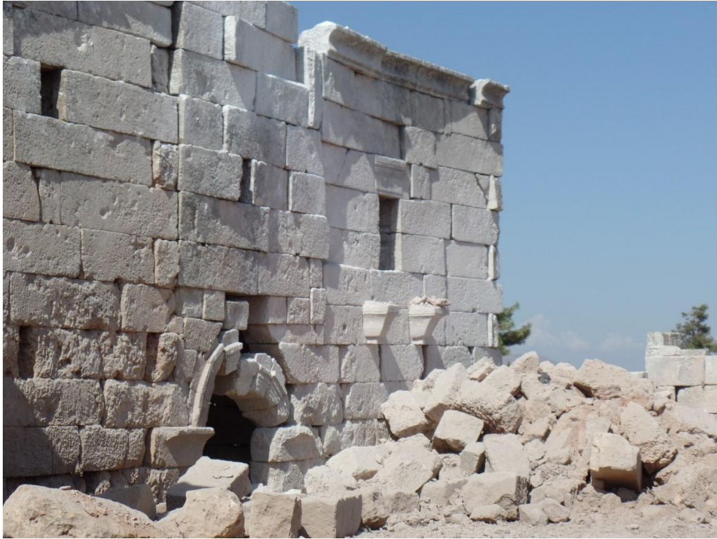
Severe damage to the walls.