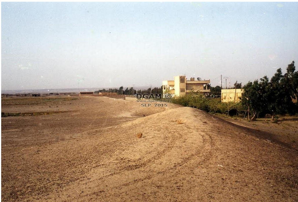
Tell al-Kasra, evidence of illicit excavation (DGAM; September 29, 2015)