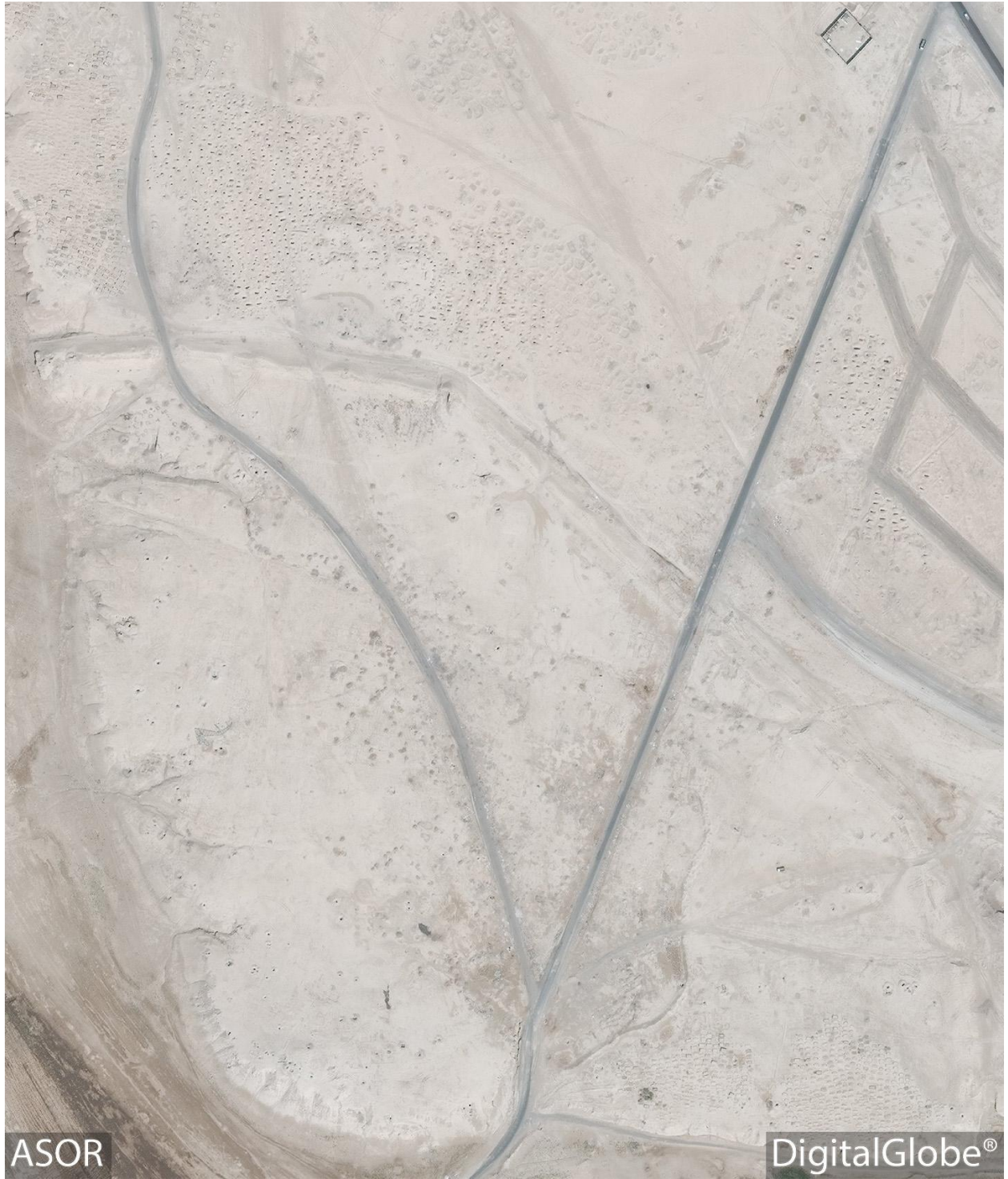
Tall as-Sin in the upper right corner with excavation pits visible (September 16, 2015)