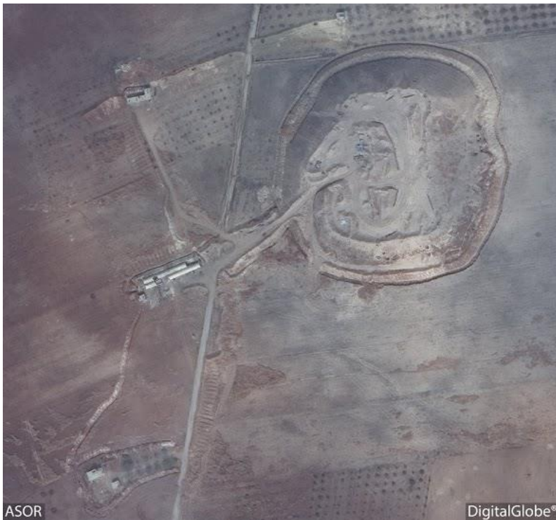
Tell Bezzam, construction of significant earthworks on top of mound (DigitalGlobe; October 1, 2015)