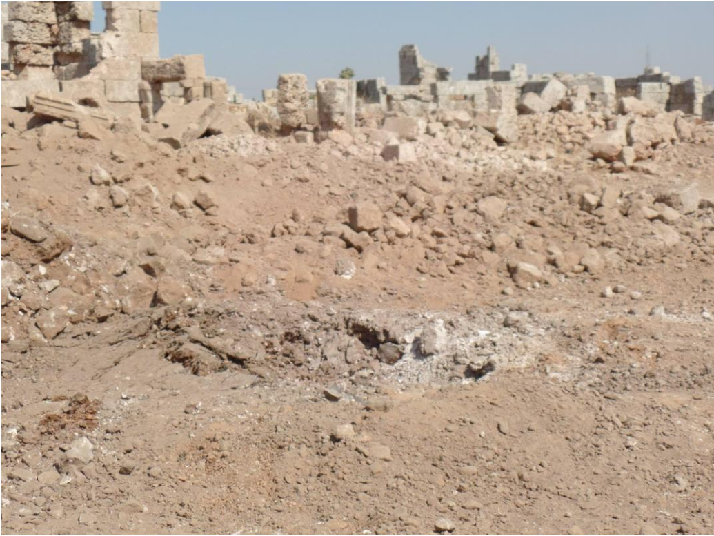
Severe and extensive damage to the archaeological park.