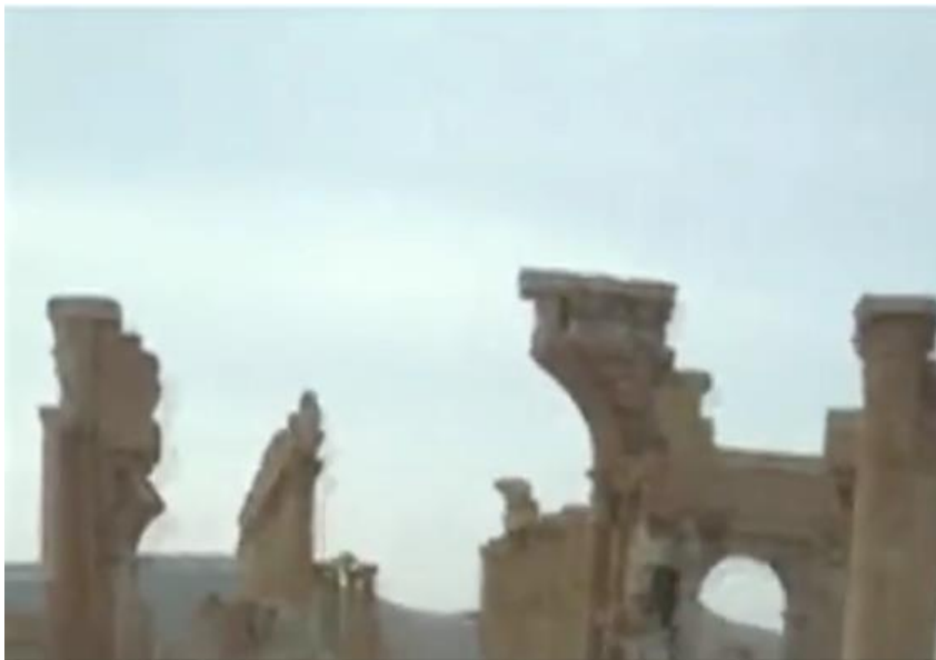
Arch of Triumph, video still of damage (October 9, 2015)