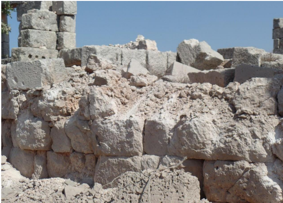
Collapse of an entire archaeological building.