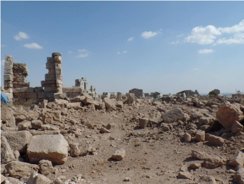
Severe and extensive damage to the archaeological park.