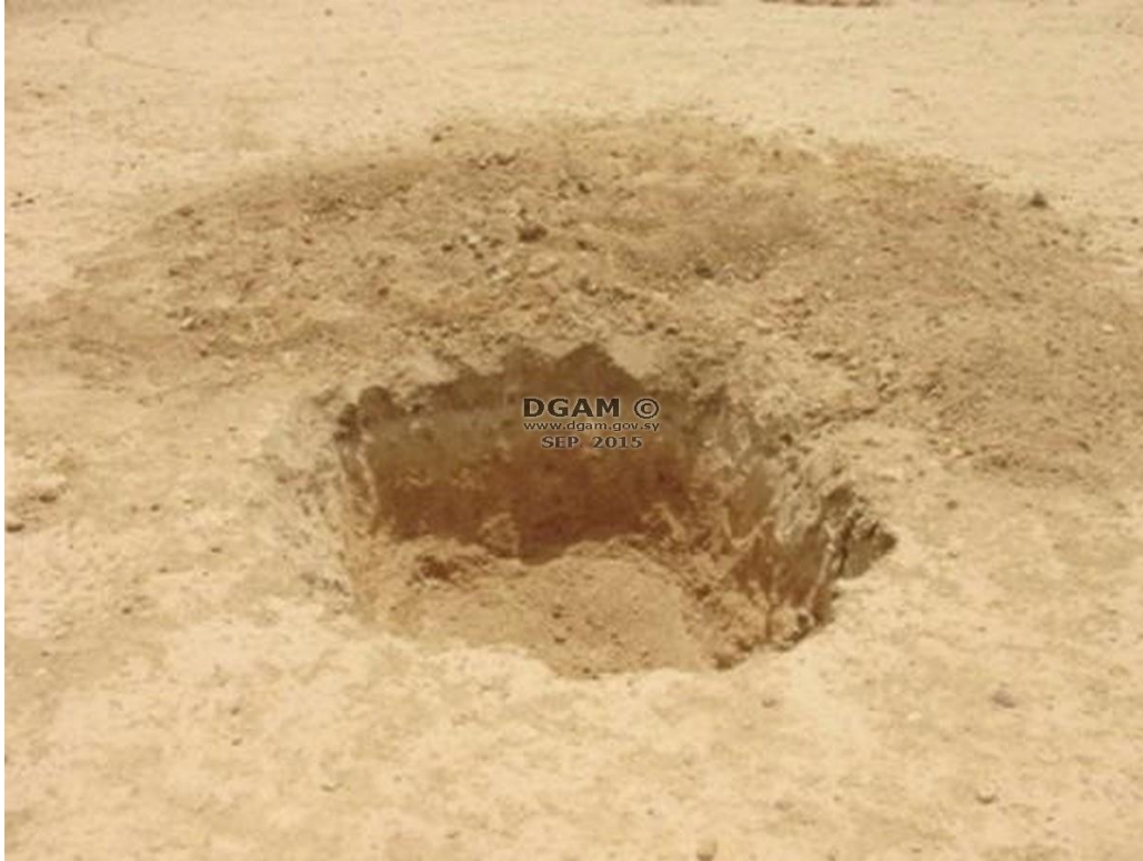
Tall as-Sin, excavation pits from heavy equipment (DGAM; September 29, 2015)