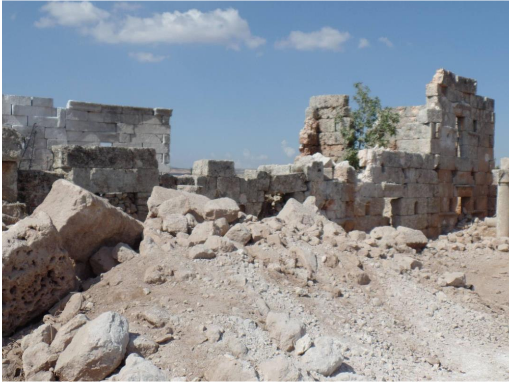
Collapse of an entire archaeological building.