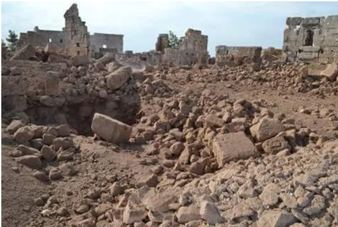
Damage caused by Russian bombing (western side).