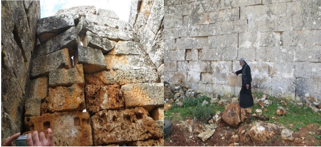
Damage caused by previous attacks by Syrian regime bombing in 2013.