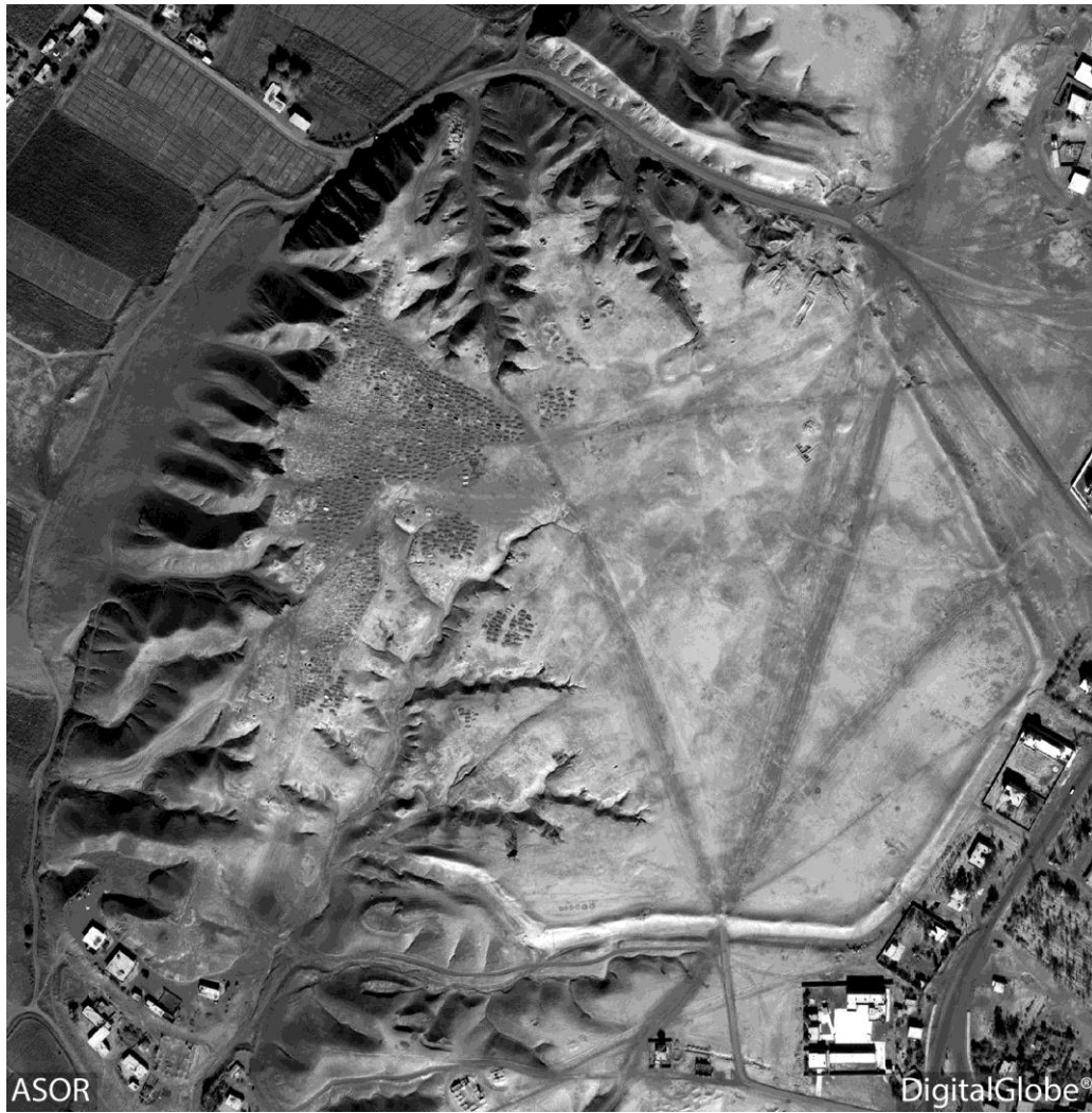
Tell al-Kasra, most recent satellite imagery (November 7, 2011)