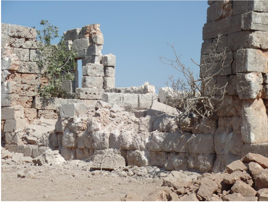
Collapse of an entire archaeological building.