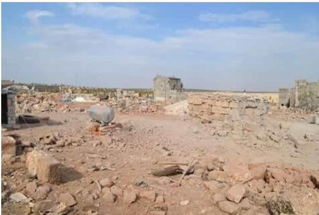
Destruction caused by recent Russian bombing (eastern side).