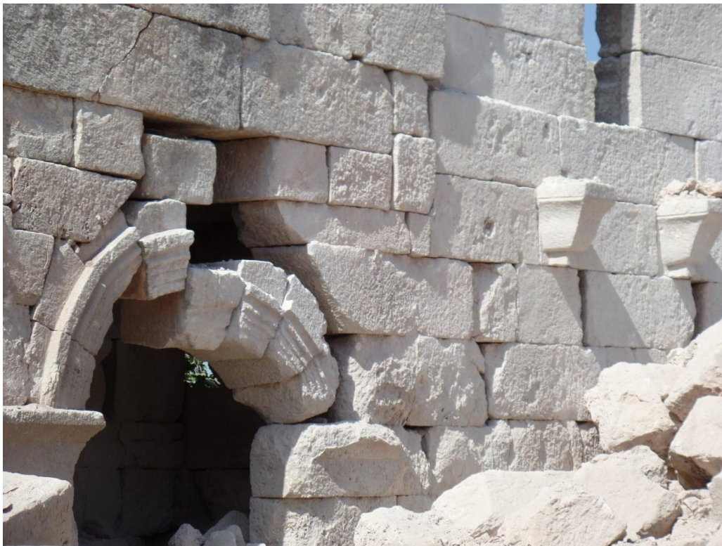
Severe damage to the walls and the need for emergency intervention and consolidation work.