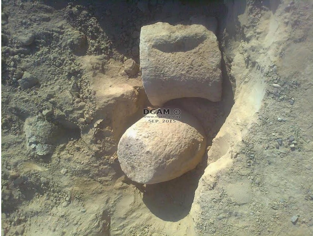
Tell al-Kasra, evidence of illicit excavation (DGAM; September 29, 2015)