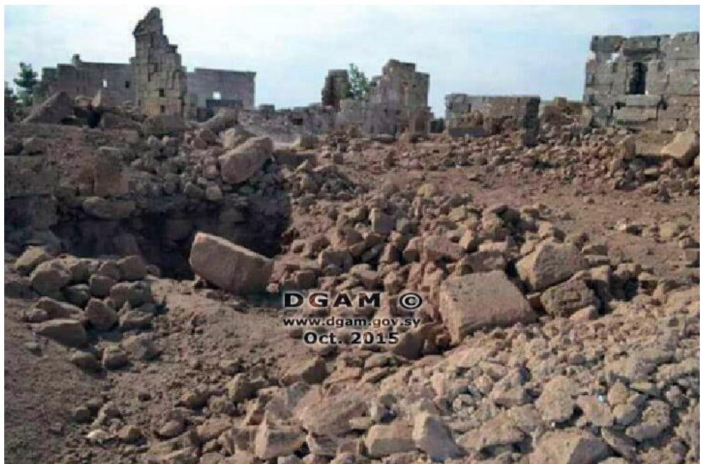
Shinshara, damage on the western side of site (DGAM; October 7, 2015)