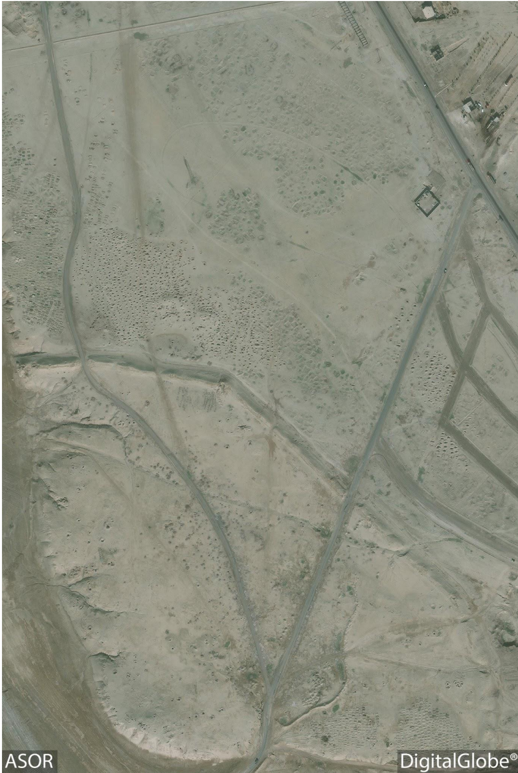
Tall as-Sin in the upper right corner with visible excavation pits (November 11, 2014)