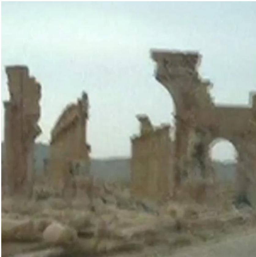
Arch of Triumph, video still of damage (DGAM; October 9, 2015)