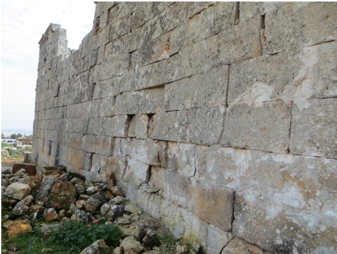
Damage caused by previous attacks from Syrian regime bombing in 2013.