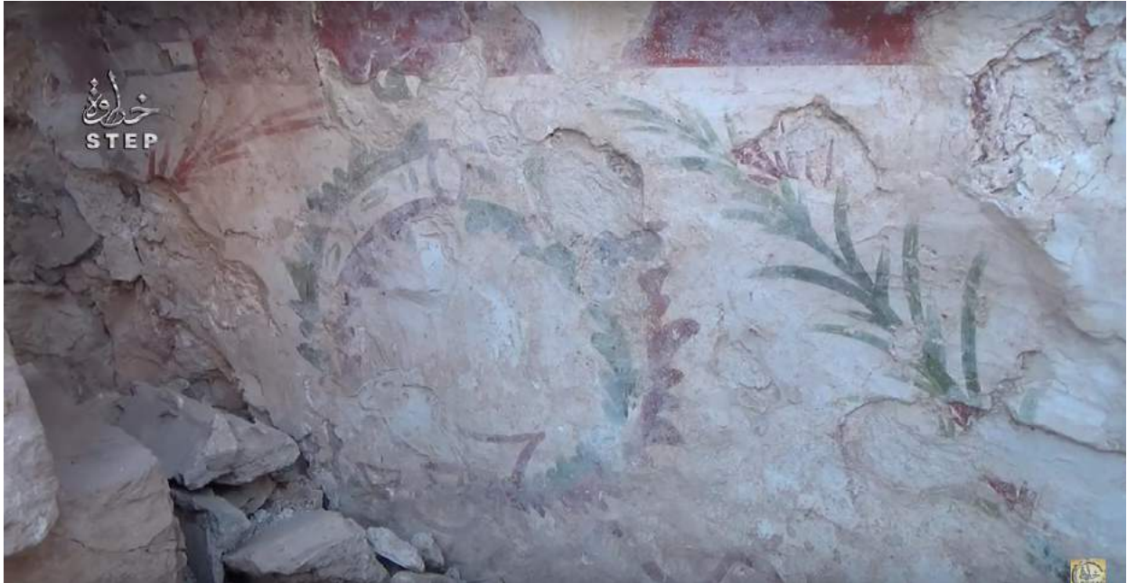
Video still of wall murals in mithraeum (September 10, 2016)