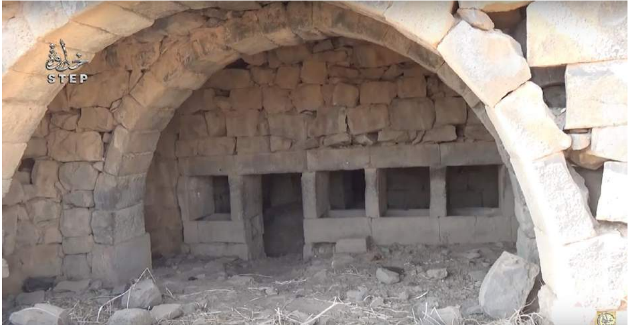
Video still of section of ancient site at Huarte (Step News Agency; September 10, 2016)