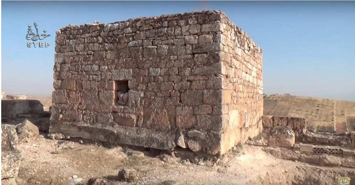
Video still of later building Church of Photios (September 10, 2016)