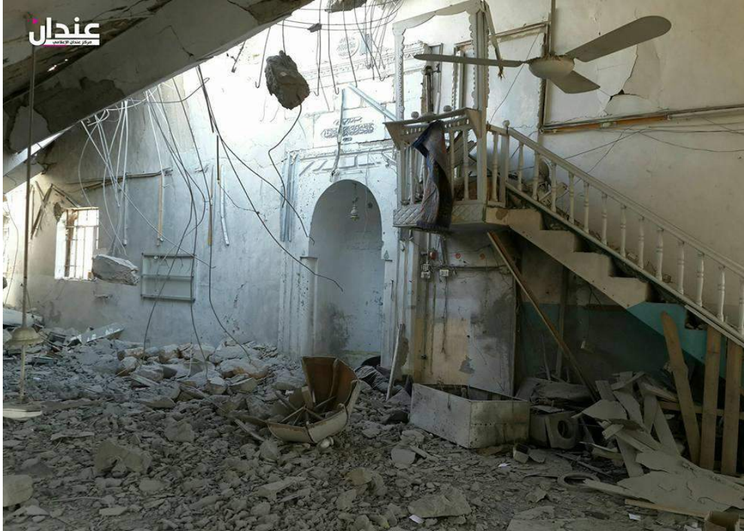
Severe damage to al-Kabir Mosque (SNHR; September 6, 2016)