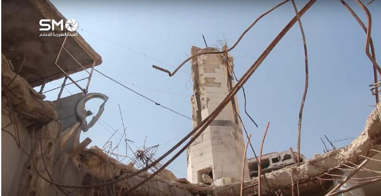
Video still of damage to the minaret of al-Hassan Mosque (SMO Syria; September 5, 2016)