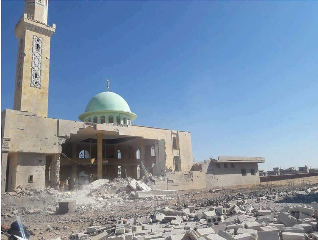
Extensive damage to Fatima al-Zahra Mosque (SNHR; September 10, 2016)