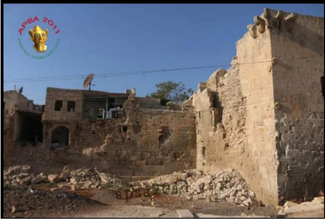
Damage to western facade of the fortification tower and ramparts west of the tower (APSA; August 28, 2016)