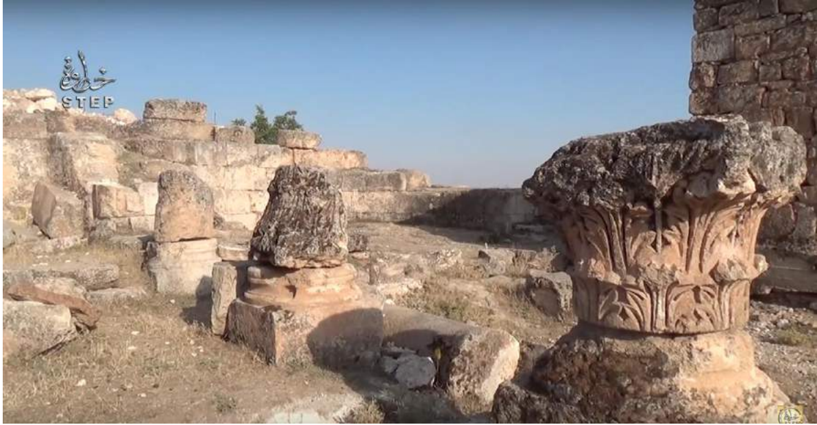
Video still of columns from the Church of Photios (Step News Agency; September 10, 2016)