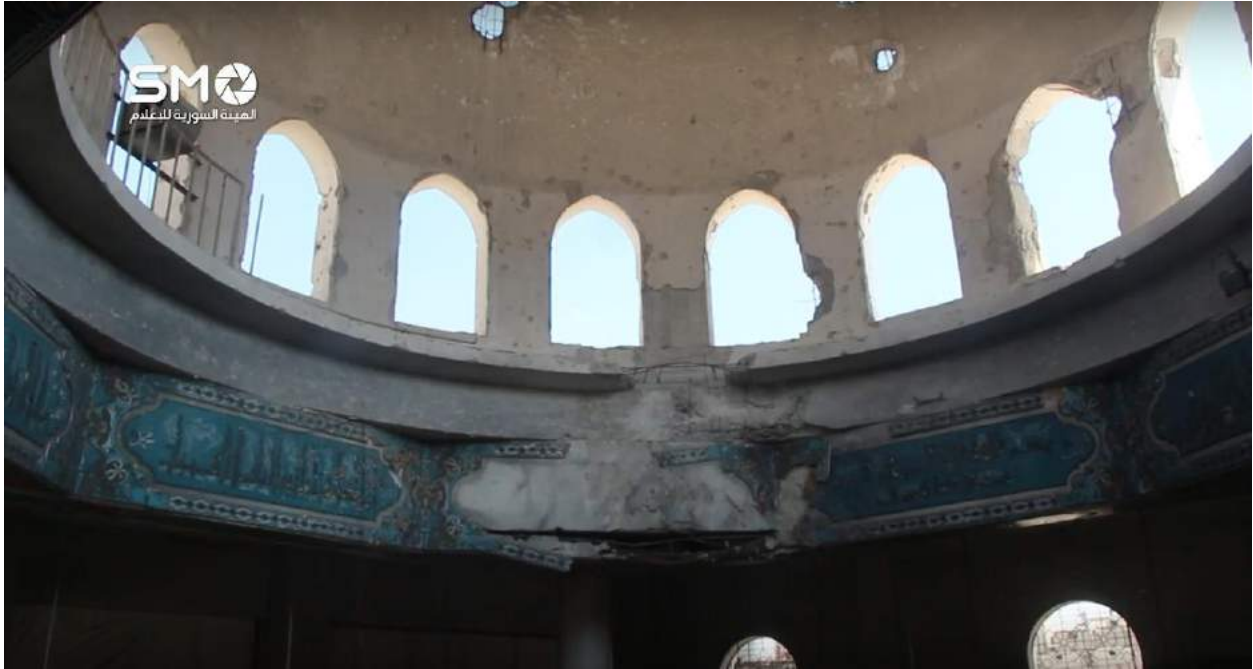
Video still of damage to inside of al-Sahba Abu Bakr al-Sedeiq Mosque (SMO Syria; September 5, 2016)