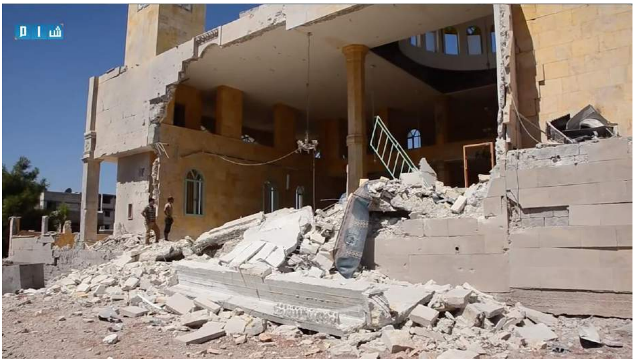
Video still of extensive damage to Fatima al-Zahra Mosque (Shaam News Network; September 9, 2016)