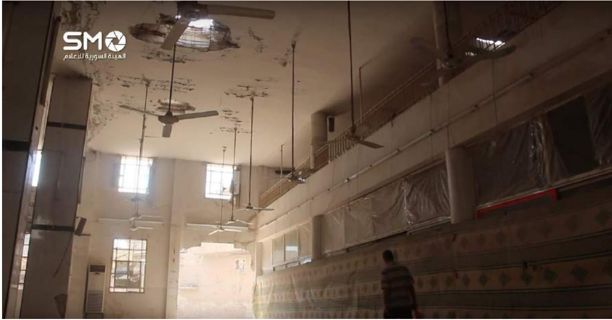
Video still of al-Hassan Mosque showing pedestrian walkway (SMO Syria; September 5, 2016)