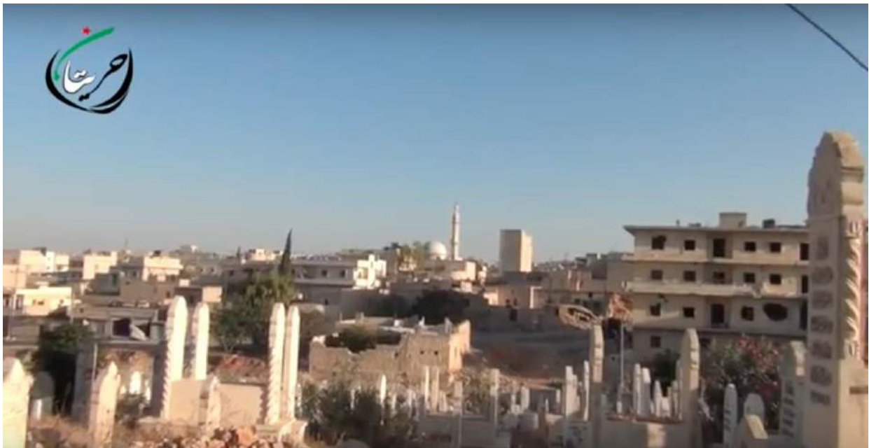
Video still of unidentified cemetery in Hreitan (Hreitan City; September 12, 2016)