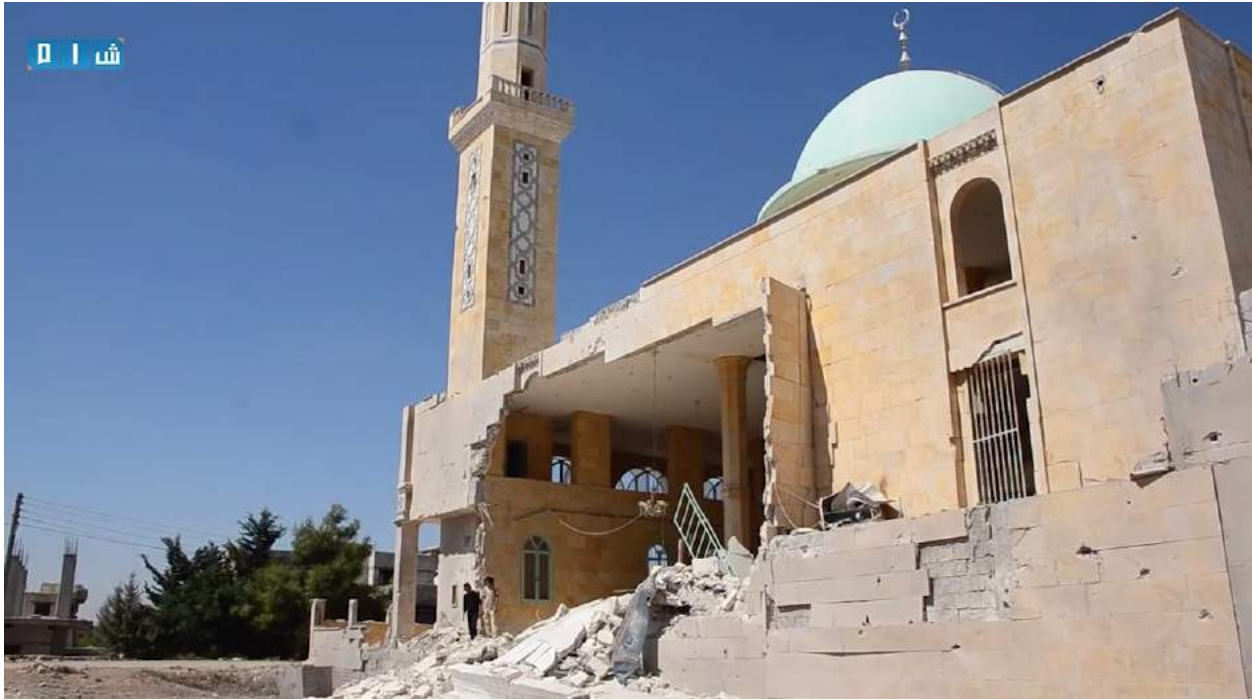
Video still of extensive damage to Fatima al-Zahra Mosque (September 9, 2016)