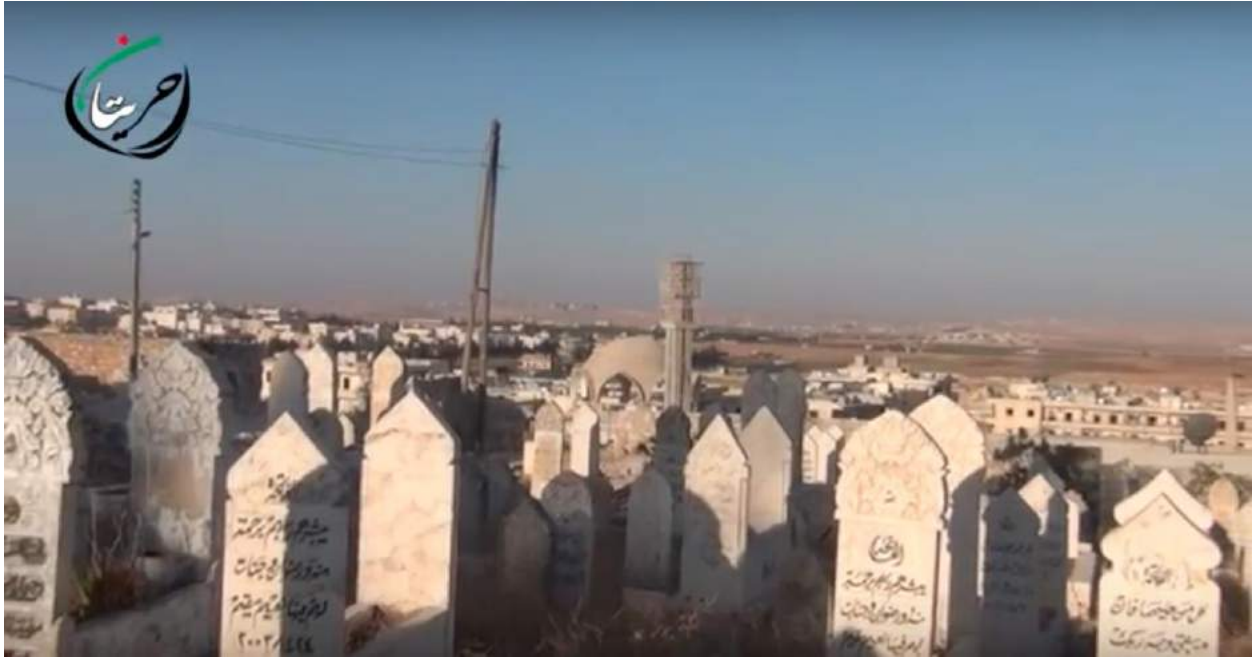
Video still of al-Martyrs Cemetery with al-Quds Mosque dome and minaret in background (Hreitan City; September 12, 2016)