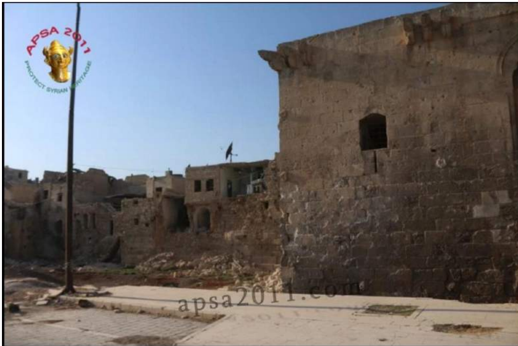
Damage to southern facade of the rampart tower and fortification wall