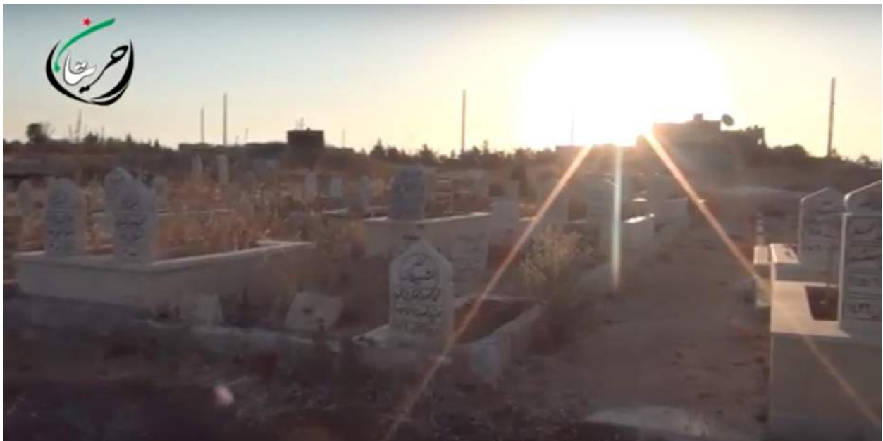
Video still of al-Martyrs Cemetery (Hreitan City; September 12, 2016)