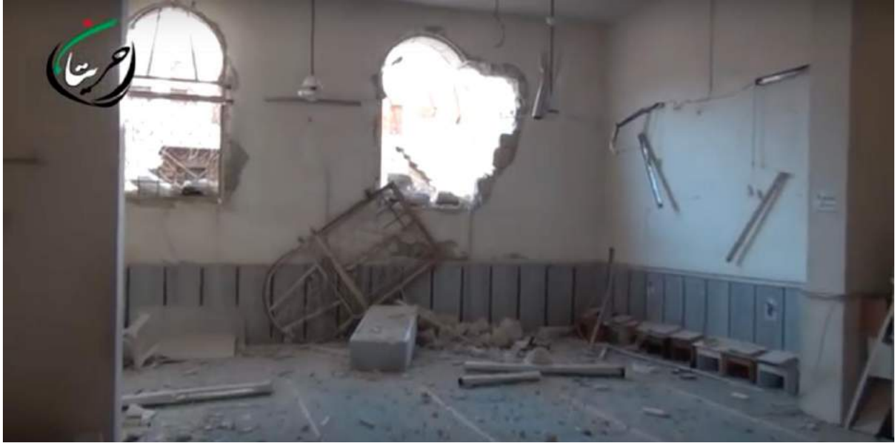
Video still of structural damage to Abu Bakr al-Sedeiq Mosque in Hreitan (Hreitan City; September 12, 2016)