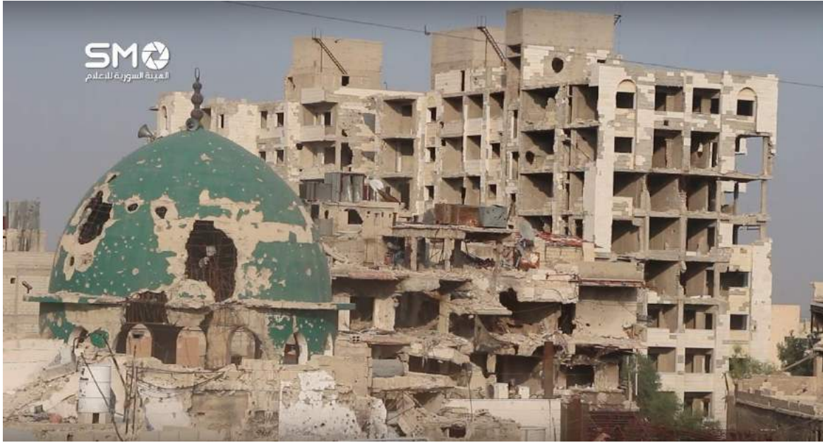
Video still of damage to the dome of al-Sahba Abu Bakr al-Sedeiq Mosque (SMO Syria; September 5, 2016)