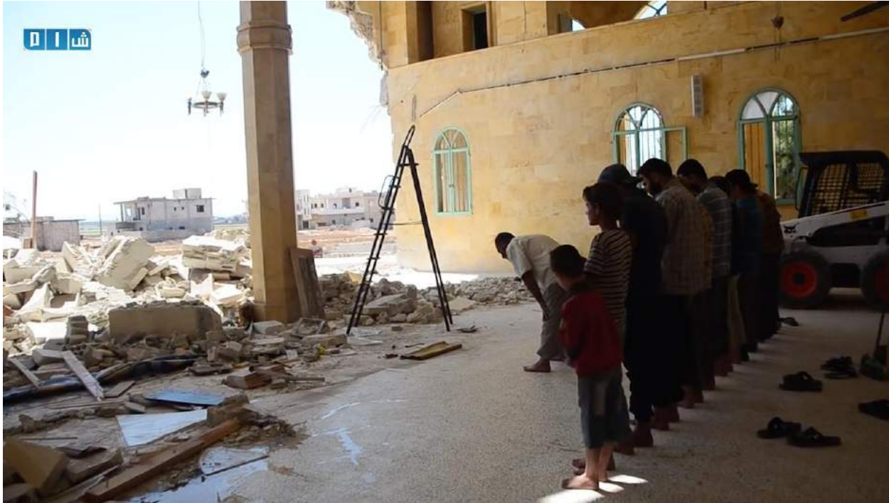
Video still of prayer taking place inside the severely damaged Fatima al-Zahra Mosque (September 9, 2016)