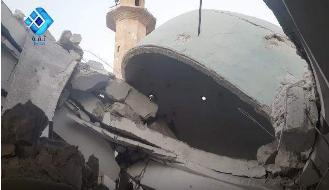
Video still shows extensive damage to the dome of al-Kabir Mosque