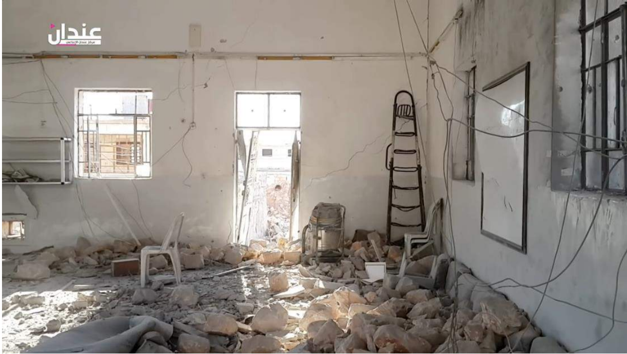
Video still shows severe damage to al-Kabir Mosque (Thiqa News Agency; September 6, 2016)