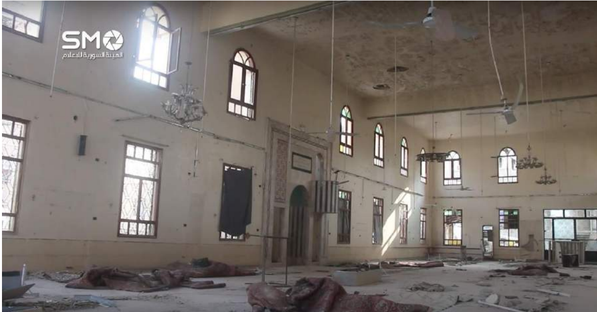
Video still of damage to inside of al-Sahba Abu Bakr al-Sedeiq Mosque (SMO Syria; September 5, 2016)