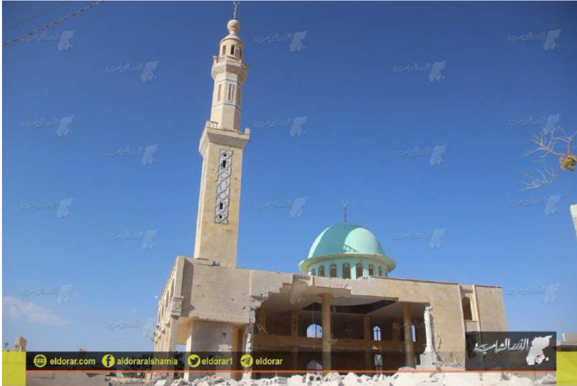
Extensive damage to Fatima al-Zahra Mosque (September 9, 2016)