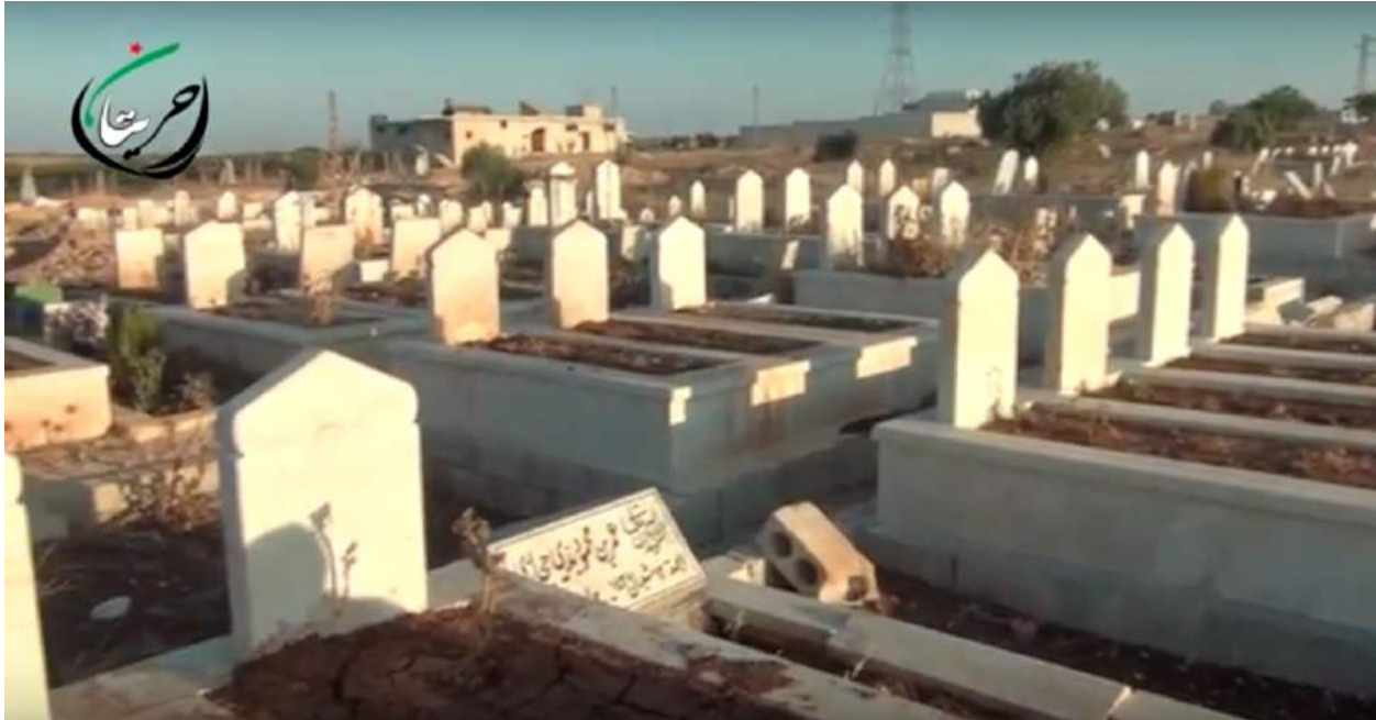
Video still of al-Martyrs Cemetery (Hreitan City; September 12, 2016)