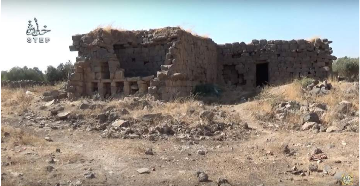
Video still of section of ancient site at Huarte (Step News Agency; September 10, 2016)