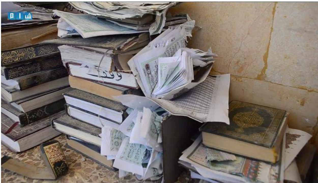
Video still of damage to religious material inside Fatima al-Zahra Mosque (September 9, 2016)