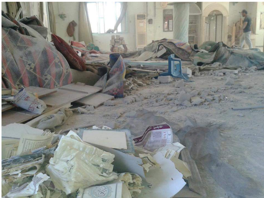
Damage to the interior of Omar bin al-Khattab Mosque (SNHR; September 8, 2016)

Sha3rda3l: https://www.youtube.com/watch?v=mvL6KwQF4uQ