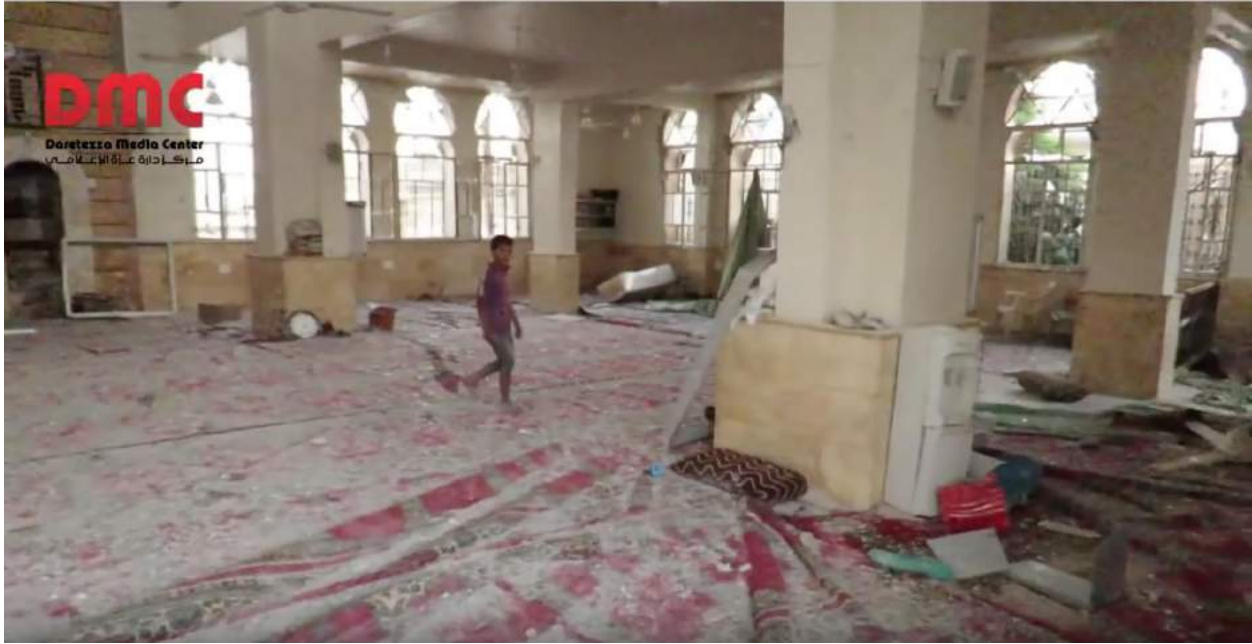
Video still of damage to interior of al-Kabir Mosque (Daretezza Media Center; September 10, 2016)