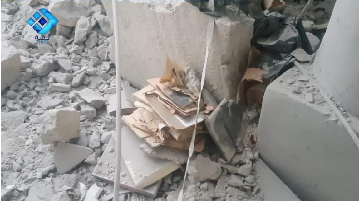
Video still shows damage to religious materials at al-Kabir Mosque (September 6, 2016)