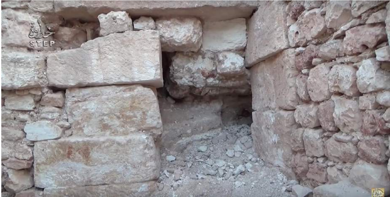
Video still of the Church of Photios showing possible tunneling or erosion of ancient wall (September 10, 2016)