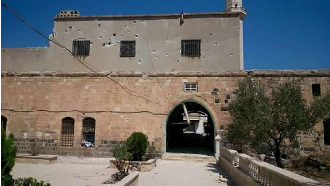
Damage to al-Takiya Mosque (SNHR; September 1, 2016)