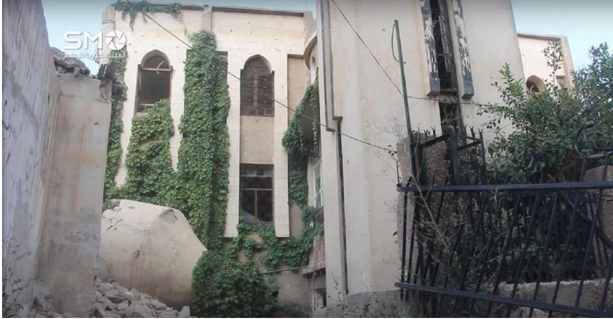
Video still of damage to al-Omari Mosque, the top of the minaret is seen among the rubble (SMO Syria; September 5, 2016)