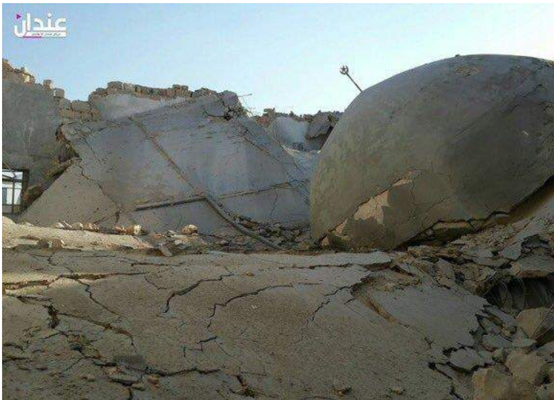
Extensive damage to al-Kabir Mosque (September 6, 2016)