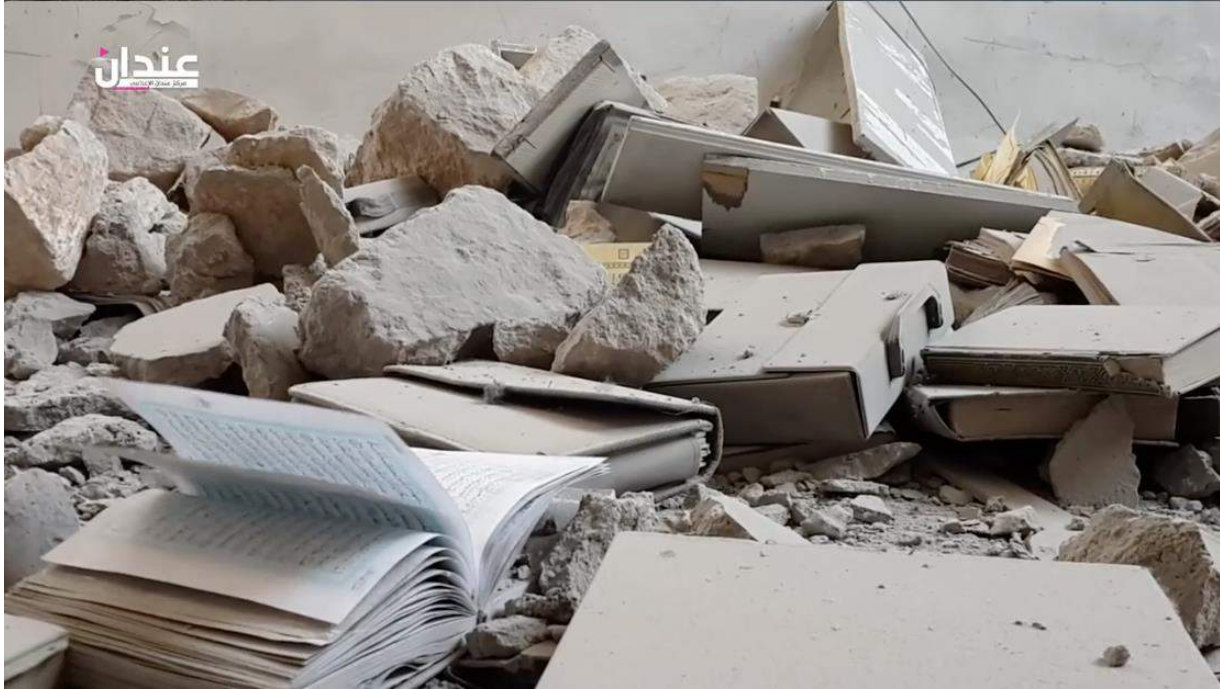
Video still shows damage to religious materials at al-Kabir Mosque (September 6, 2016)