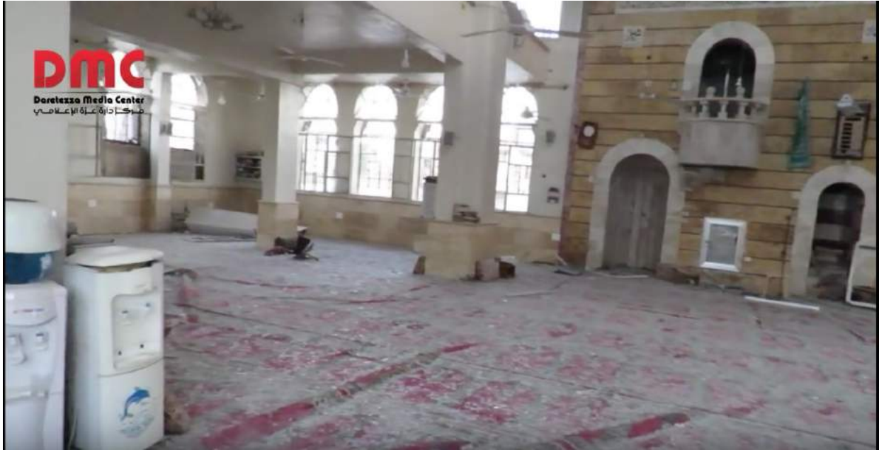
Video still of damage to interior of al-Kabir Mosque (Daretezza Media Center; September 10, 2016)