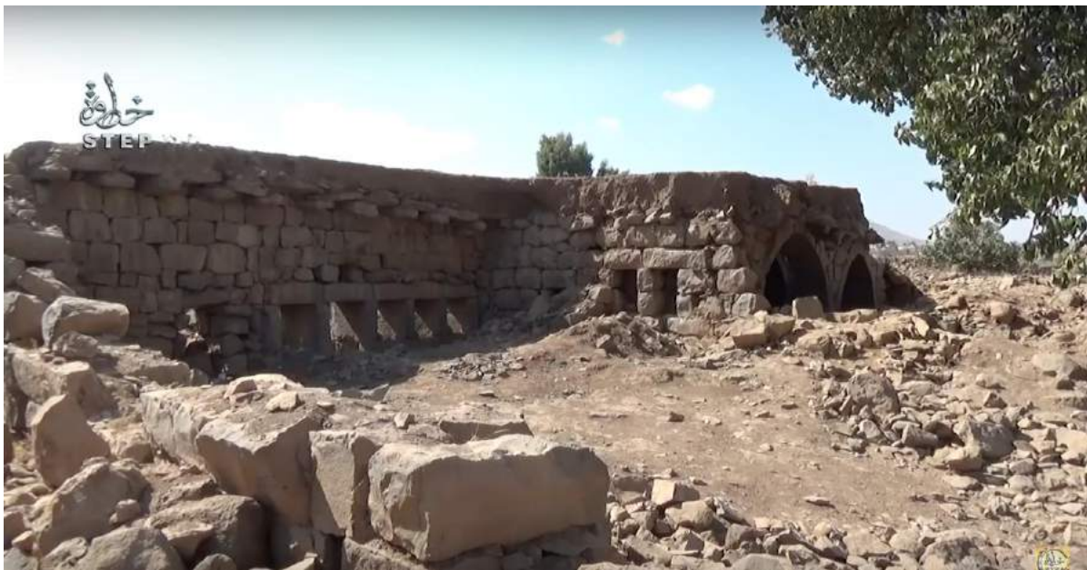
Video still of section of ancient site at Huarte (Step News Agency; September 10, 2016)