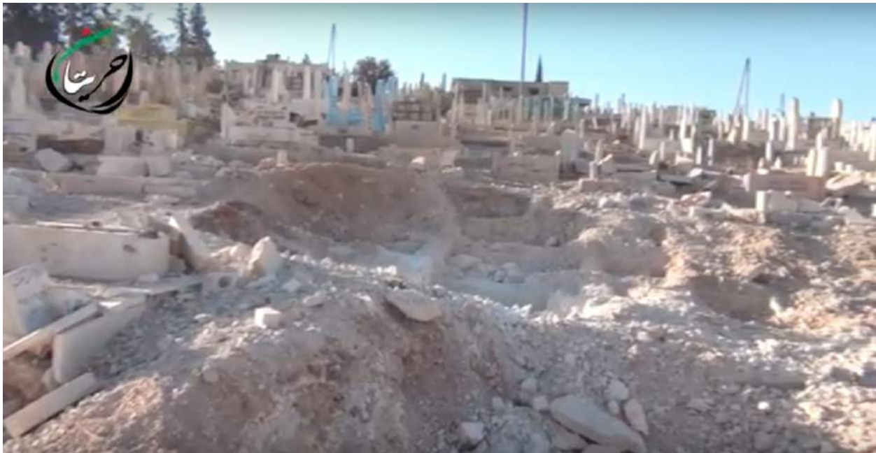
Video still of al-Martyrs Cemetery showing possible airstrike crater (Hreitan City; September 12, 2016)