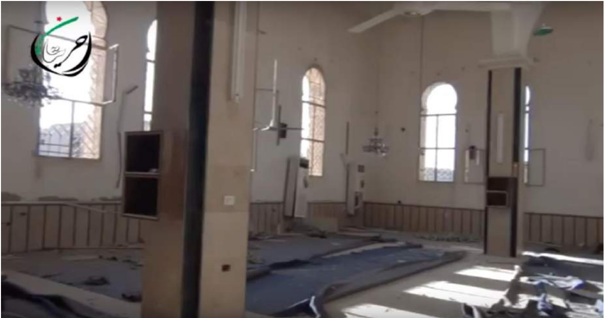
Video still of light interior damage to Abu Bakr al-Sedeiq Mosque in Hreitan (Hreitan City; September 12, 2016)