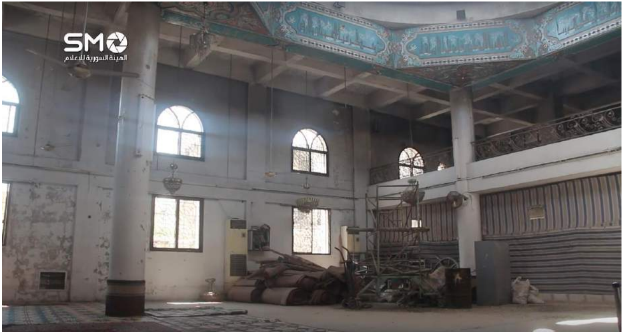
Video still of damage to inside of al-Sahba Abu Bakr al-Sedeiq Mosque (SMO Syria; September 5, 2016)