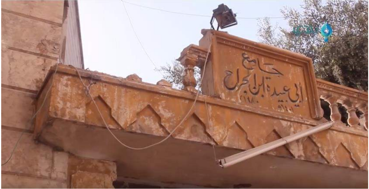
Damage to the exterior of Abu Obeida ibn al-Jarah Mosque (Baladi News; September 10, 2016)