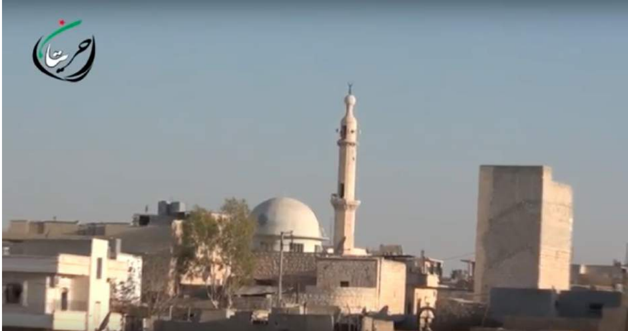
Video still of Abu Bakr al-Sedeiq Mosque in Hreitan (Hreitan City; September 12, 2016)

Hreitan City: https://www.youtube.com/watch?v=Gp09D02D80c