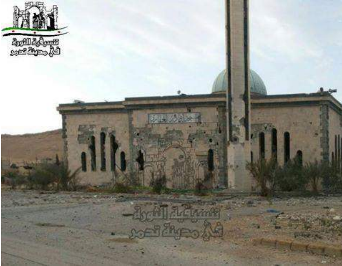
A new photograph shared by the Palmyra Coordination Committee shows damage to the exterior of Abi Thar Al Ghafari Mosque (Palmyra Coordination Committee; September 8, 2016)