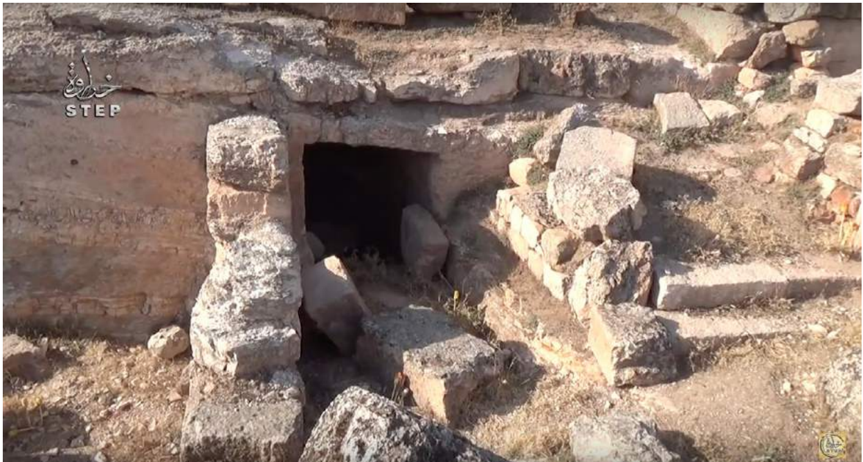
Video still of subterranean entrance to mithraeum (September 10, 2016)