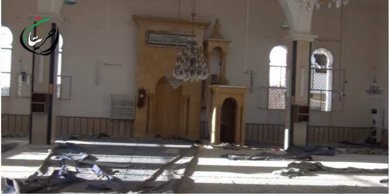
Video still of damage to the interior of Abu Bakr al-Sedeiq Mosque in Hreitan (Hreitan City; September 12, 2016)