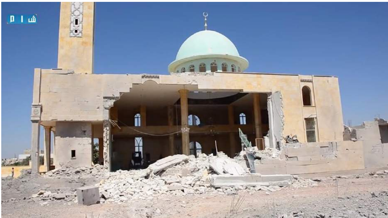
Video still of extensive damage to Fatima al-Zahra Mosque (Shaam News Network; September 9, 2016)