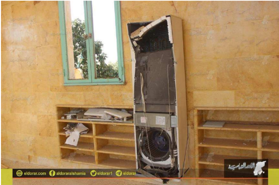
Material damage inside Fatima al-Zahra Mosque (El Dorar al-Shamiya News; September 9, 2016)