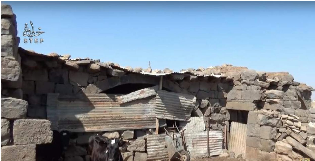
Video still of makeshift walls built by IDPs (Step News Agency; September 10, 2016)