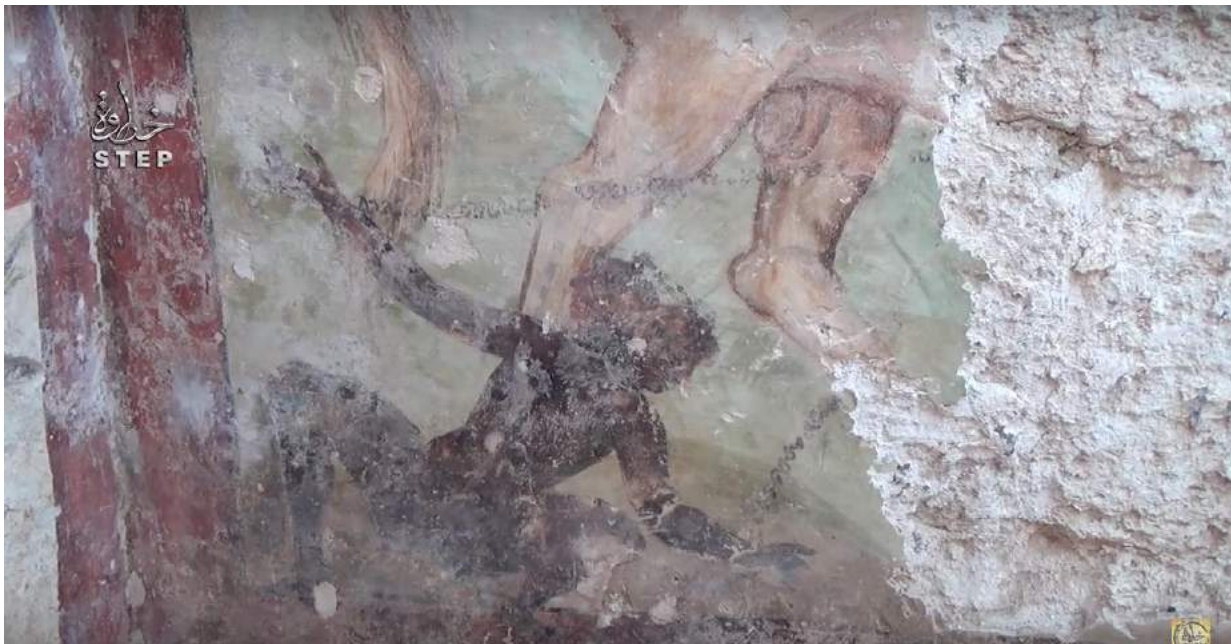
Video still of a mural in mithraeum (Step News Agency; September 10, 2016)