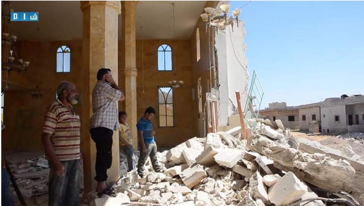
Video still of severe damage to the interior of Fatima al-Zahra Mosque (Shaam News Network; September 9, 2016)