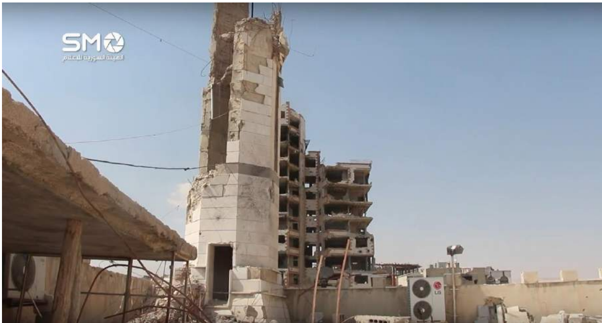
Video still of damage to the minaret of al-Hassan Mosque (SMO Syria; September 5, 2016)