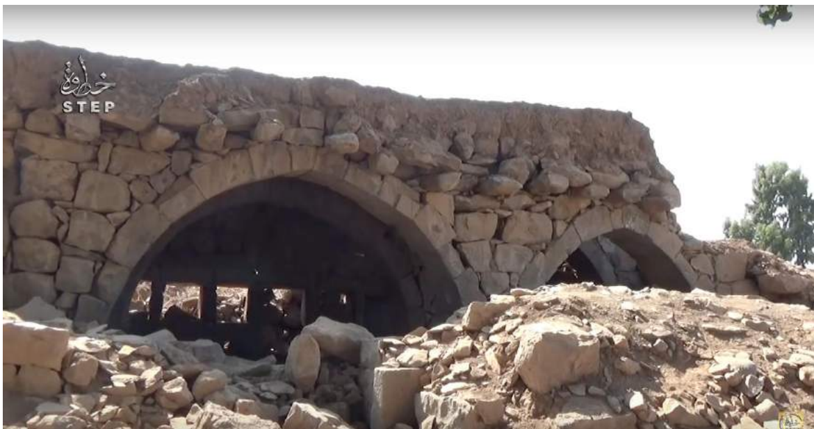
Video still of section of ancient site at Huarte (Step News Agency; September 10, 2016)