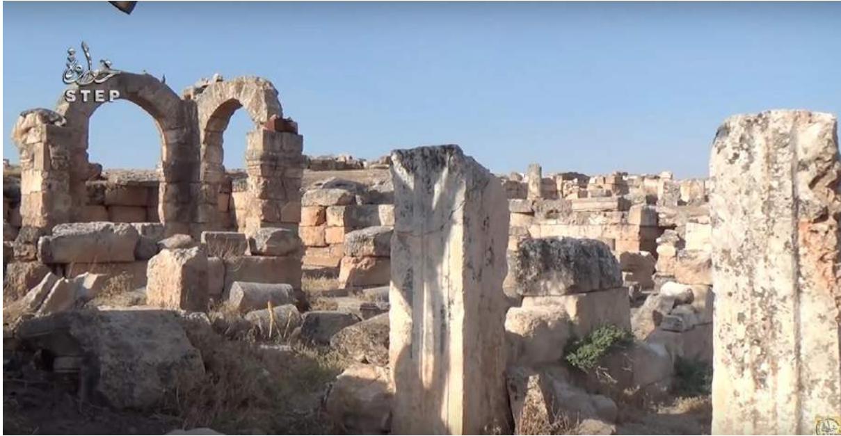
Video still of the Church of Photios, facing east (September 10, 2016)