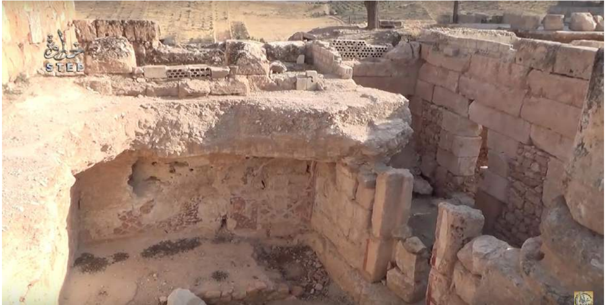
Video still of the mithraeum, facing west (Step News Agency; September 10, 2016)