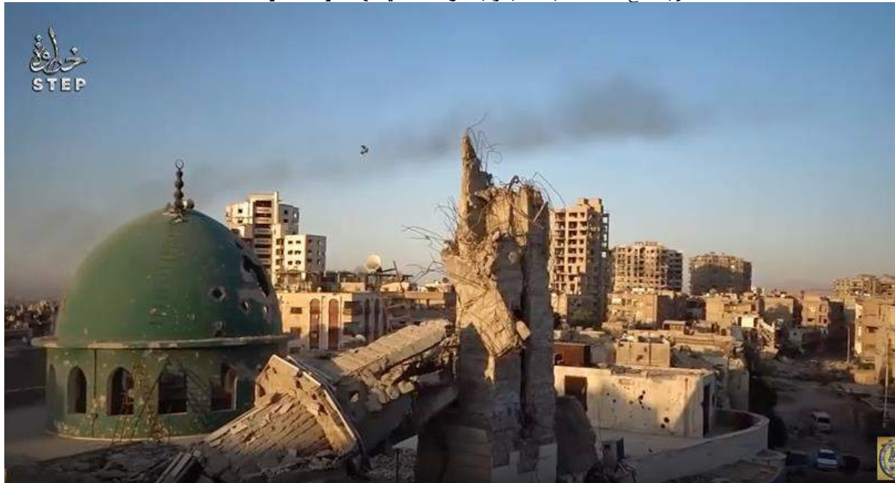
Video still of the damage to al-Sahba Abu Bakr al-Sedeiq Mosque (September 13, 2016)