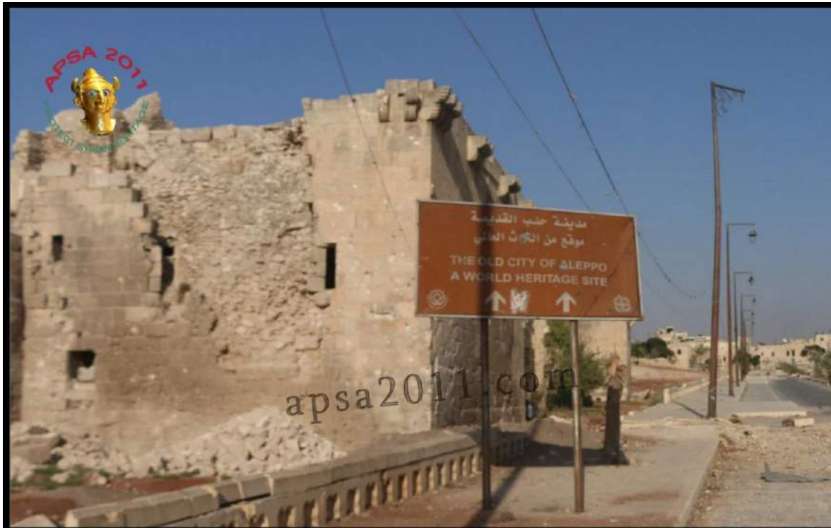
Damage to western facade of fortification tower (APSA; August 28, 2016)