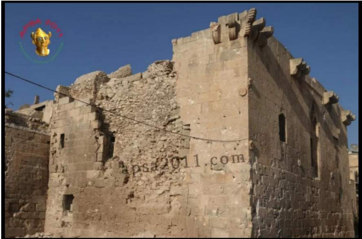
Damage to western facade of fortification tower (APSA; August 28, 2016)