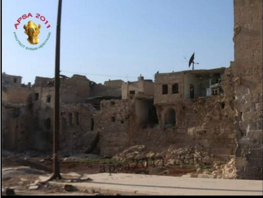
Damage to fortification wall west of the tower (APSA; August 28, 2016)