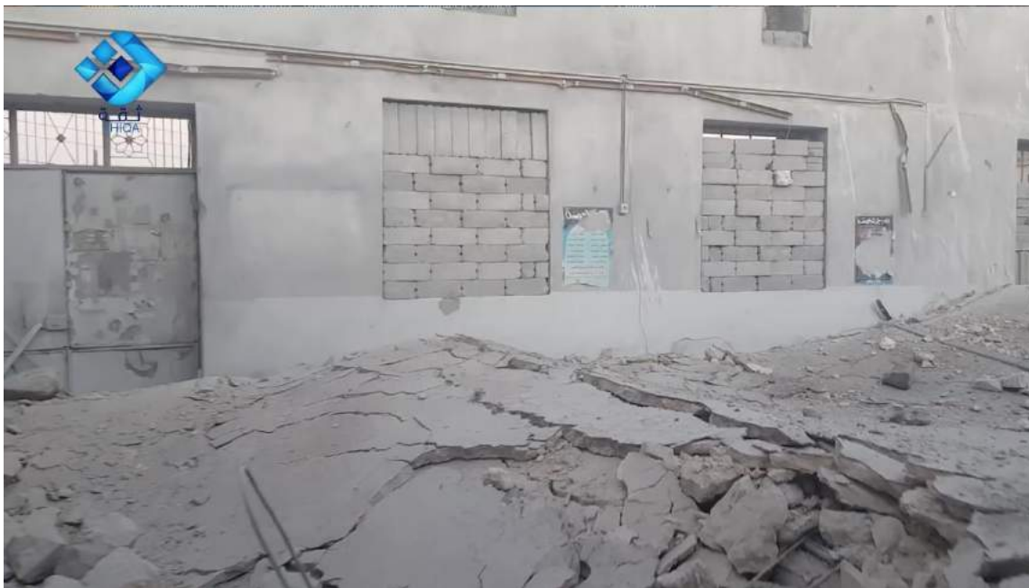
Video still shows extensive damage to al-Kabir Mosque (Thiqat News Agency; September 6, 2016)