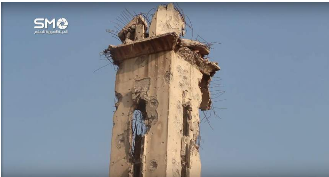
Video still of damage to the minaret of al-Omari Mosque (SMO Syria; September 5, 2016)