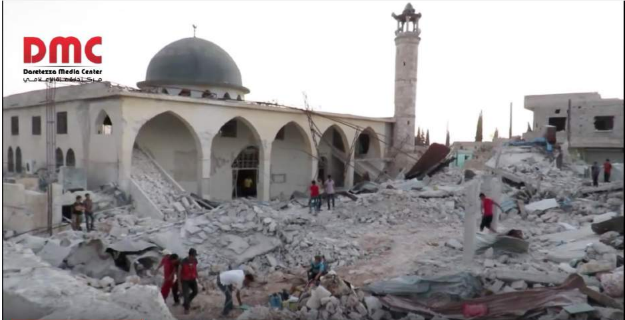
Video still of damage to exterior of al-Kabir Mosque and surrounding area (September 10, 2016)