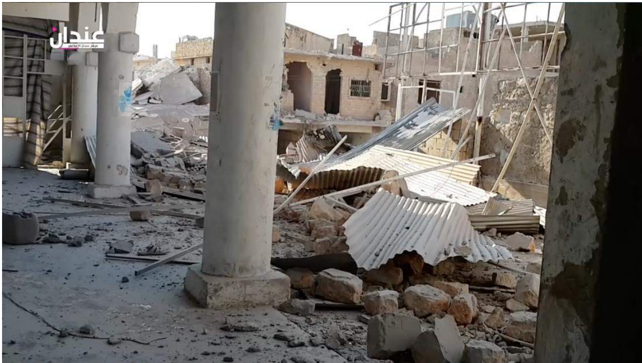
Video still shows extensive damage to the exterior of al-Kabir Mosque (September 6, 2016)