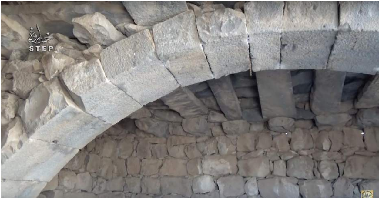
Video still of the inside roof of the Church of Photios (September 10, 2016)