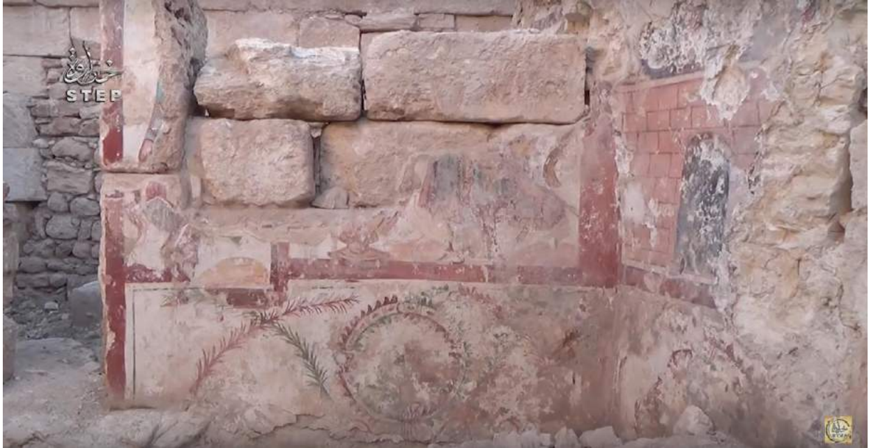
Video still of the northwest corner of the mithraeum showing the wall murals (Step News Agency; September 10, 2016)