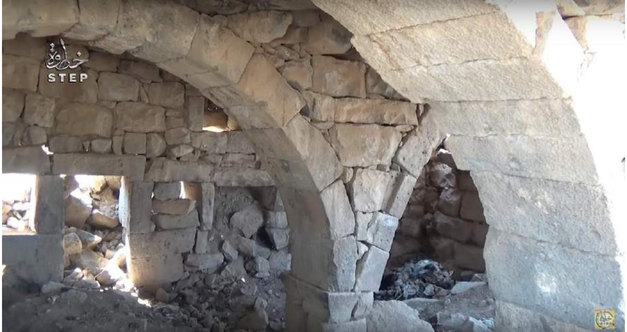
Video still of the inside of the Church of Photios (Step News Agency; September 10, 2016)