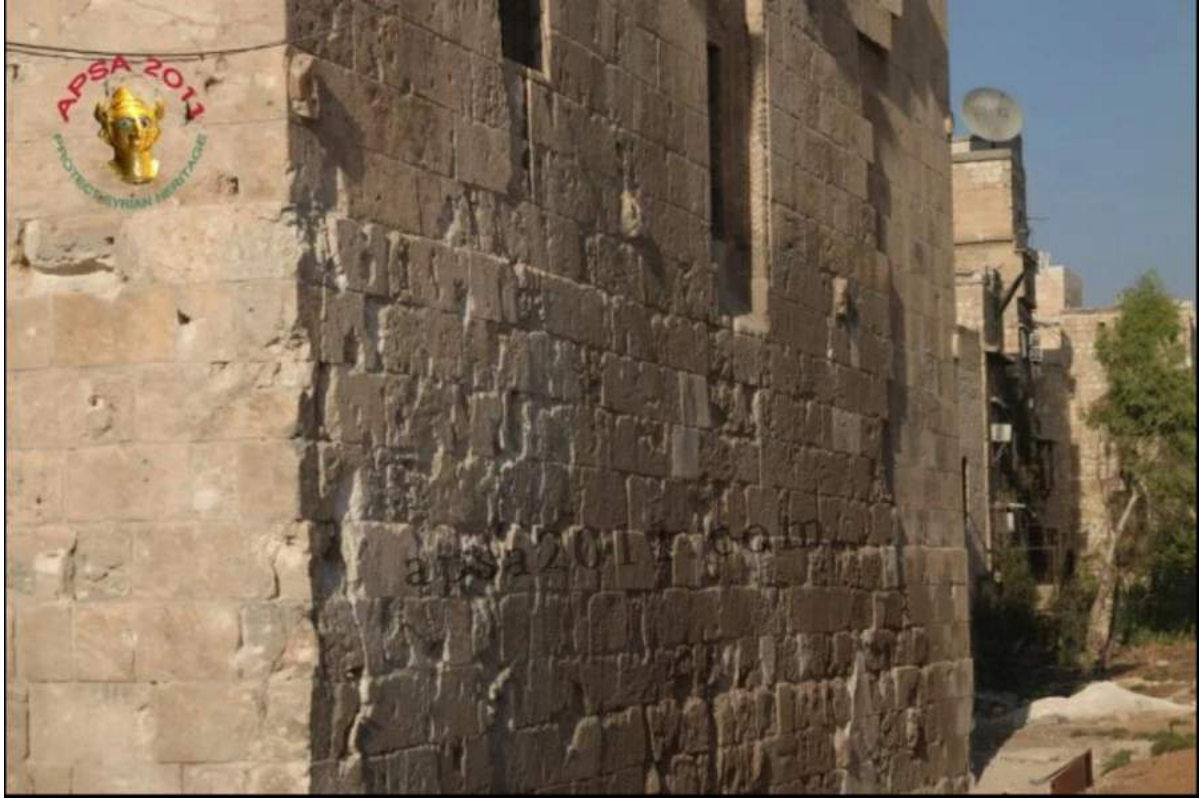
Damage to southern facade of fortification tower (August 28, 2016)