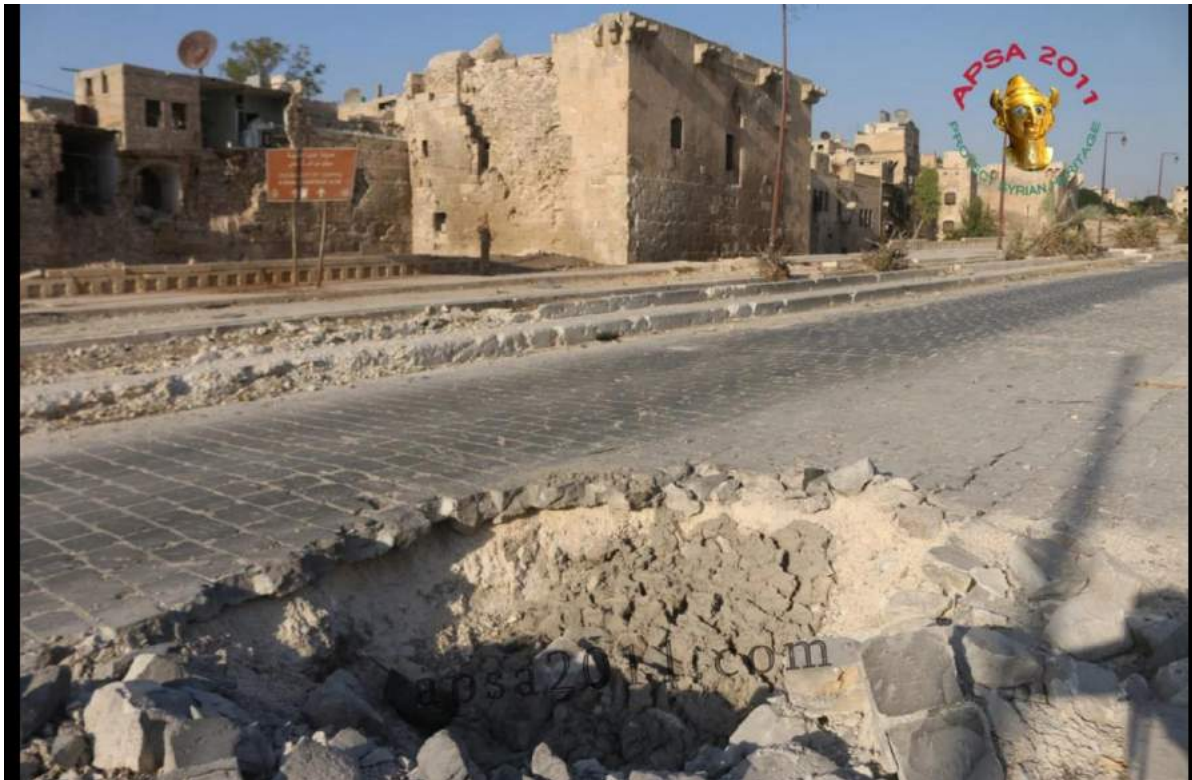
Damage to street and fortification tower, facing northeast (APSA; August 28, 2016)