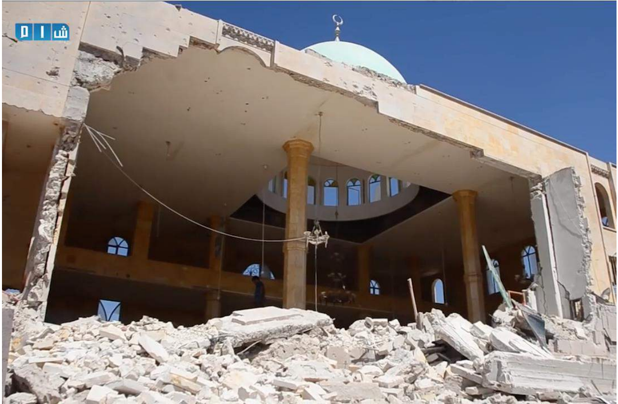
Video still of extensive damage to Fatima al-Zahra Mosque (September 9, 2016)