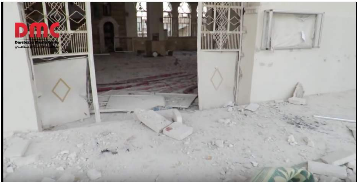
Video still of damage to entrance to al-Kabir Mosque (Daretezza Media Center; September 10, 2016)