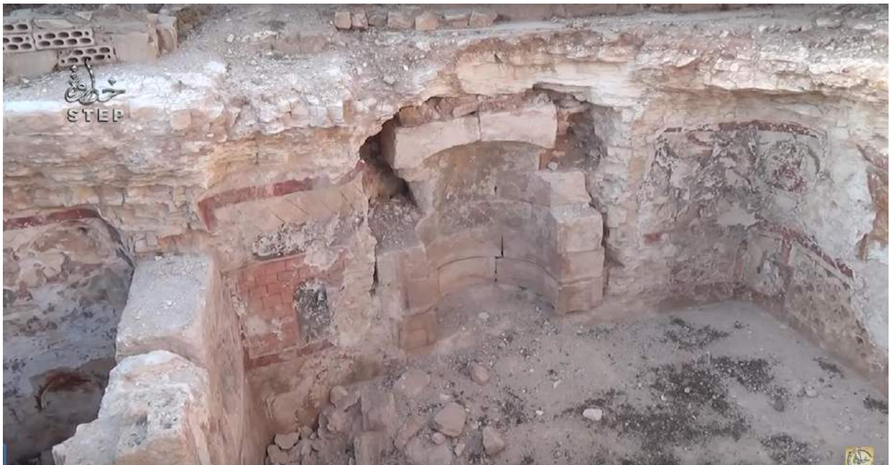
Video still of the northeast corner of the Mithraeum showing the missing roof (September 10, 2016)