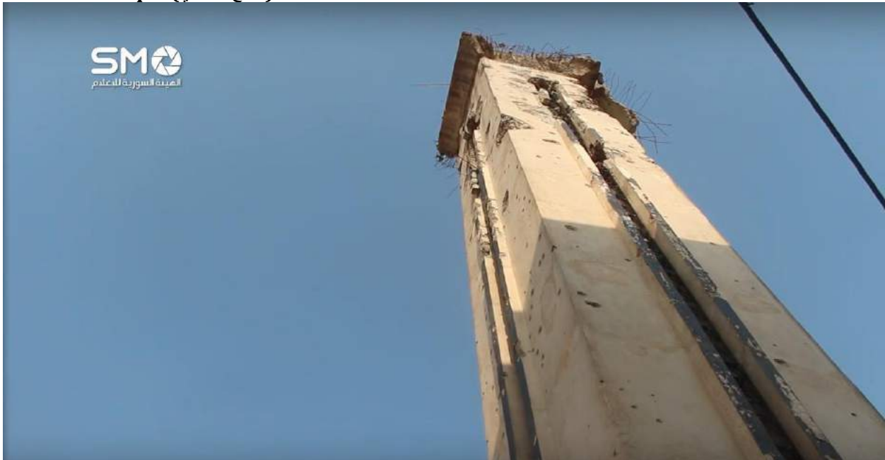
Video still of damage to minaret of al-Omari Mosque (SMO Syria; September 5, 2016)