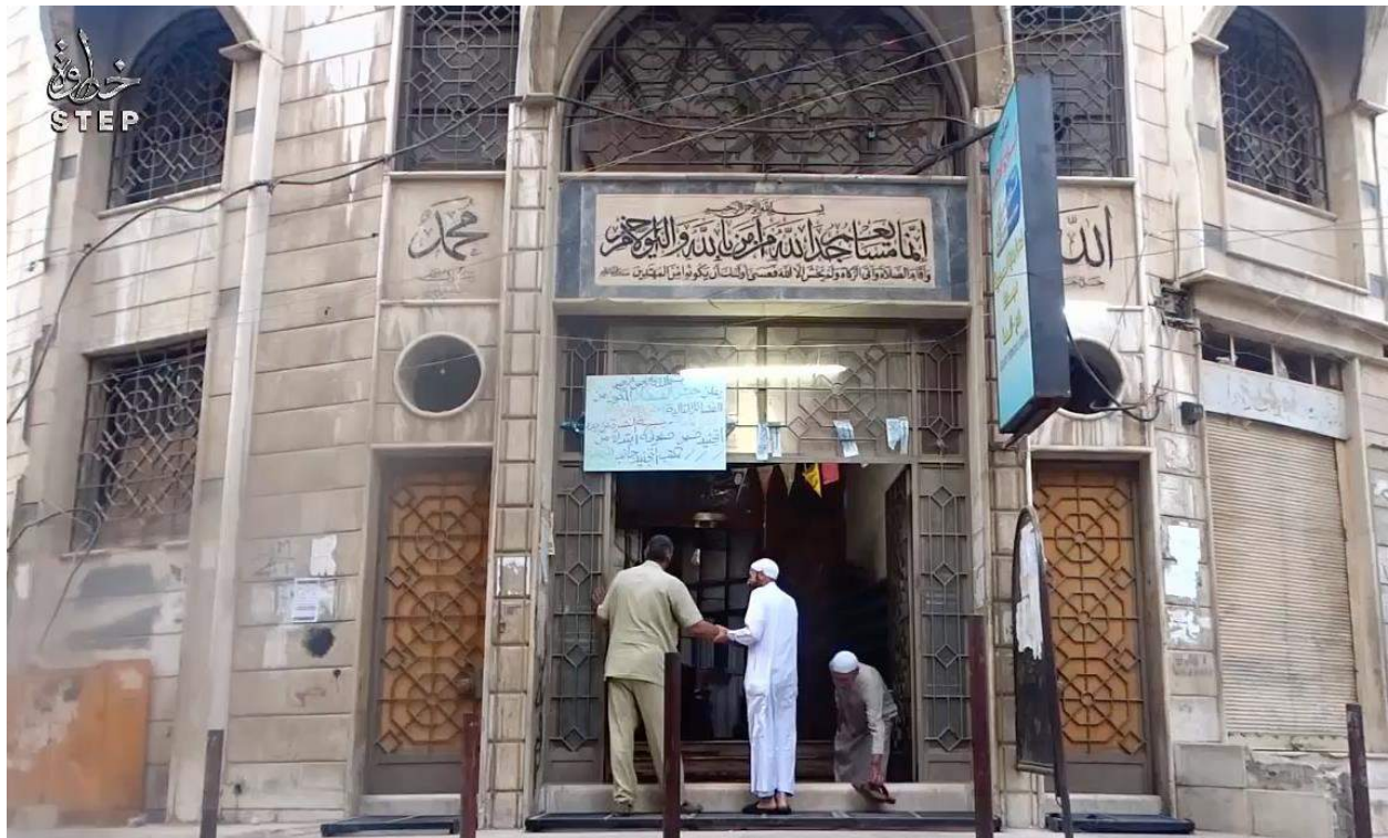
Video still of the exterior of al-Sahba Abu Bakr al-Sedeiq Mosque showing some light damage (Step News Agency; September 13, 2016)