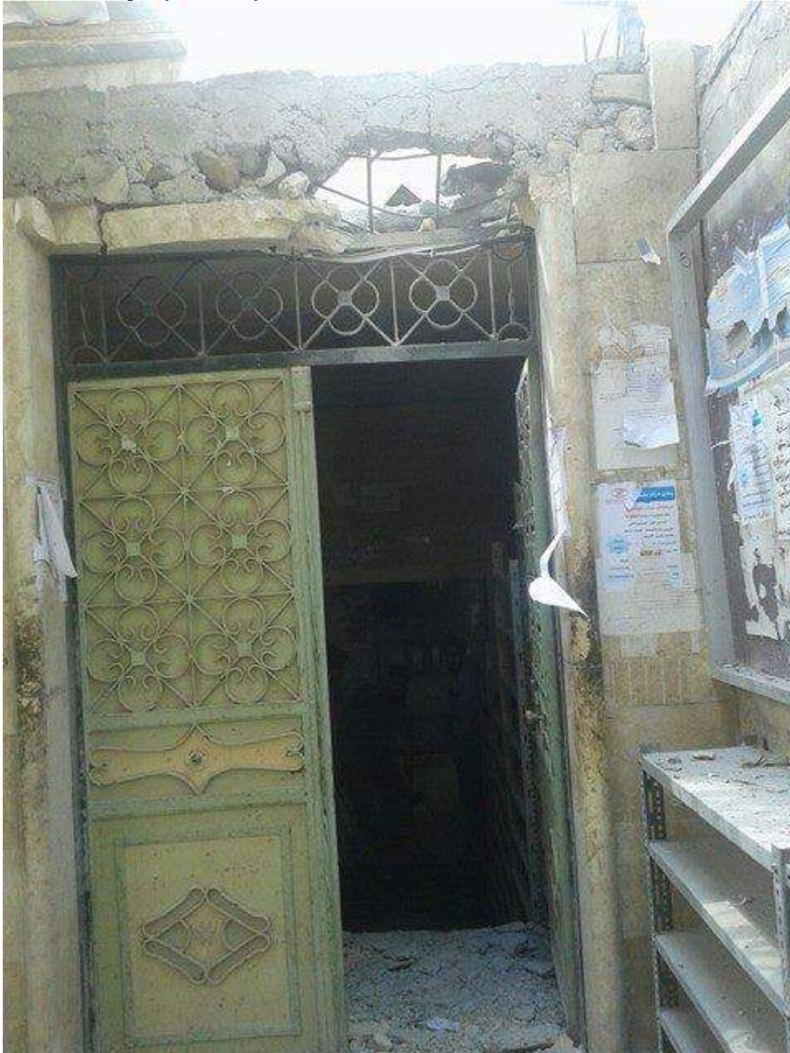
Damage to al-Kabir Mosque (SNHR; September 2, 2016)