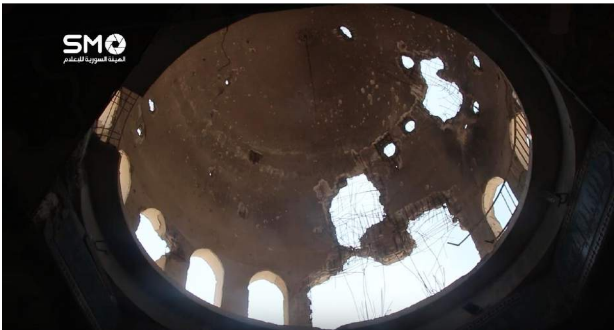
Video still of damage to inside of the dome at al-Sahba Abu Bakr al-Sedeiq Mosque (SMO Syria; September 5, 2016)