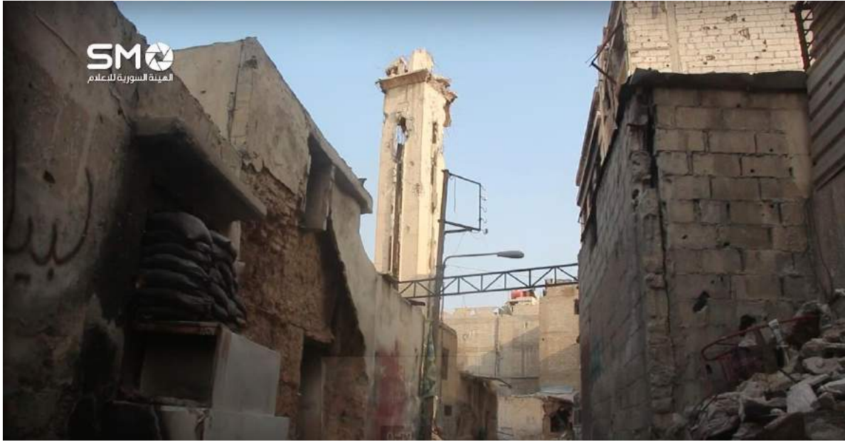
Video still of damage to minaret of al-Omari Mosque (SMO Syria; September 5, 2016)