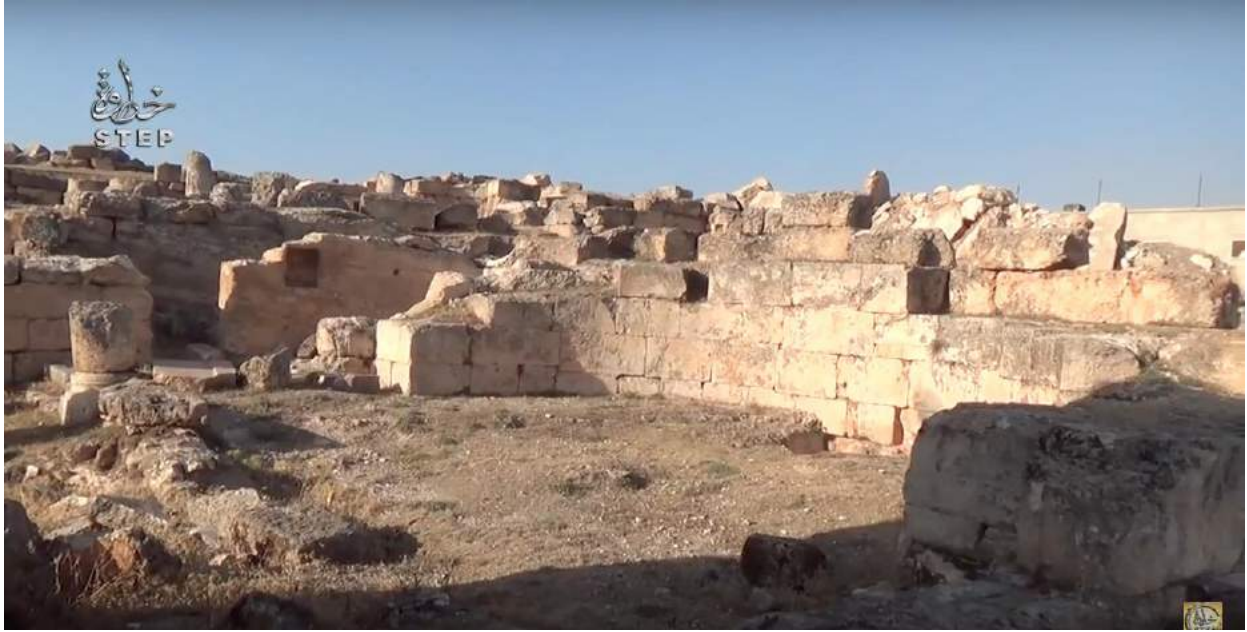
Video still of section of the Church of Photios (Step News Agency; September 10, 2016)