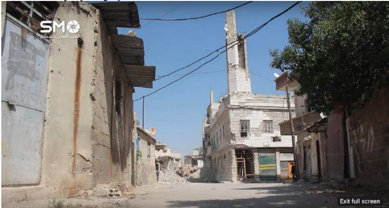
Video still of damage to the minaret of al-Hassan Mosque (SMO Syria; September 5, 2016)