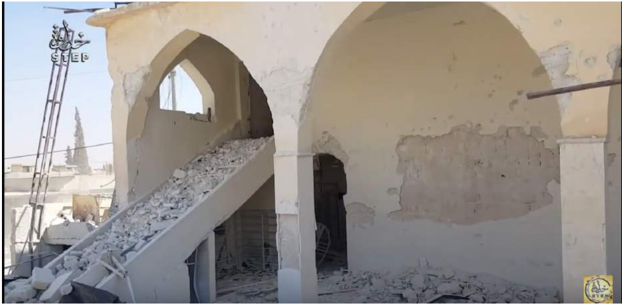
Video still of damage to exterior of al-Kabir Mosque (September 10, 2016)