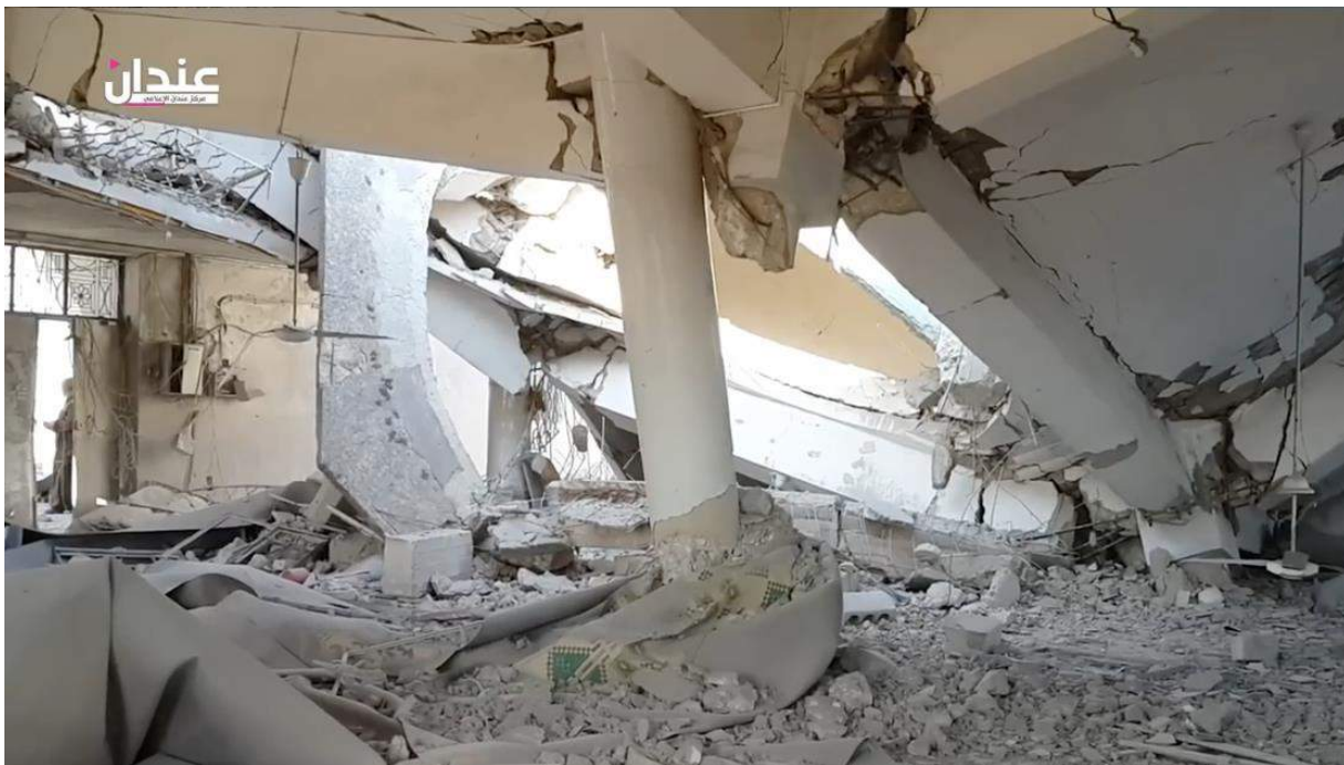
Video still shows severe damage to al-Kabir Mosque (September 6, 2016)