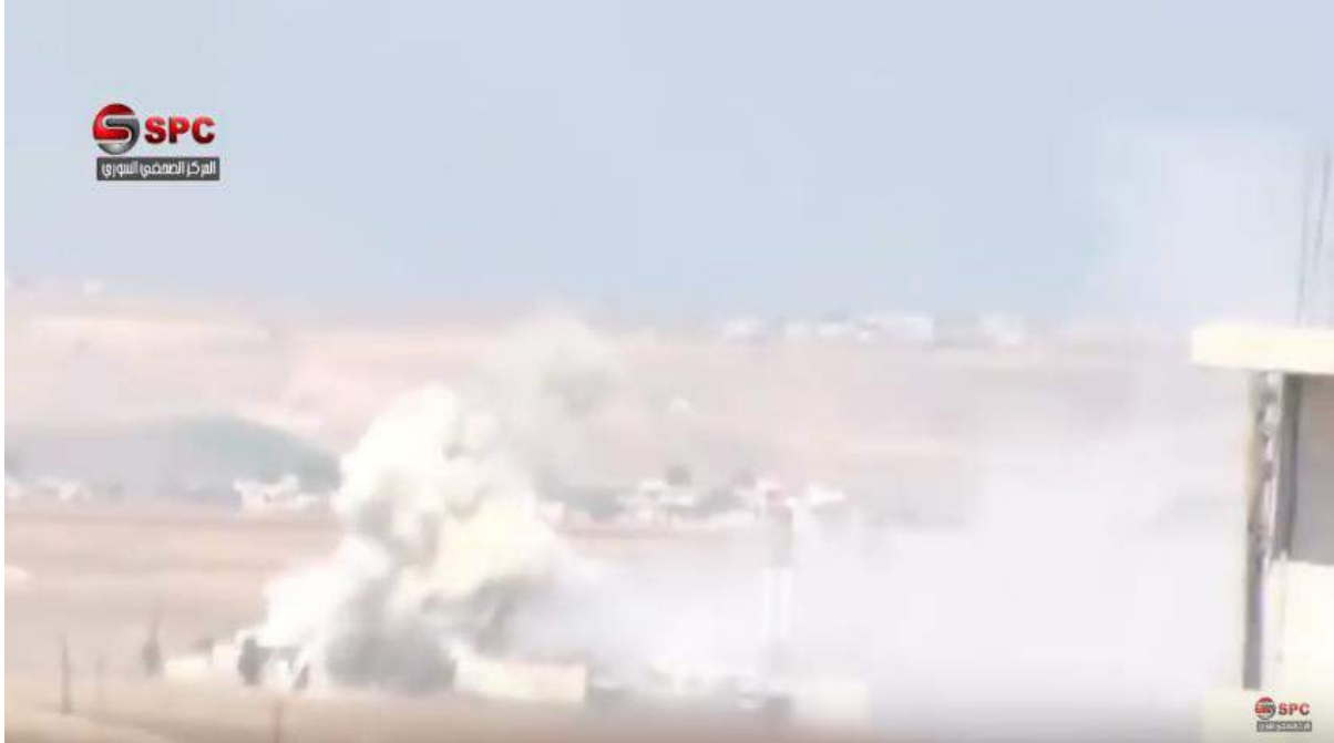
Video still an airstrike striking a mosque in Arbaeen village (September 5, 2016)