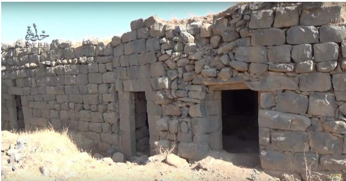
Video still of section of ancient site at Huarte