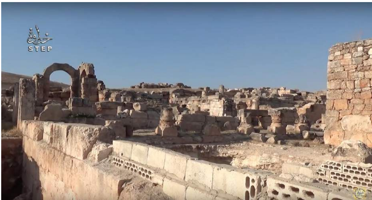
Video still of the top of the Church of Photios facing southeast, with stabilizing blocks in the foreground (September 10, 2016)