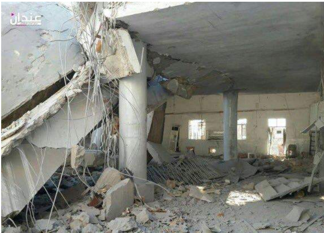
Extensive damage to al-Kabir Mosque (September 6, 2016)