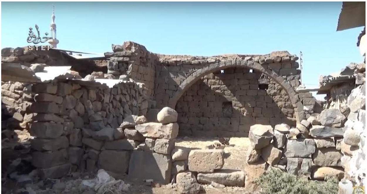
Video still of section of ancient site at Huarte (Step News Agency; September 10, 2016)