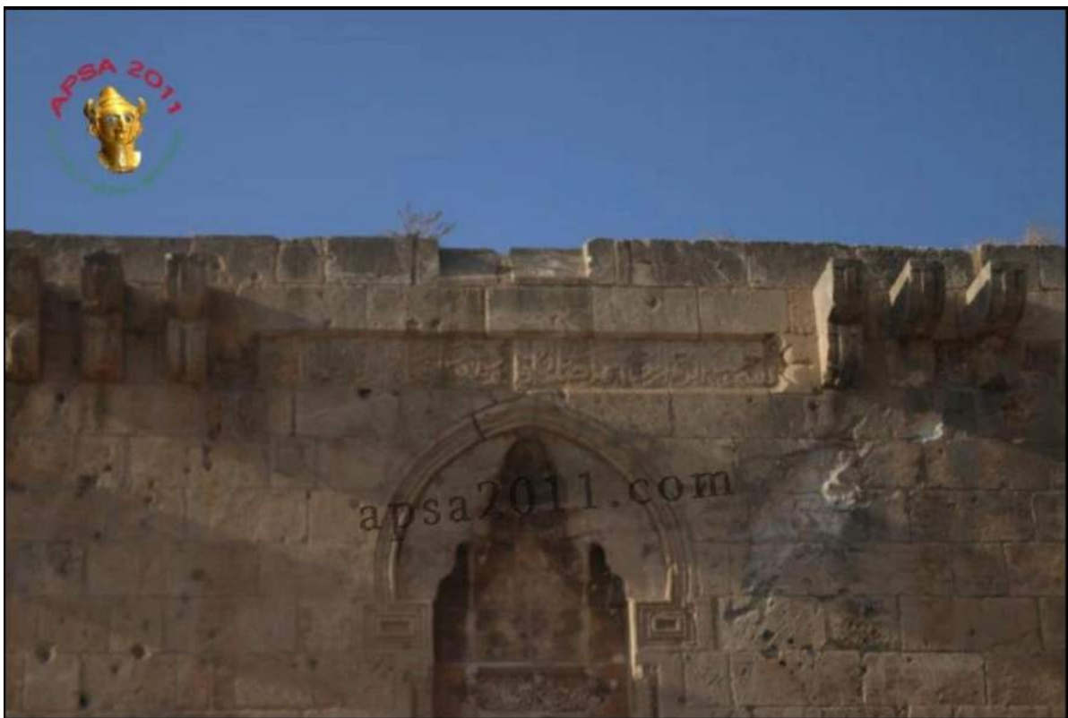
Damage to southern facade of fortification tower (APSA; August 28, 2016)