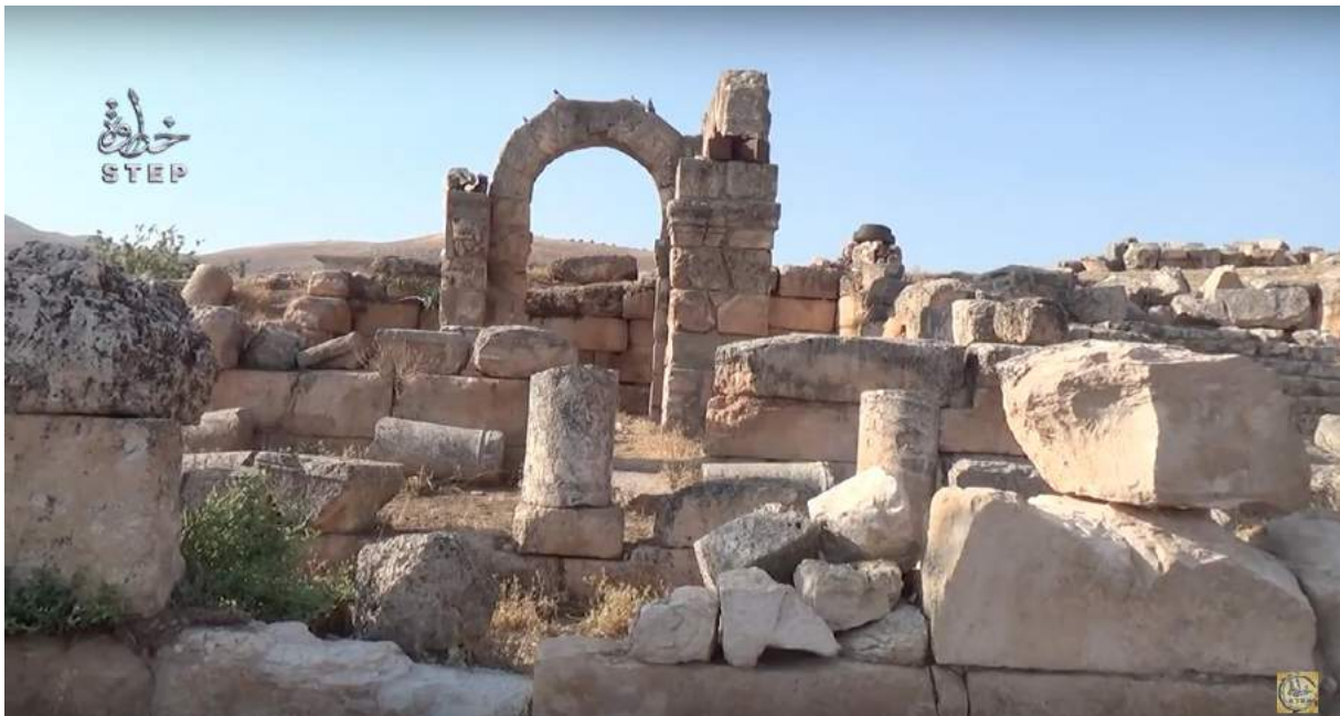
Video still of the Church of Photios, facing east (September 10, 2016)

http://www.tertullian.org/rpearse/mithras/display.php?page=supp Syria Hawarte Mithraeum