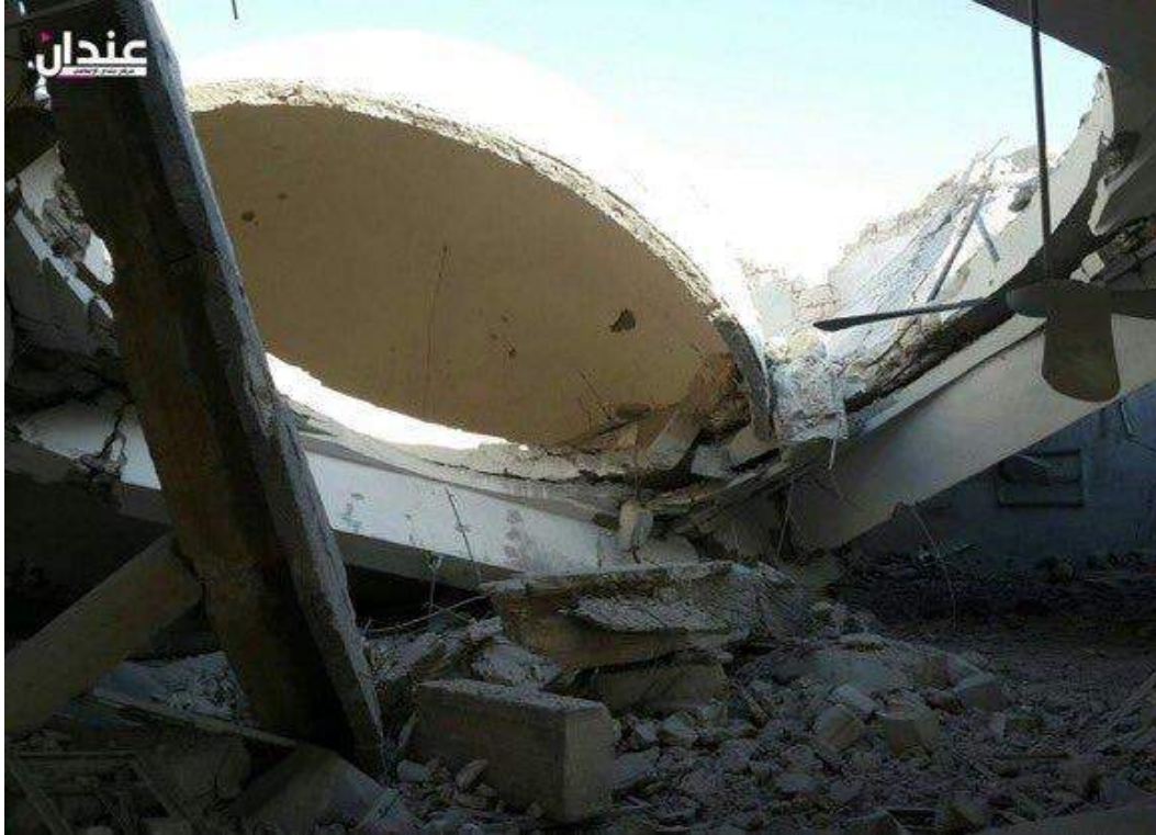
Extensive damage to al-Kabir Mosque (September 6, 2016)