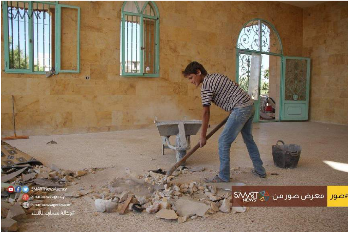
Clean up efforts inside Fatima al-Zahra Mosque (SMAART News Agency; September 9, 2016)