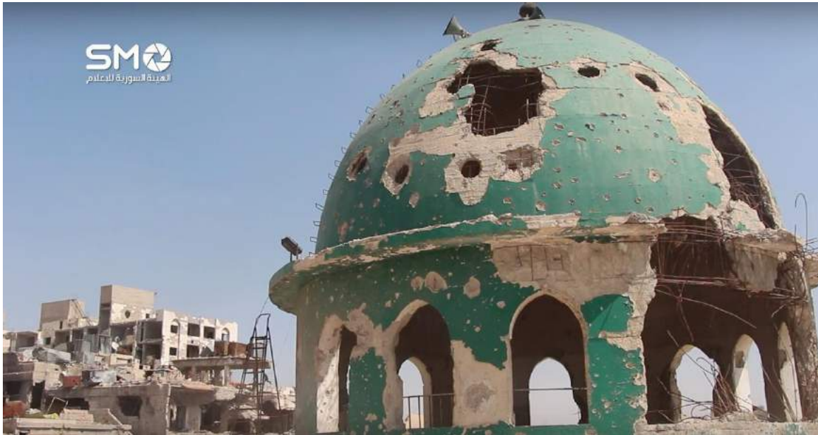
Video still of damage to the dome of al-Sahba Abu Bakr al-Sedeiq Mosque (SMO Syria; September 5, 2016)