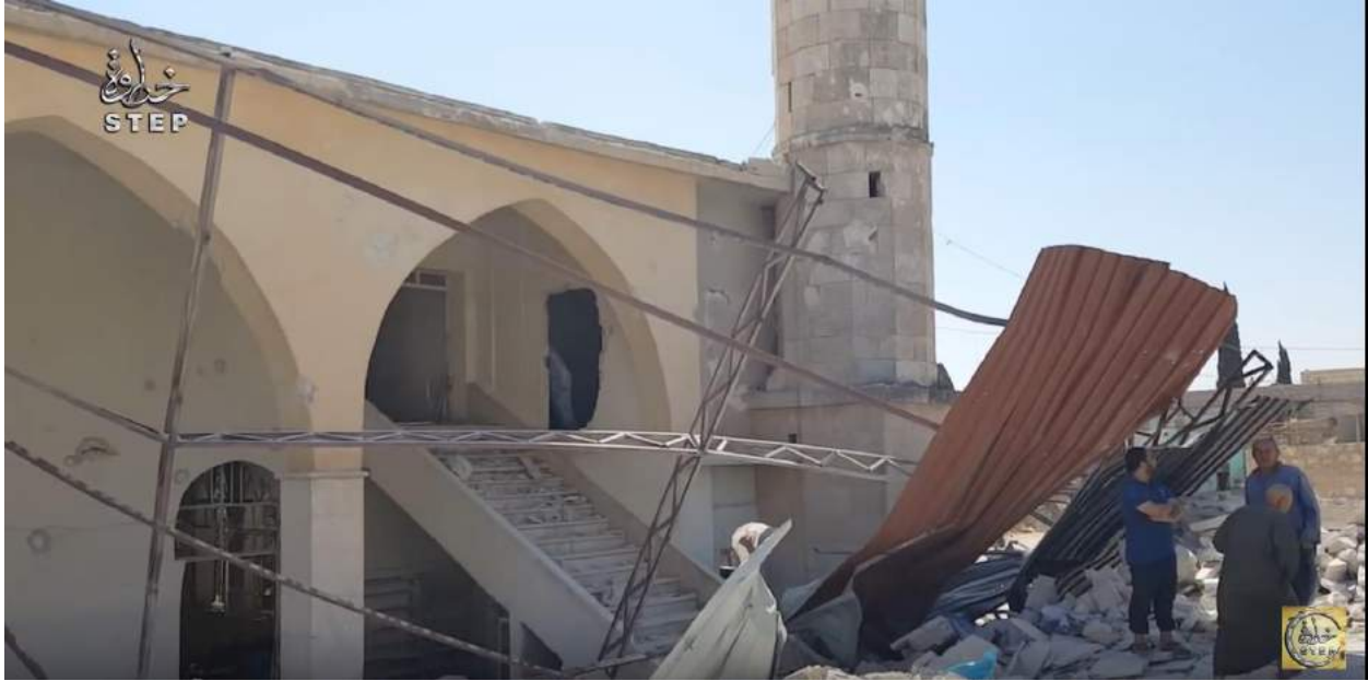
Video still of damage to exterior of al-Kabir Mosque and surrounding area (September 10, 2016)