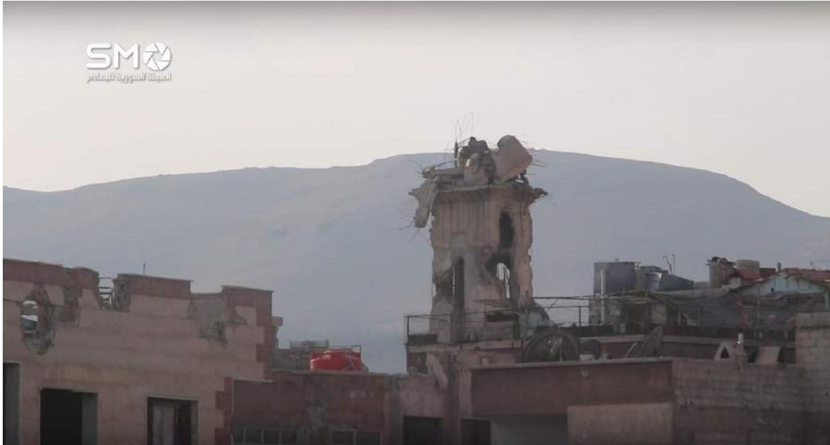
Video still of damage to the minaret of al-Sahba Abu Bakr al-Sedeiq Mosque (SMO Syria; September 5, 2016)