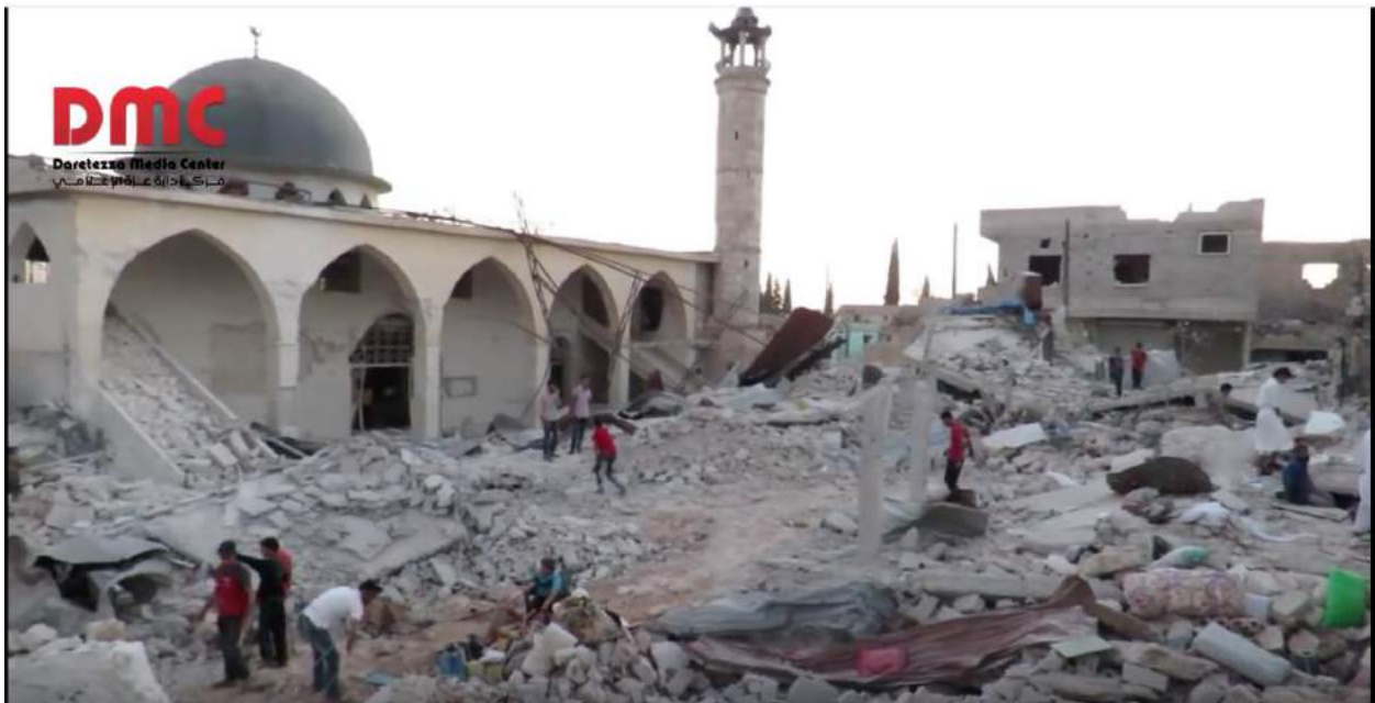
Video still of damage to exterior of al-Kabir Mosque and surrounding area (Daretezza Media Center; September 10, 2016)