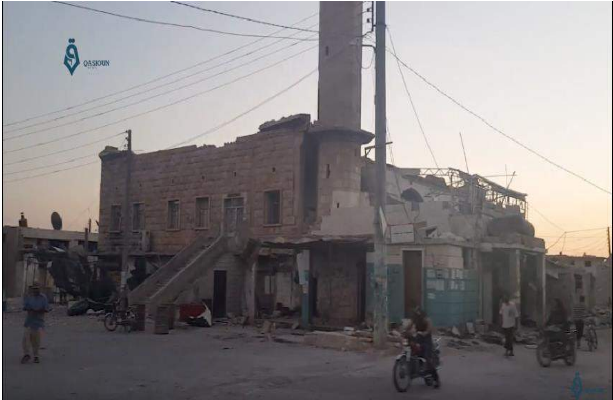
Video still shows damage to the exterior of al-Kabir Mosque (Qasioun News Agency; September 6, 2016)