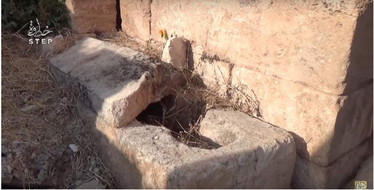
Video still of a limestone sarcophagus outside Church of Photios (September 10, 2016)