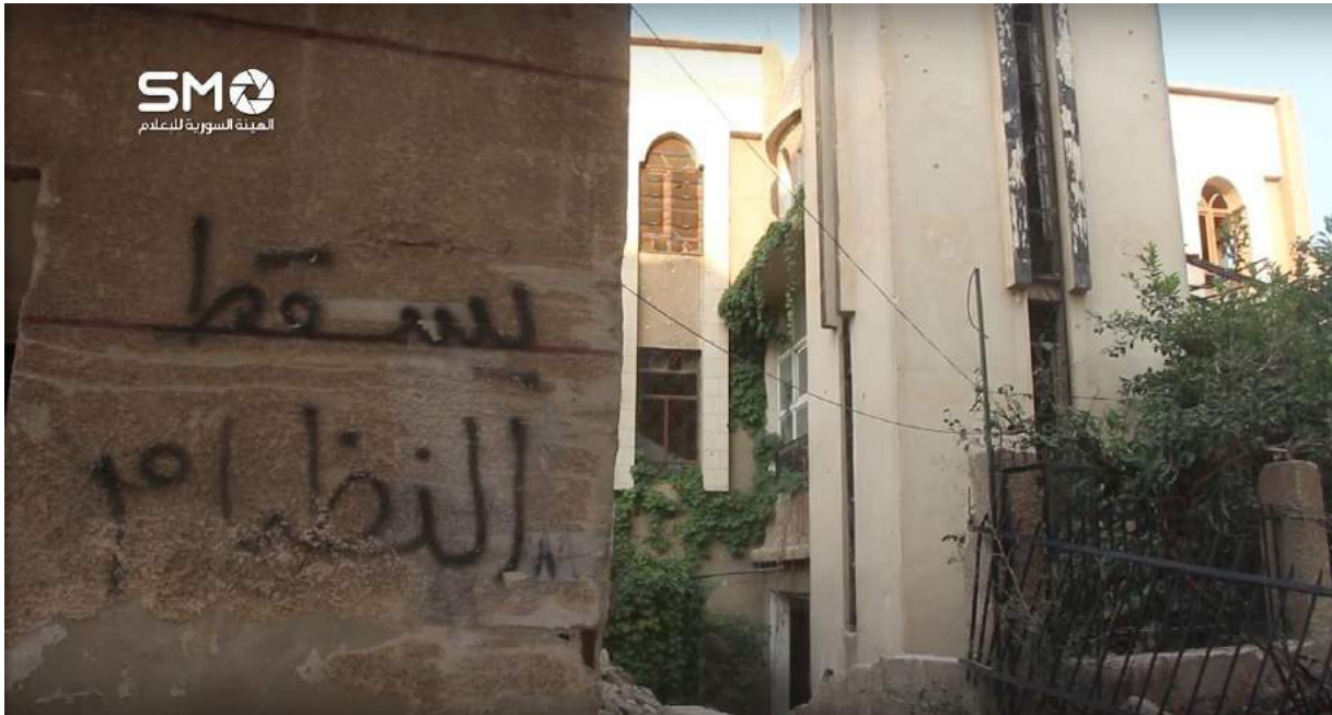
Video still of damage to the outside of al-Omari Mosque (SMO Syria; September 5, 2016)