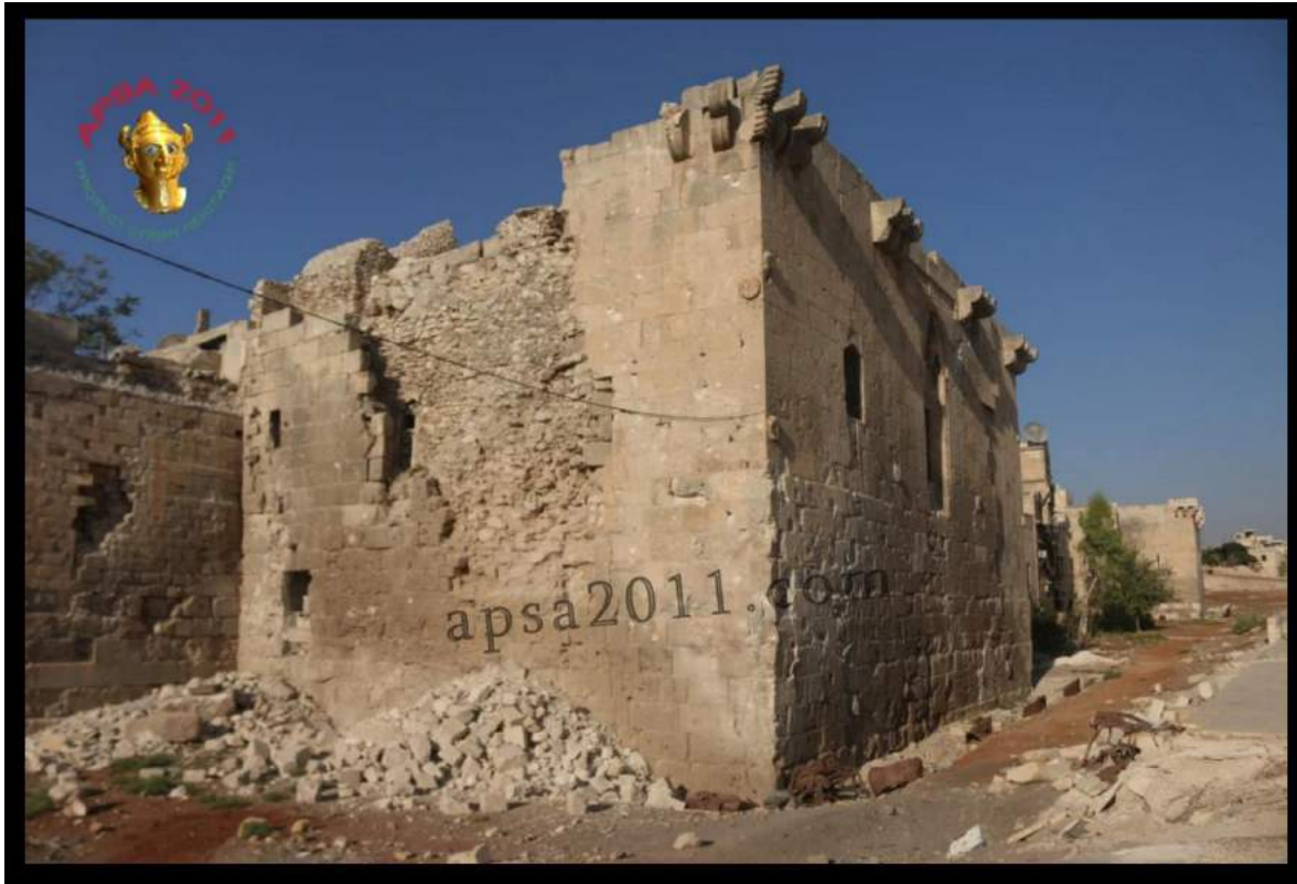
Damage to western facade of fortification tower (APSA; August 28, 2016)