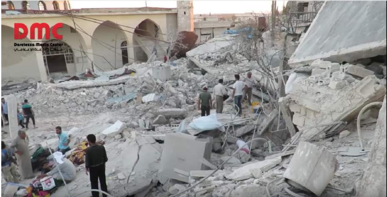
Video still of damage to area surrounding al-Kabir Mosque (Daretezza Media Center; September 10, 2016)