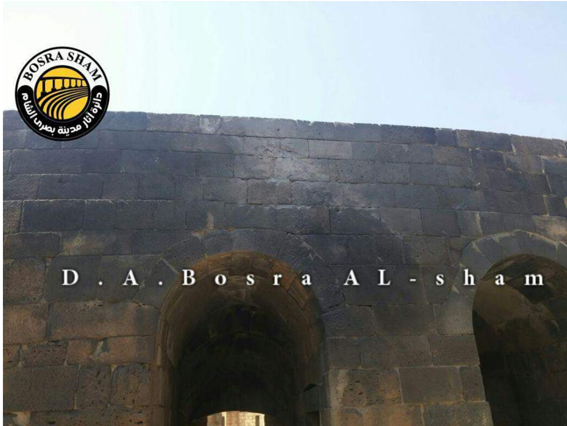
Shelling damage to the Bosra Ayyubid Citadel (Bosra Al Sham Department of Antiquities; August 22, 2016)

Burns, R. (2009) Monuments of Syria: A Guide . London: I. B. Tauris.