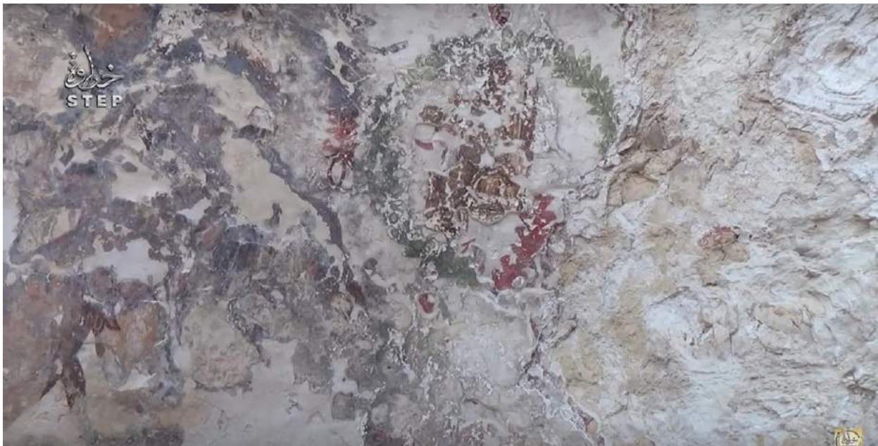
Video still of wall mural in north-east corner of mithraeum (Step News Agency; September 10, 2016)